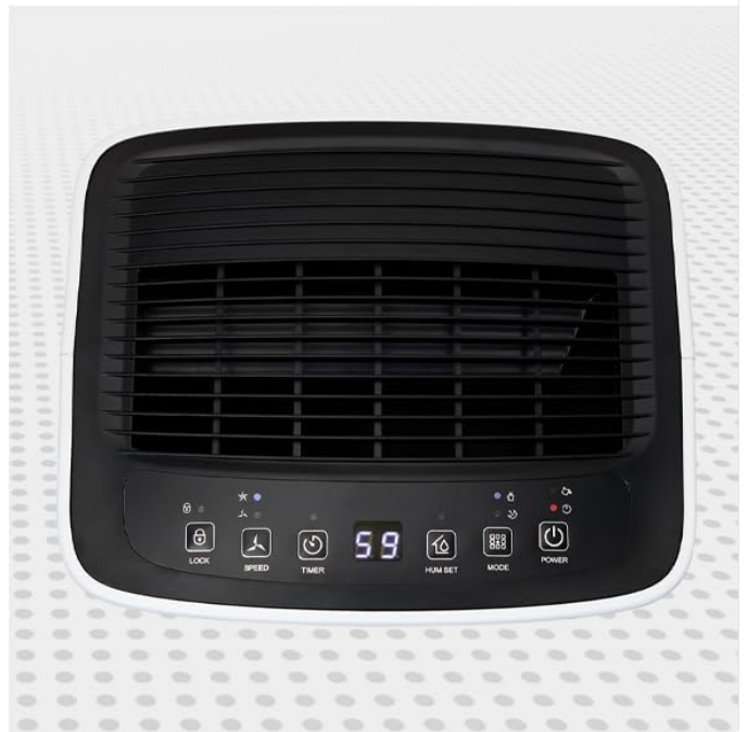
Figure 5: Multi-Angle View of the Dehumidifier