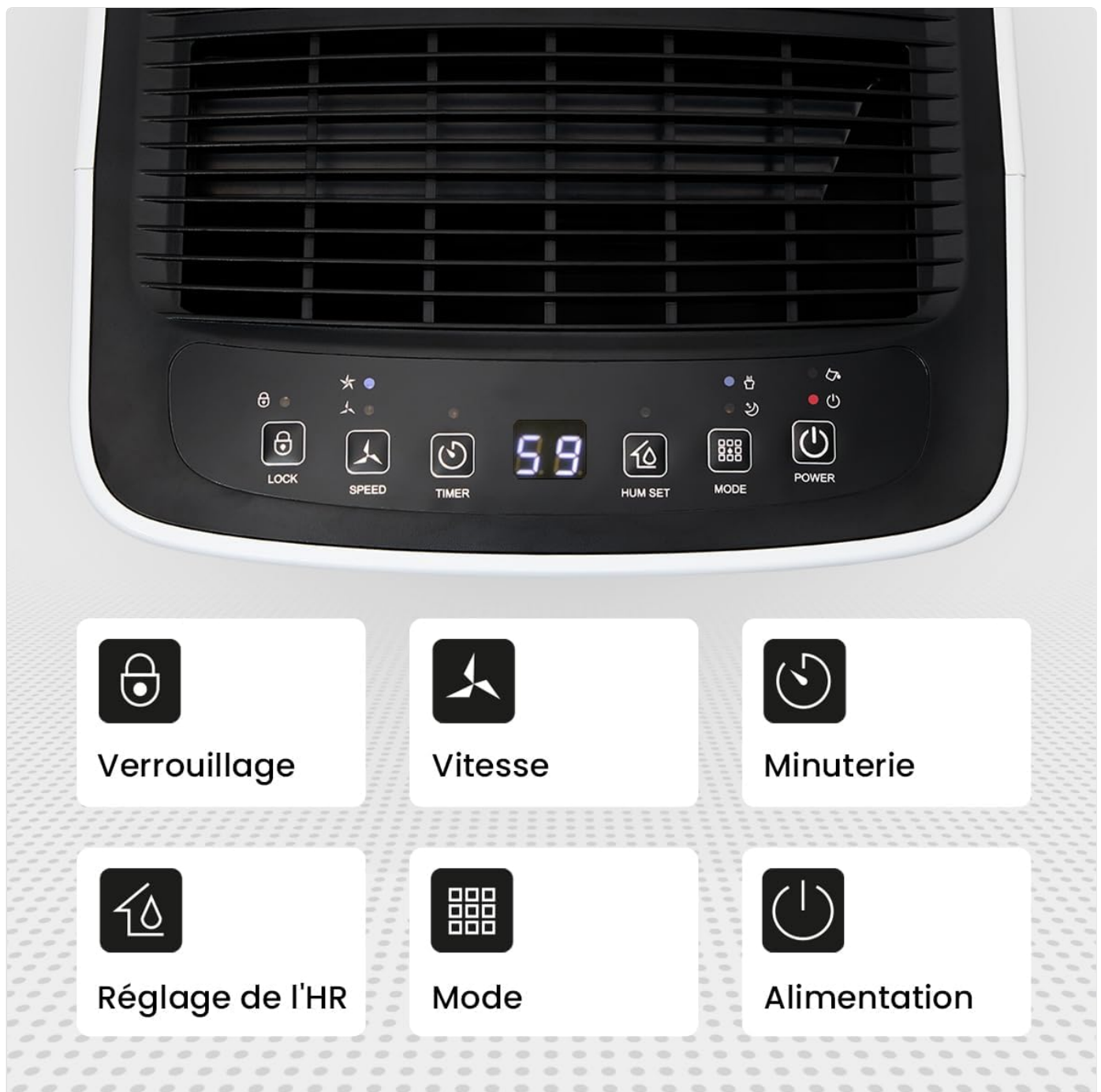
Figure 6: Control Panel Overview