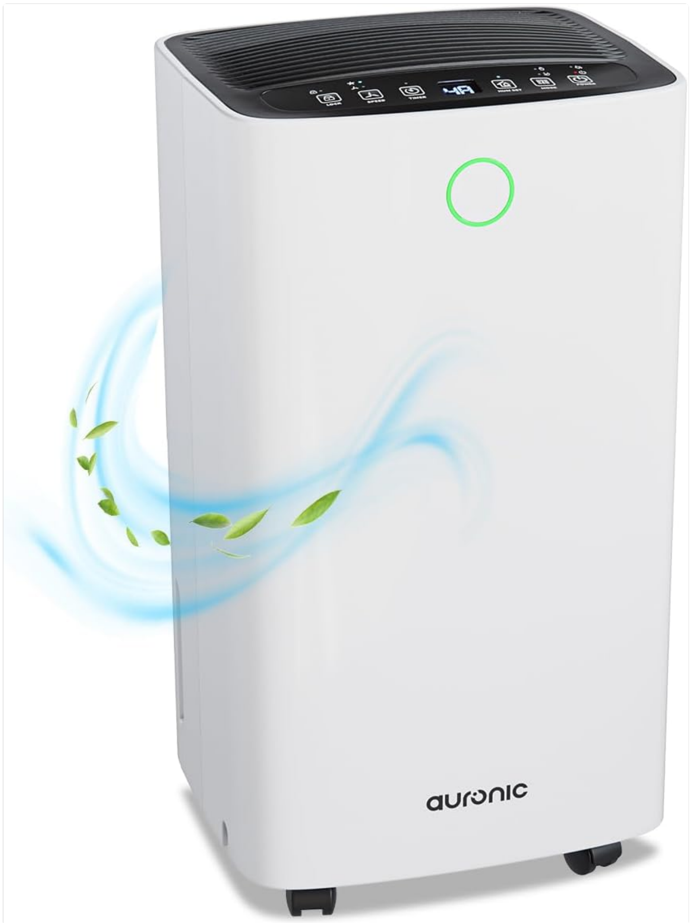
Figure 1: Auronic Electric Air Dehumidifier (Model AU3129 12L)