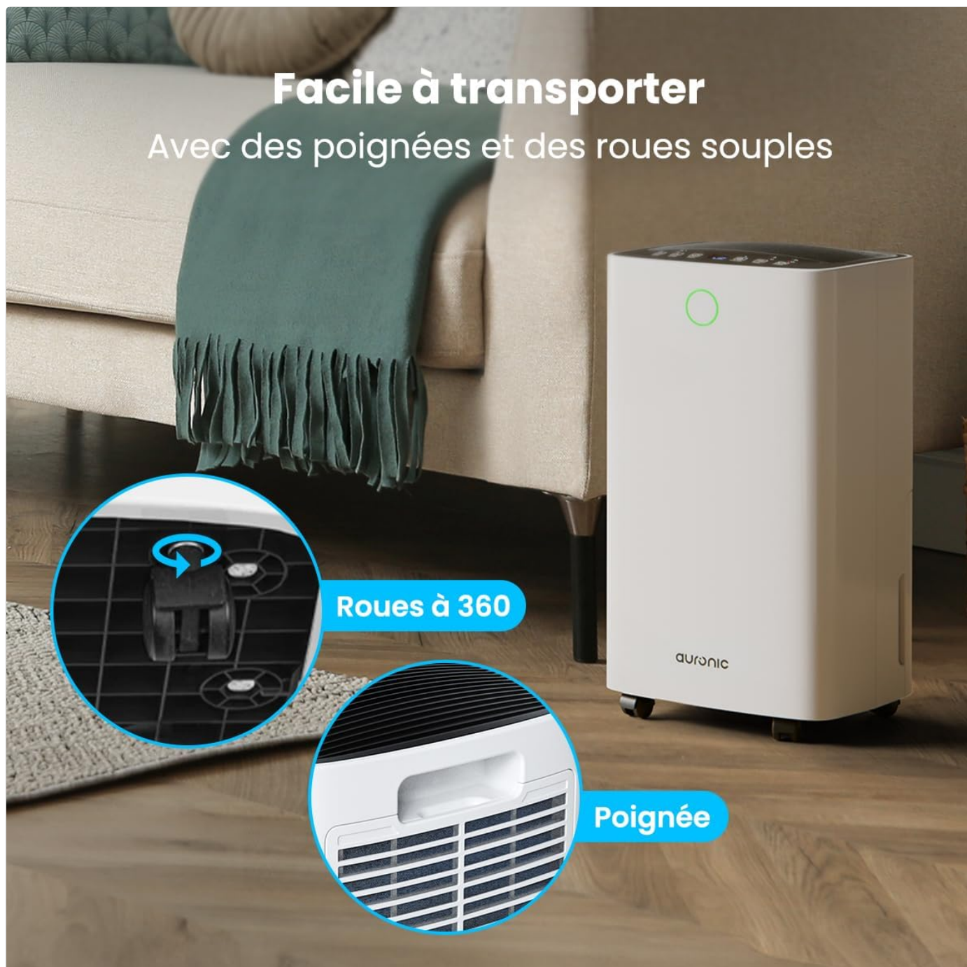
Figure 4: Easy Portability with Wheels and Handle