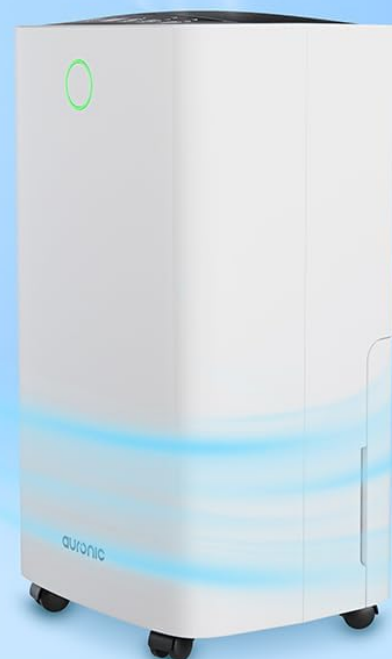
Figure 2: Humidity Reduction Effectiveness