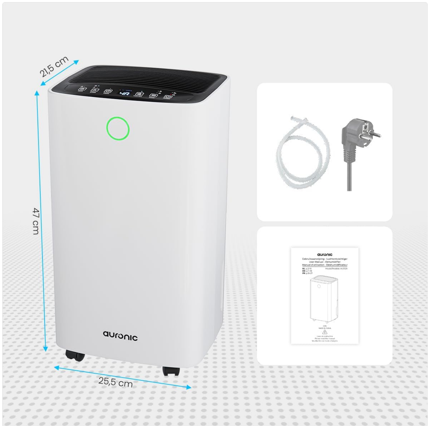
Figure 3: Dehumidifier Dimensions and Included Accessories

Familiarize yourself with the components of your Aurolic Dehumidifier.