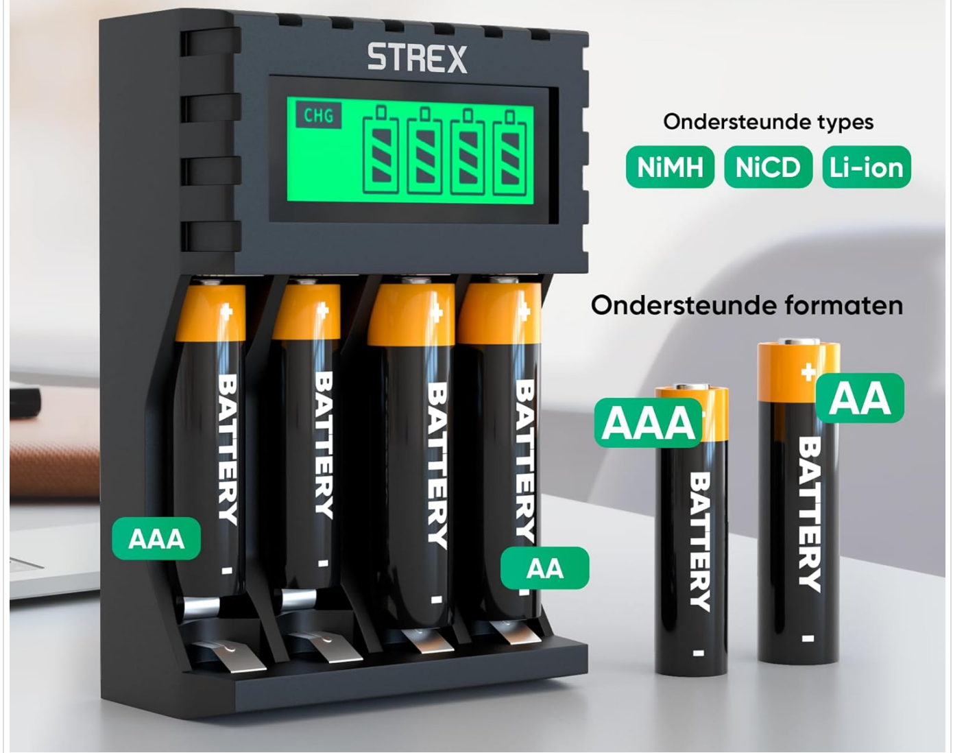
Image: The charger's compatibility with both AA and AAA battery sizes, and a list of supported battery types (NiMH, NiCD, Li-ion).