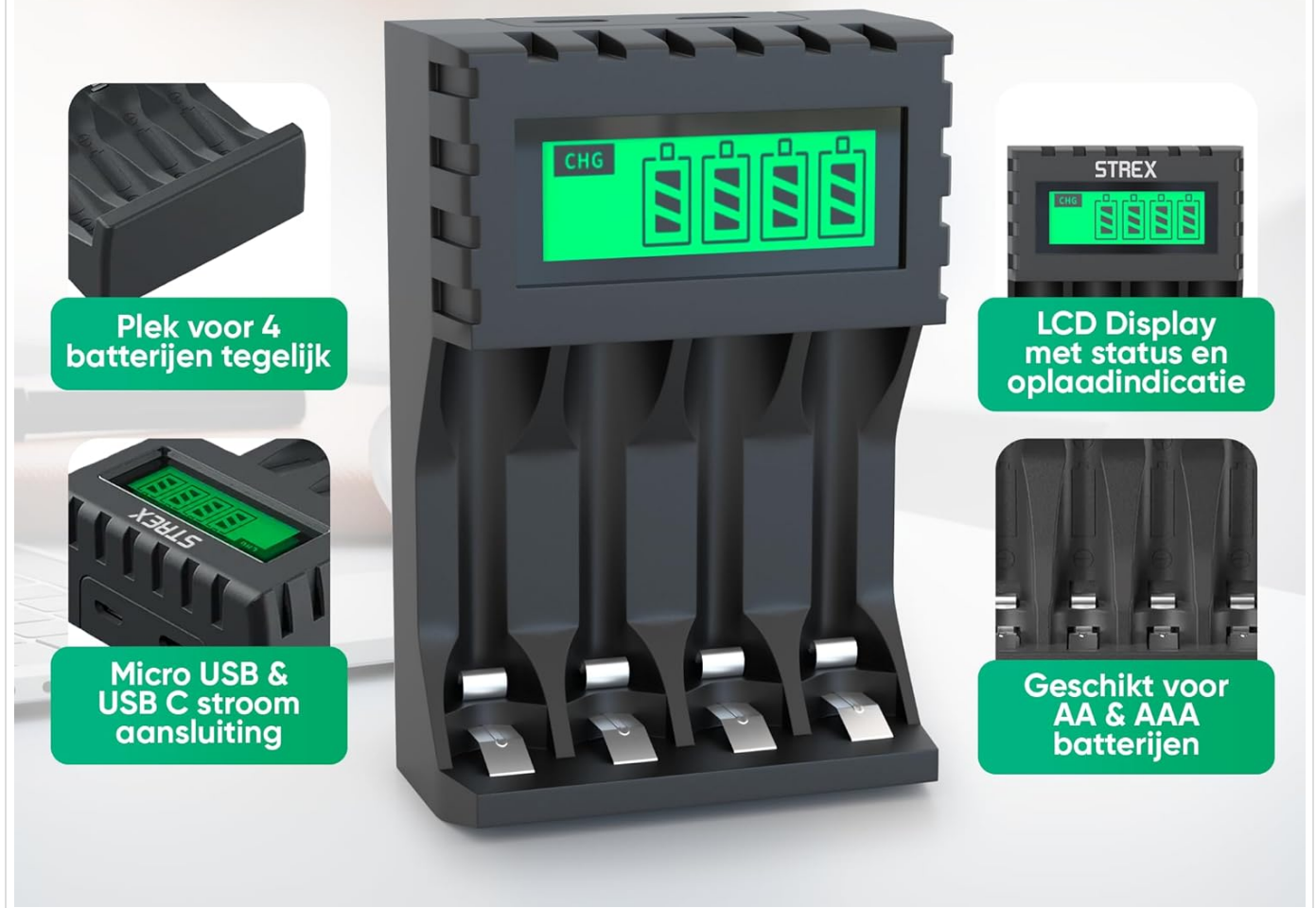
Image: The charger's user-friendly design, illustrating the four battery slots and the Micro USB and USB-C input ports for power connection.