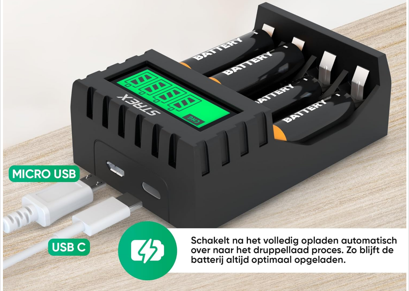
Image: The smart charging process, showing how each charging port is independently managed and charged, with both Micro USB and USB-C input options visible.

Efficient & slim laadproces waarbij elke oplaadpoort apart van elkaar wordt gemeten en opgeladen