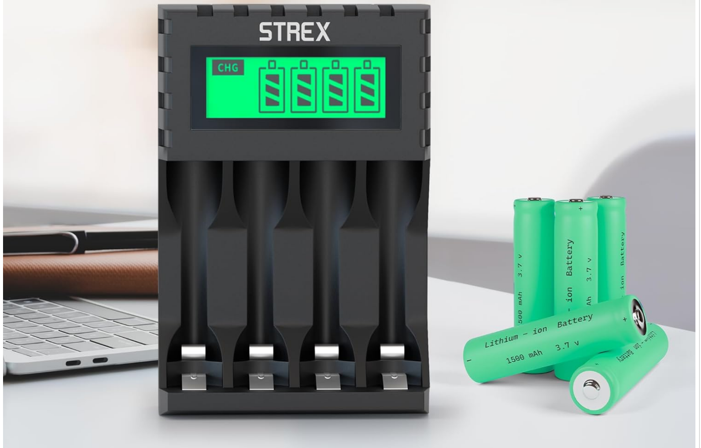
Image: The Strex charger highlights its comprehensive safety features, including protection against overcharging, overcurrent, flame, voltage fluctuations, and short circuits.