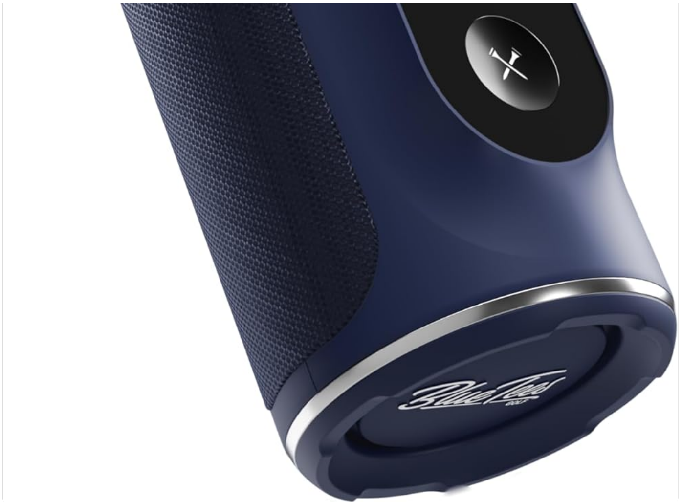
Image: The Blue Tees Golf Player+ GPS Speaker, showcasing its sleek design and integrated display.