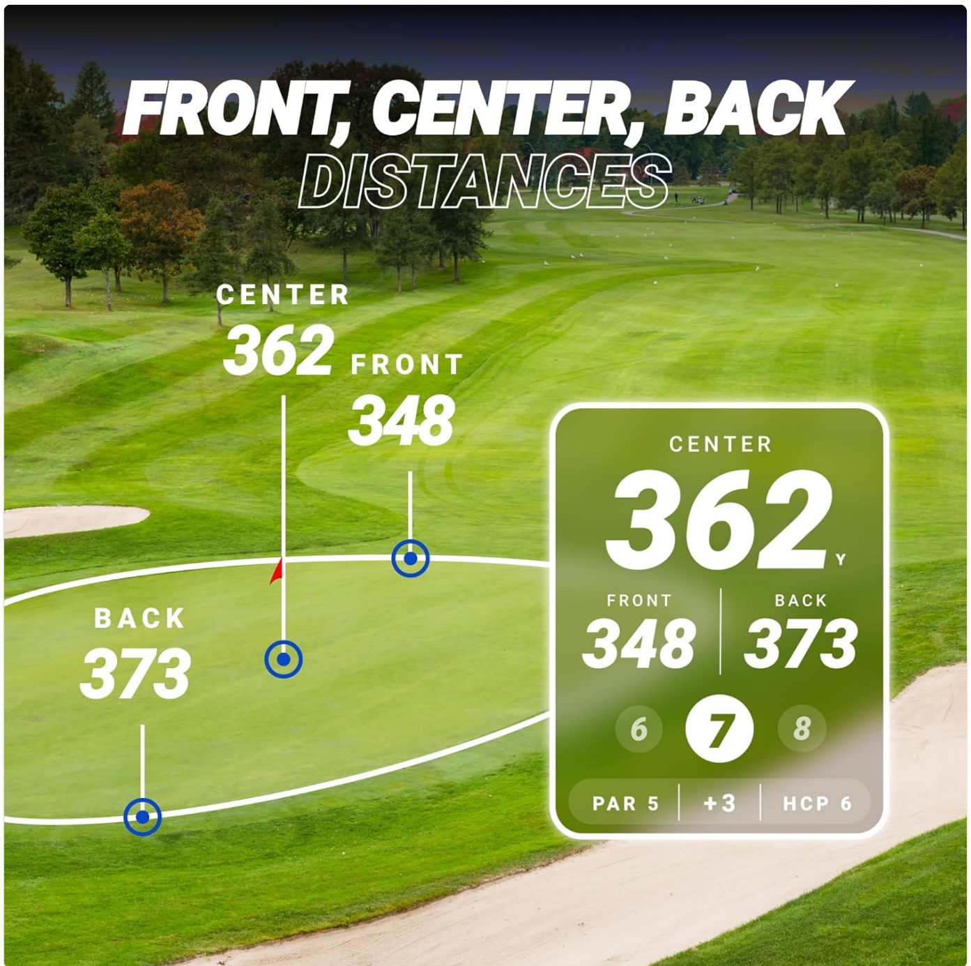
Image: Visual representation of Front, Center, and Back yardages on a golf course.

Once a course is selected (automatically or manually via the app), the device will display accurate distances to the front, center, and back of the green. Audible distances can be activated by pressing the action button.