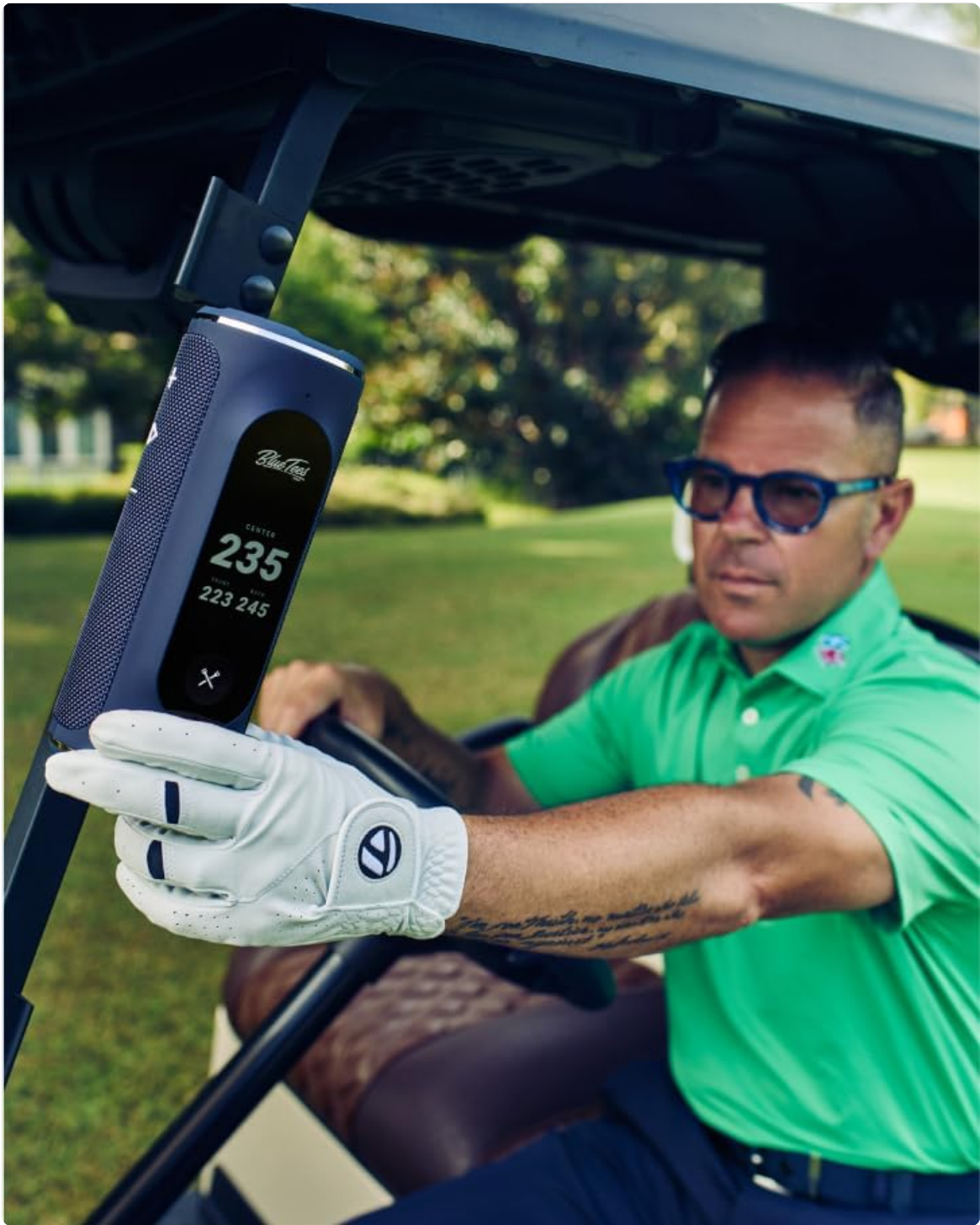
Image: Player+ securely mounted to a golf cart using its magnetic strip.