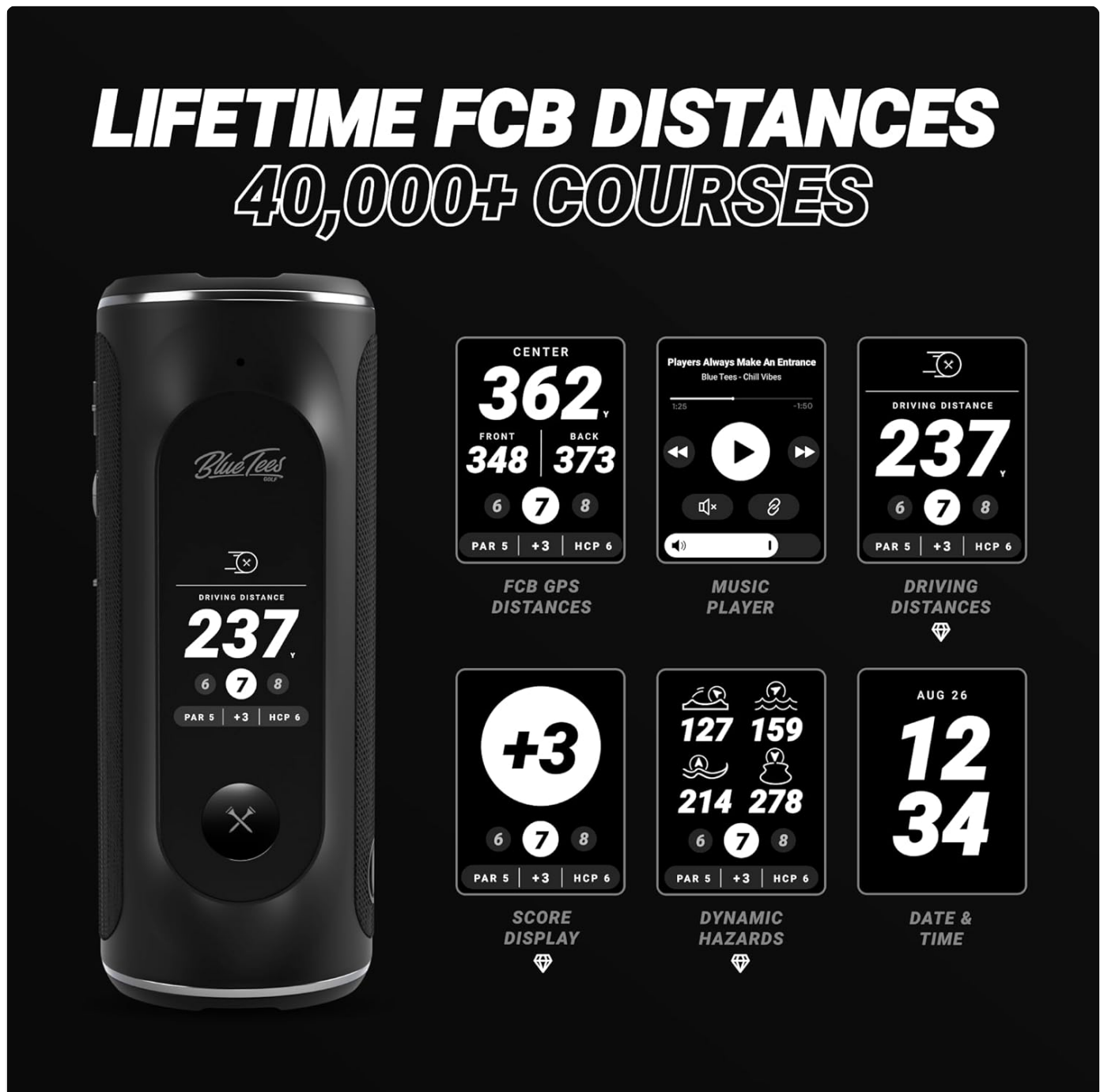
Image: Overview of the Player+ display modes, including GPS, music, and scorekeeping.

The Player+ features a responsive touch screen. Swipe left/right or tap icons to navigate through different modes and settings.