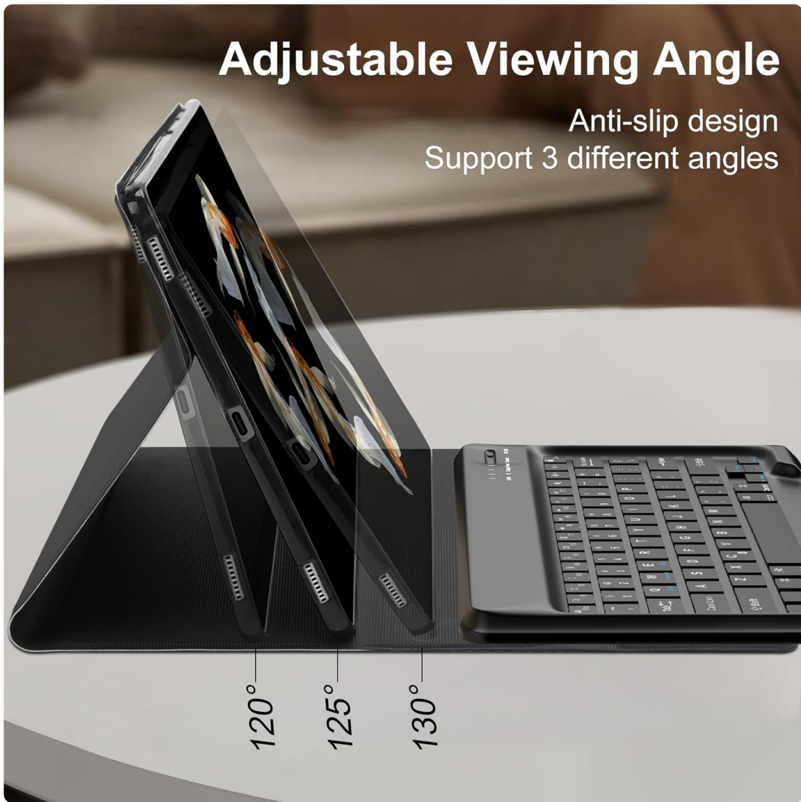
Image: The adjustable viewing angles feature, highlighting the anti-slip design and the three distinct positions for comfortable use.

Anti-slip design Support 3 different angles