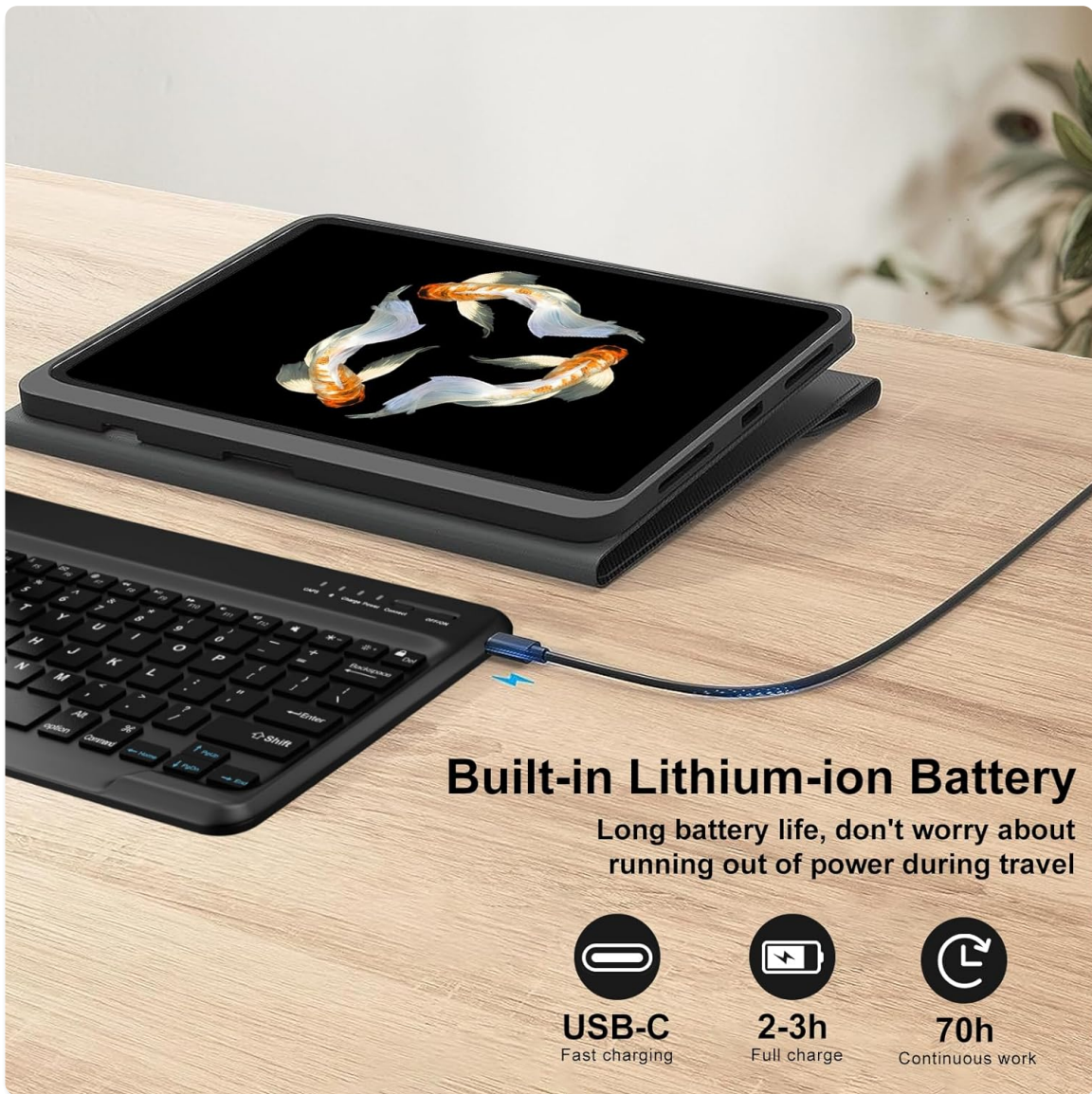
Image: Details on the keyboard's built-in lithium-ion battery, illustrating its USB-C charging port and battery life specifications.