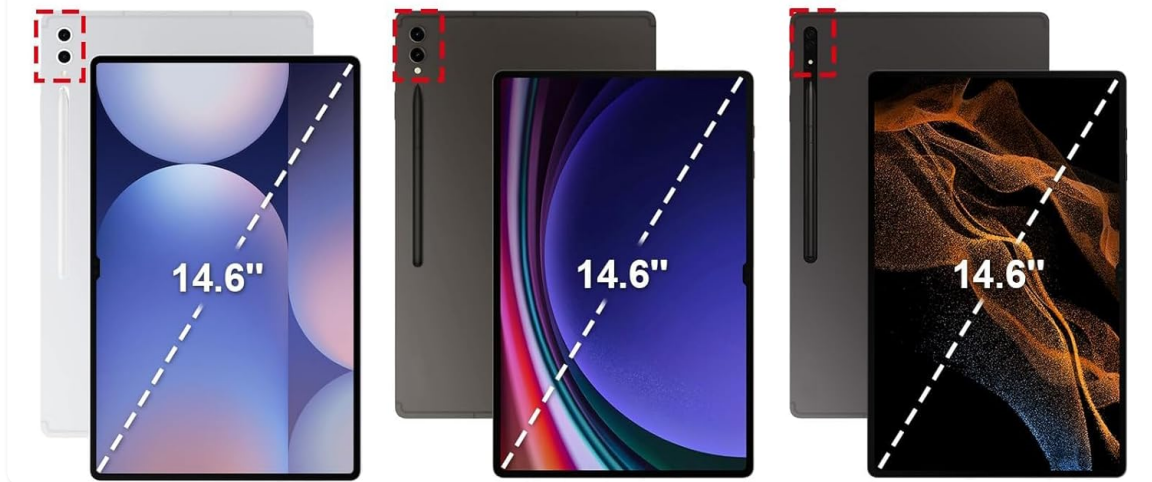
Image: Compatibility chart showing the supported Samsung Galaxy Tab Ultra models (S10, S9, S8) and their respective model numbers, confirming the 14.6-inch screen size.