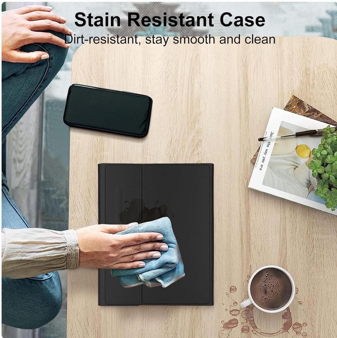
Image: Demonstration of the case's stain-resistant surface, being easily cleaned with a cloth.