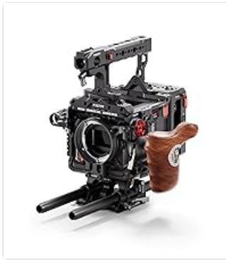
Figure 3.1: Exploded view showing the modular components of the camera cage and how they fit around the RED KOMODO-X camera body.