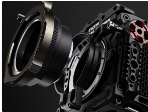
Figure 3.4: A clamp-based lens adapter support provides secure and firm mounting for various lens setups.