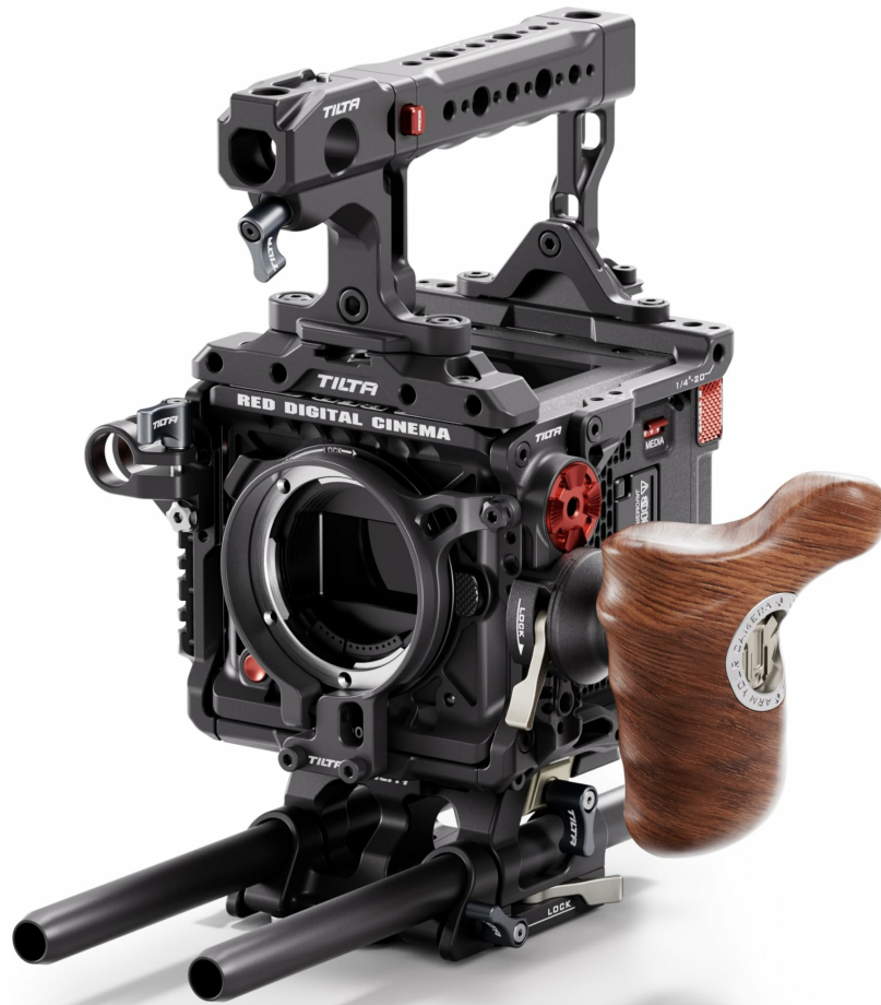
Figure 1.1: Tilta Full Camera Cage Basic Kit for RED KOMODO-X, fully assembled with camera and external monitor.