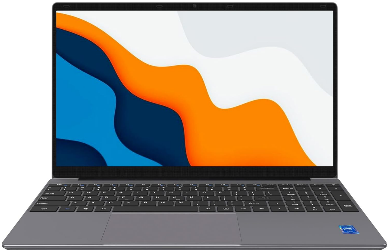
Figure 1: ApoloMedia NJP1561P Laptop with its sleek design.