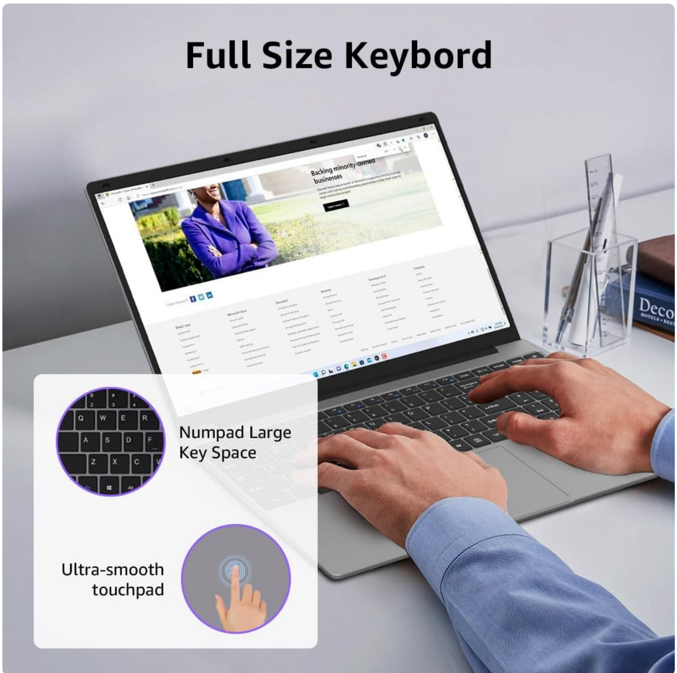
Figure 4: Close-up of the full-size keyboard and ultra-smooth touchpad on the ApolloMedia NJP1561P laptop.