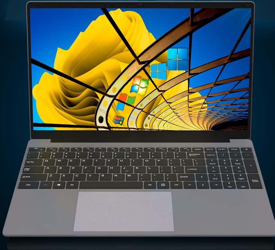
Figure 3: The 15.6-inch Full HD IPS display of the ApoloMedia NJP1561P laptop.