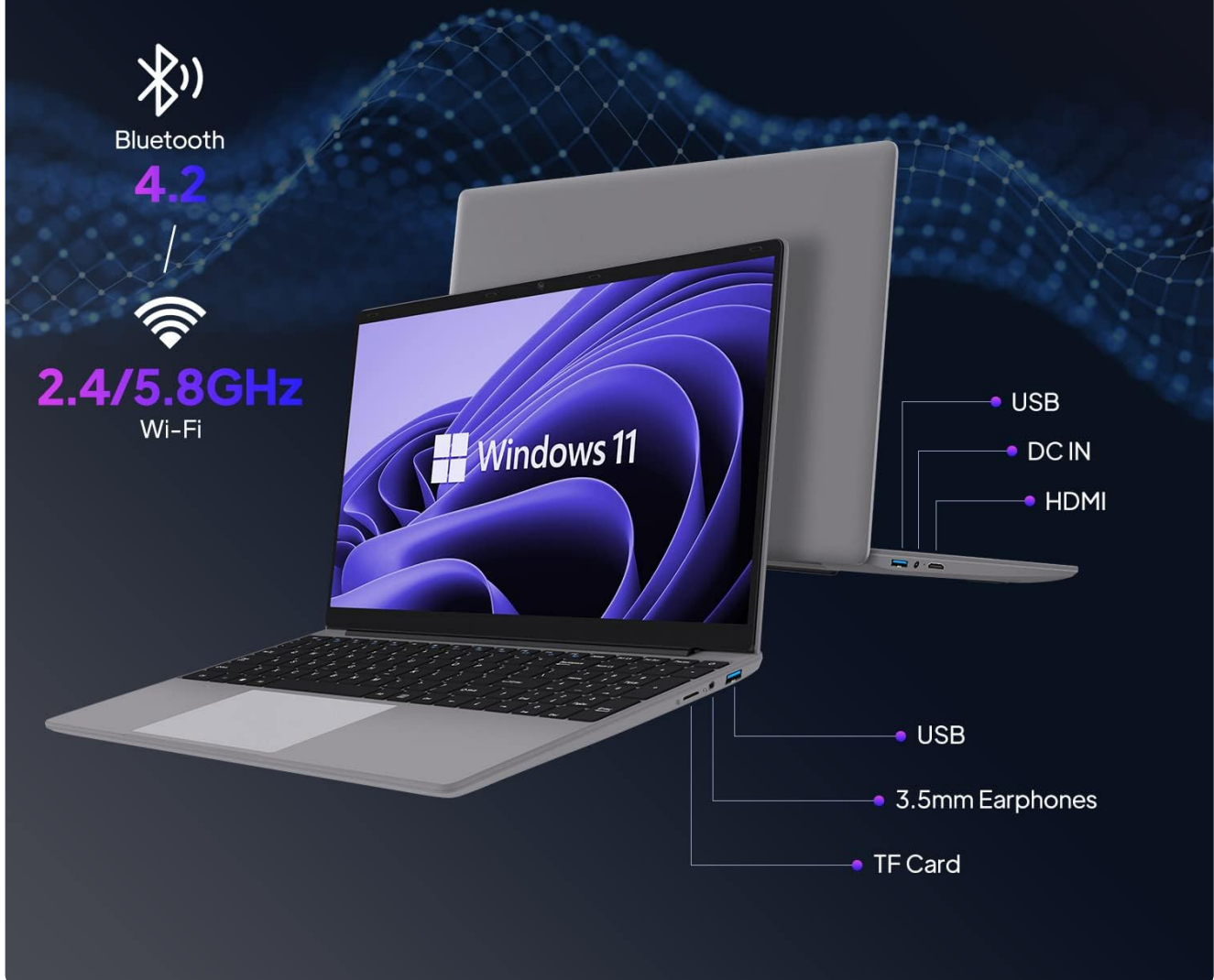
Figure 2: Illustration of the various connectivity ports on the ApoloMedia NJP1561P laptop.