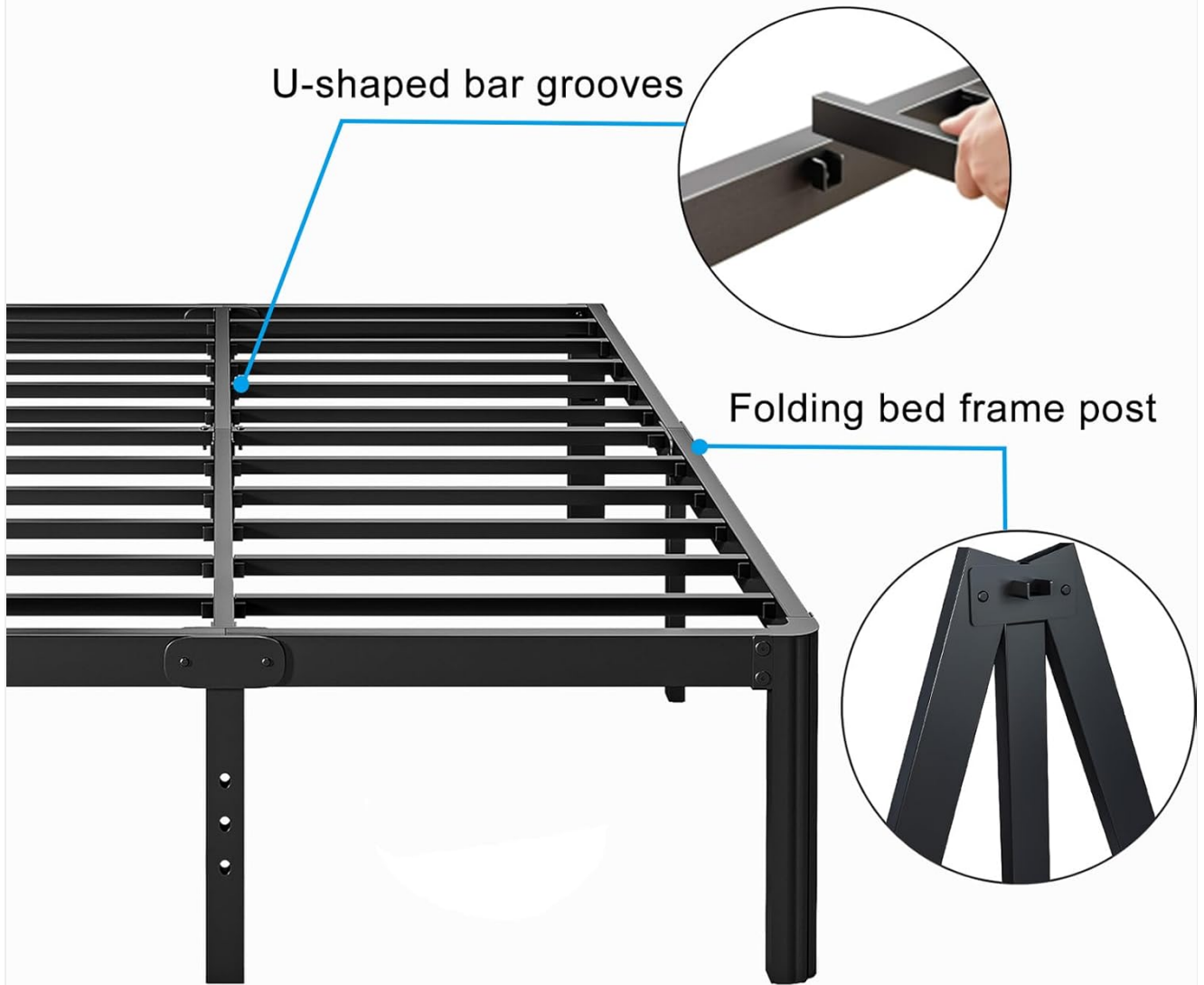
Image: Detail showing the U-shaped bar grooves for slat insertion and the folding mechanism of the bed frame posts, designed for easy assembly.