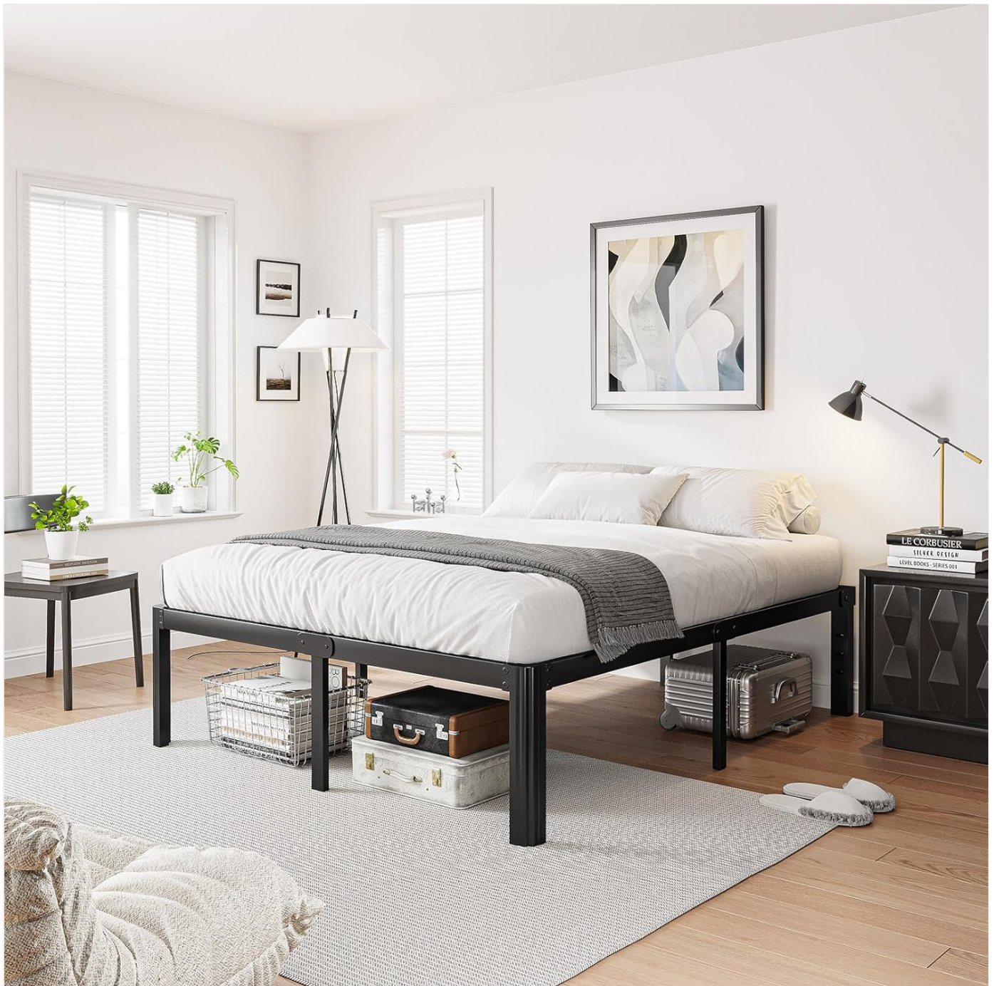
Image: The fully assembled Nordicbed Queen Platform Bed Frame, ready for a mattress, shown in a bedroom environment.