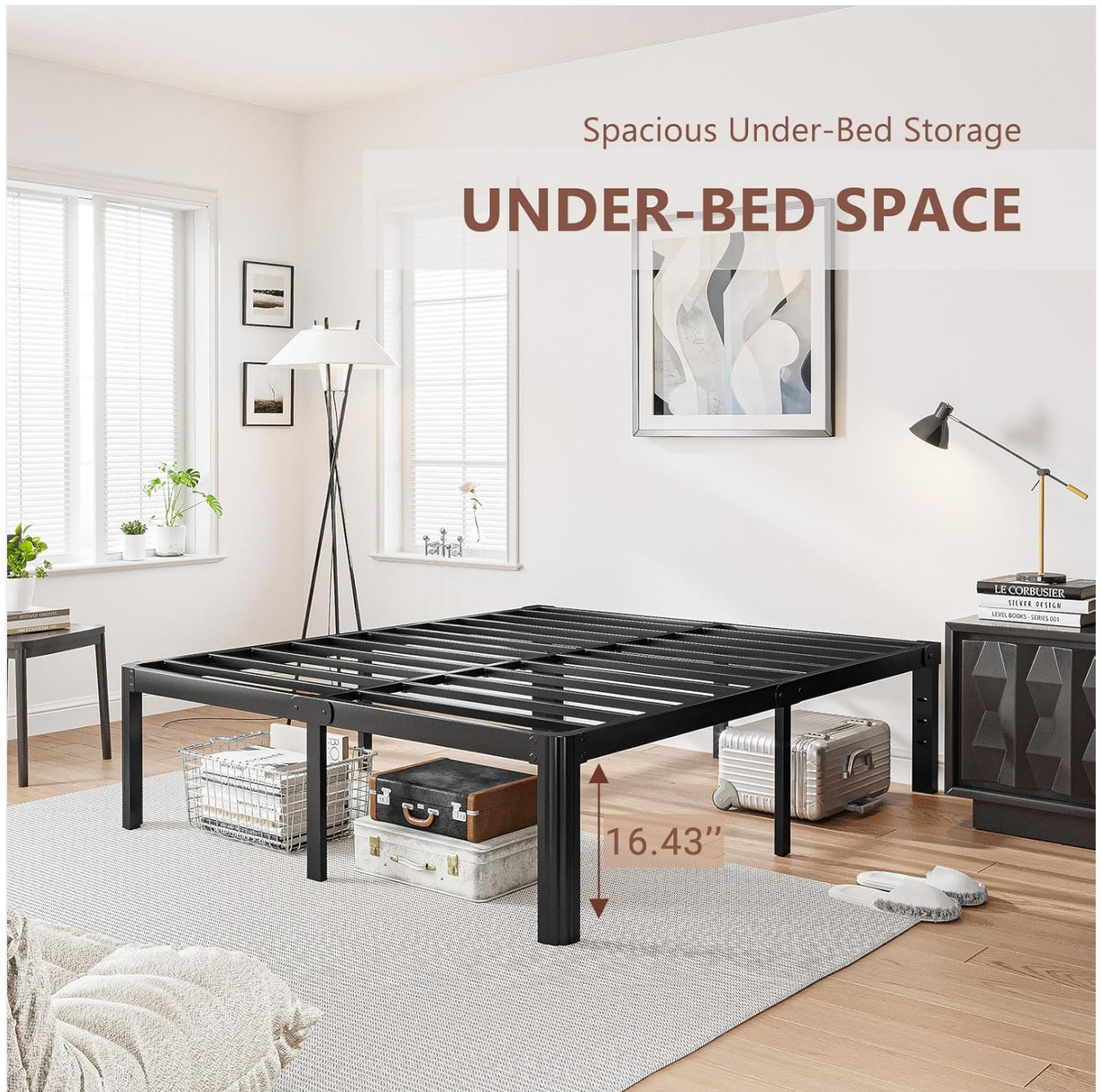
Image: The bed frame positioned in a room, illustrating the significant under-bed clearance available for storage.

With an 18-inch height, this bed frame offers ample under-bed storage space, approximately 16.43 inches of clearance. This allows for convenient storage of bins, luggage, or other items, helping to keep your bedroom organized and clutter-free.