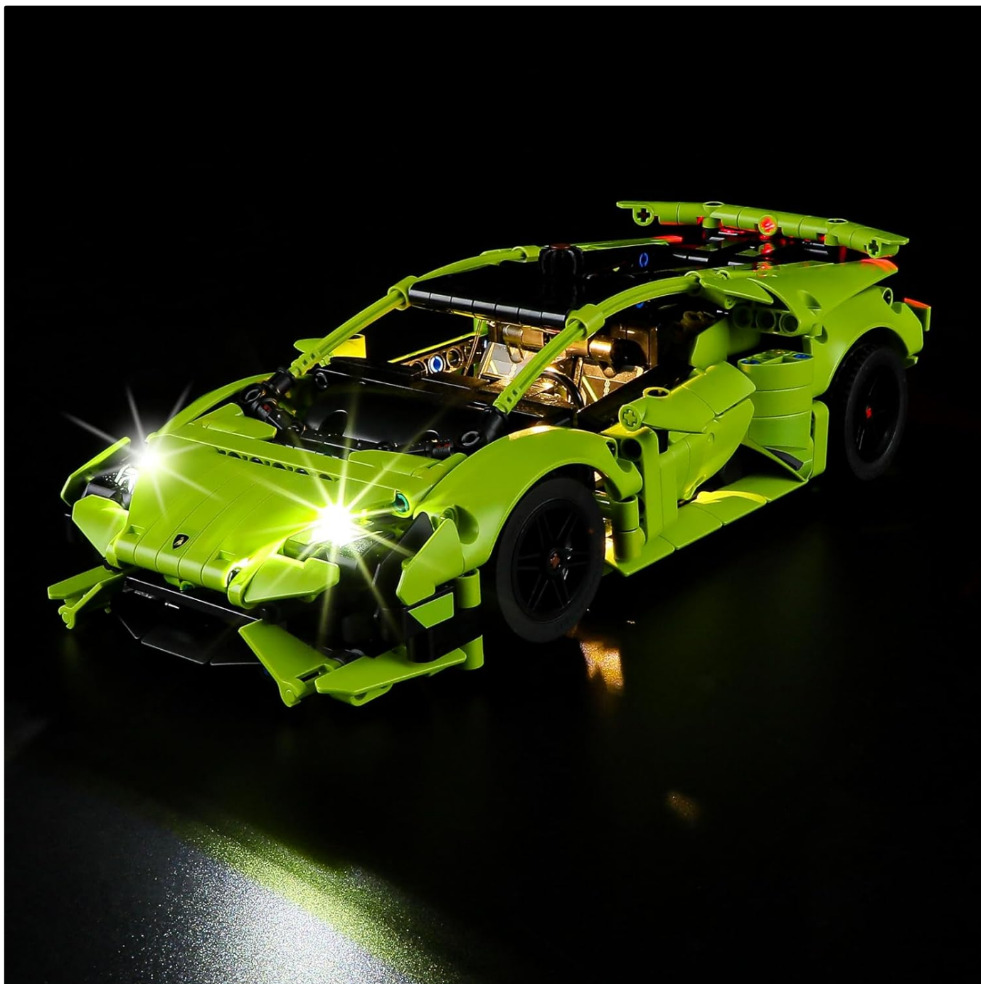
Image: The LEGO Lamborghini Huracán Technic model with the YEABRICKS LED lights fully operational, showcasing the bright headlights and subtle interior illumination against a dark background.