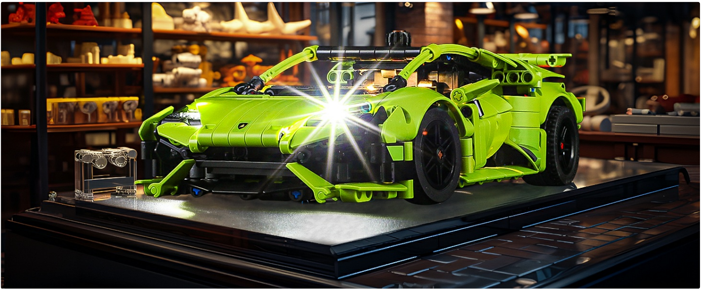
Image: A composite image displaying close-up details of the illuminated front lights, the glowing interior, and the vibrant rear lights of the LEGO Lamborghini Huracán Technic model after the light kit installation.