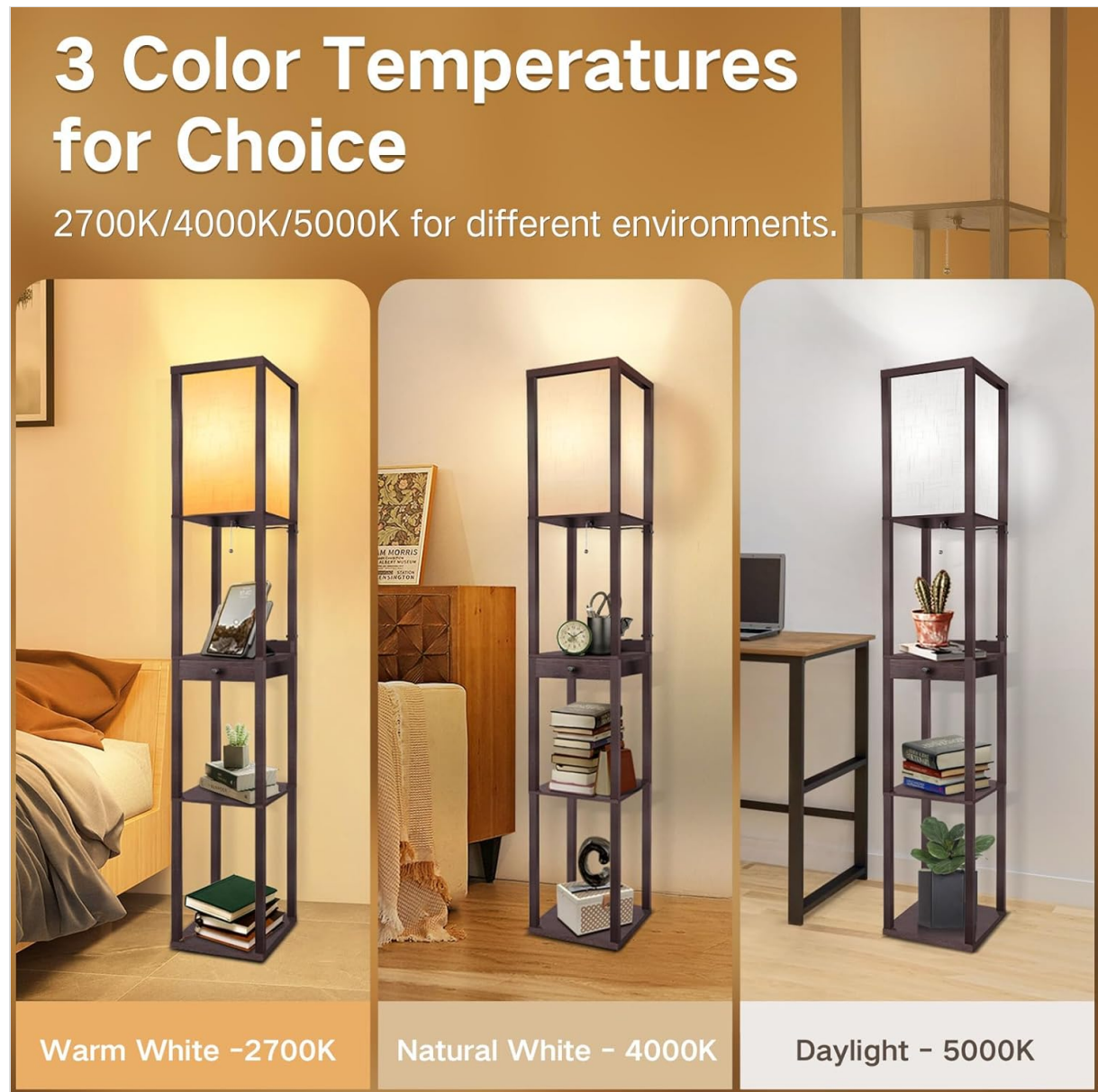
Figure 5.1: Three adjustable color temperatures.