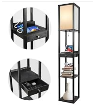
Figure 4.5: Attaching additional shelf boards.