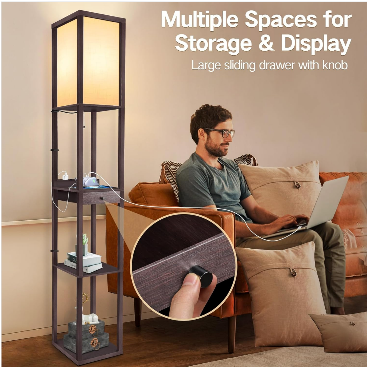
Figure 5.3: Storage shelves and drawer.