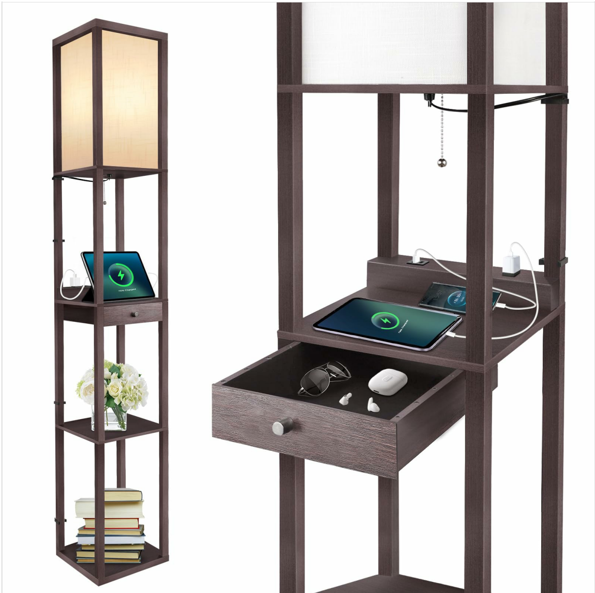
Figure 5.2: Integrated 4-in-1 charging station.

Simply plug your devices into the appropriate ports. The charging station is always active when the lamp is plugged into a wall outlet.