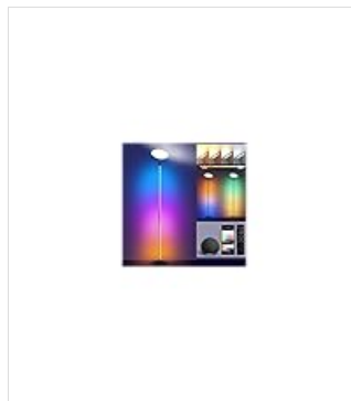
Figure 4.2: Attaching lamp pole sections.