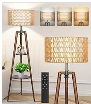
Figure 4.7: Securing the lampshade.