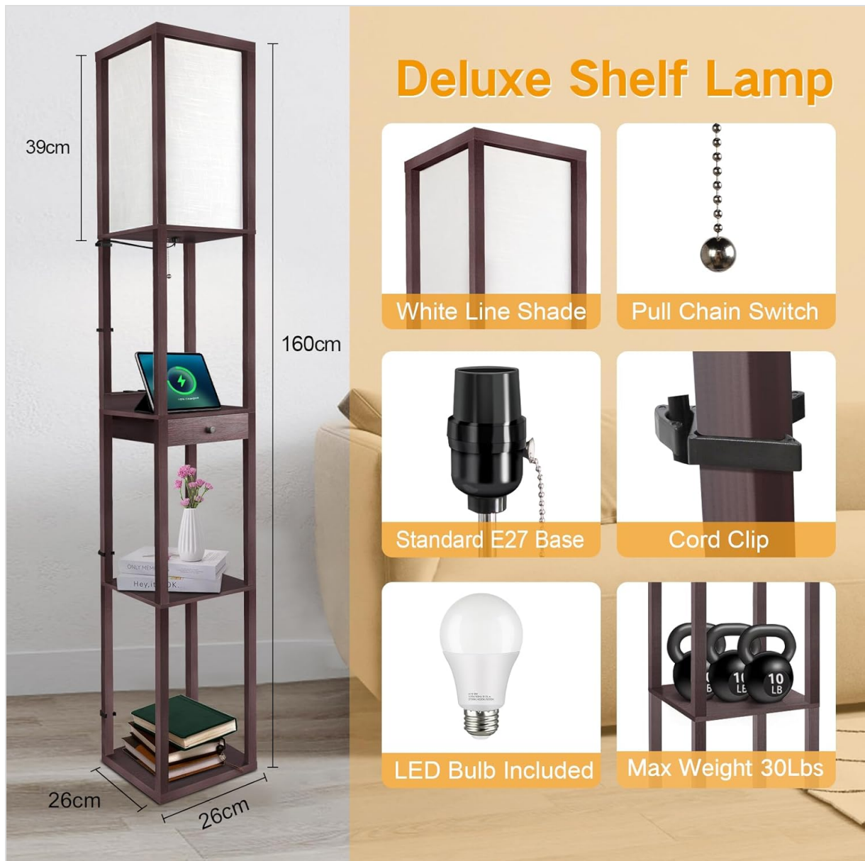
Figure 8.1: Product dimensions and features.