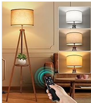
Figure 4.6: Installing the LED bulb.