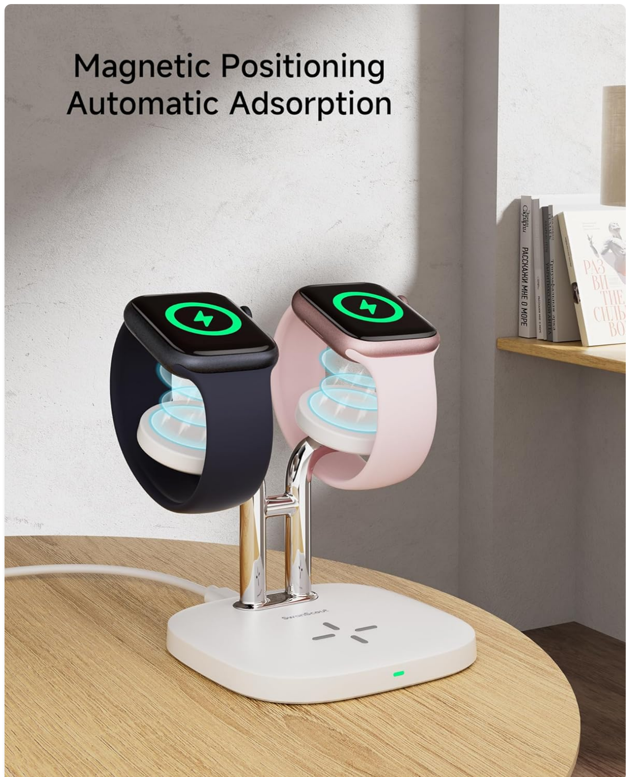
Image: Magnetic positioning feature for secure and automatic alignment of Apple Watches on the charging modules.

Video: Shows the SwanScout 704A charging station in action, highlighting its dual Apple Watch and earbud charging capabilities.