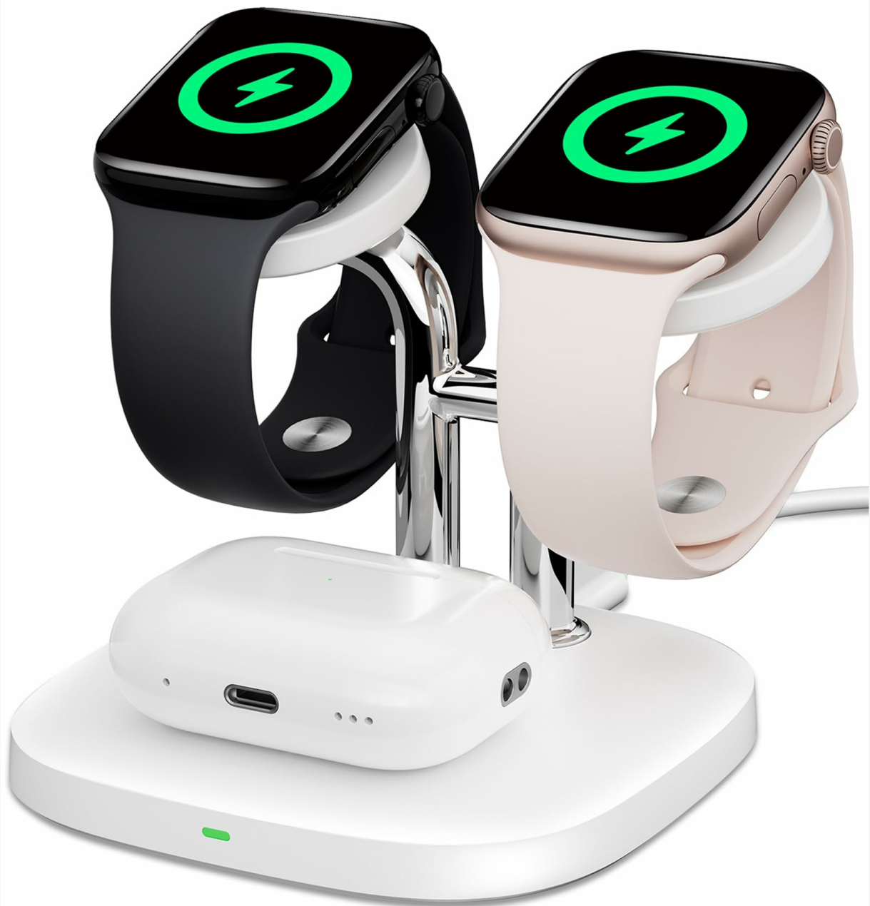
Image: The SwanScout 704A charging station in use, demonstrating proper cable connection and device placement.