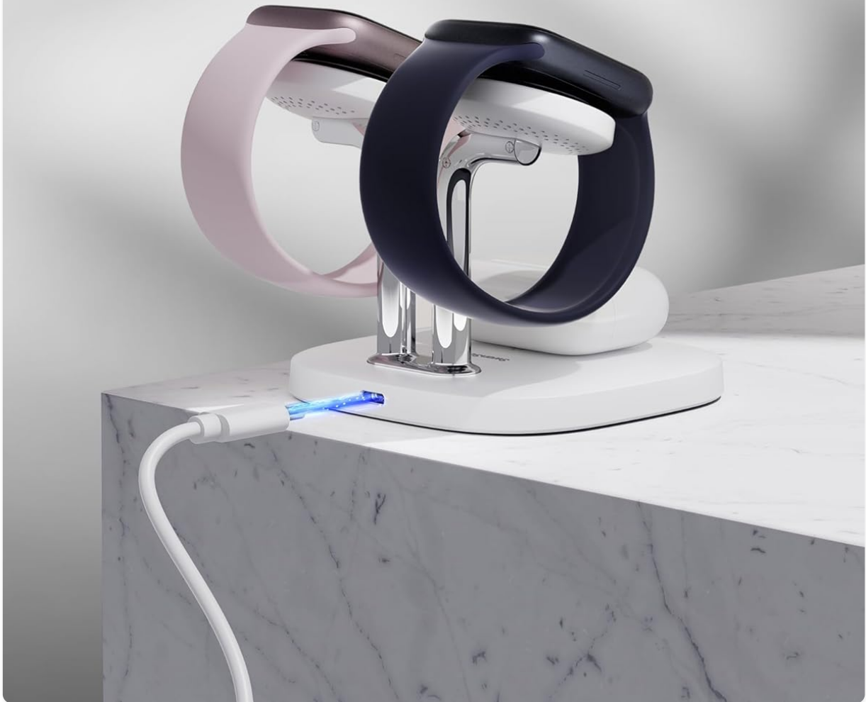
Image: One-step charging setup, requiring only a single cable for all devices.

Only one charging cable required (included)