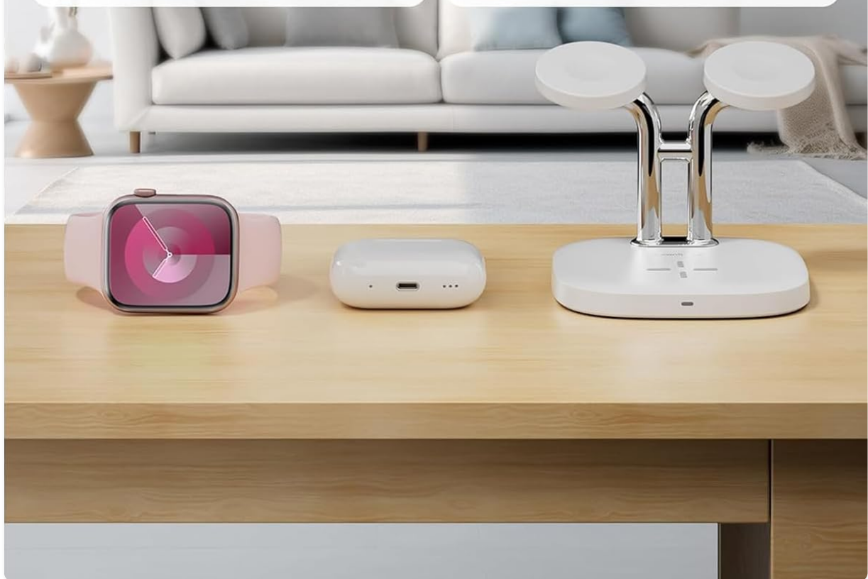
Image: Visual representation of the charging station's universal compatibility with Apple Watches and earbuds.

Ps: And other earbuds that support wireless charging