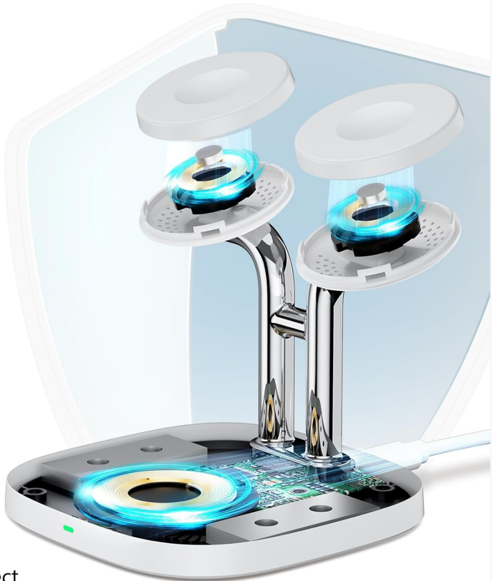
Image: Illustration of the various safety features integrated into the charging station.