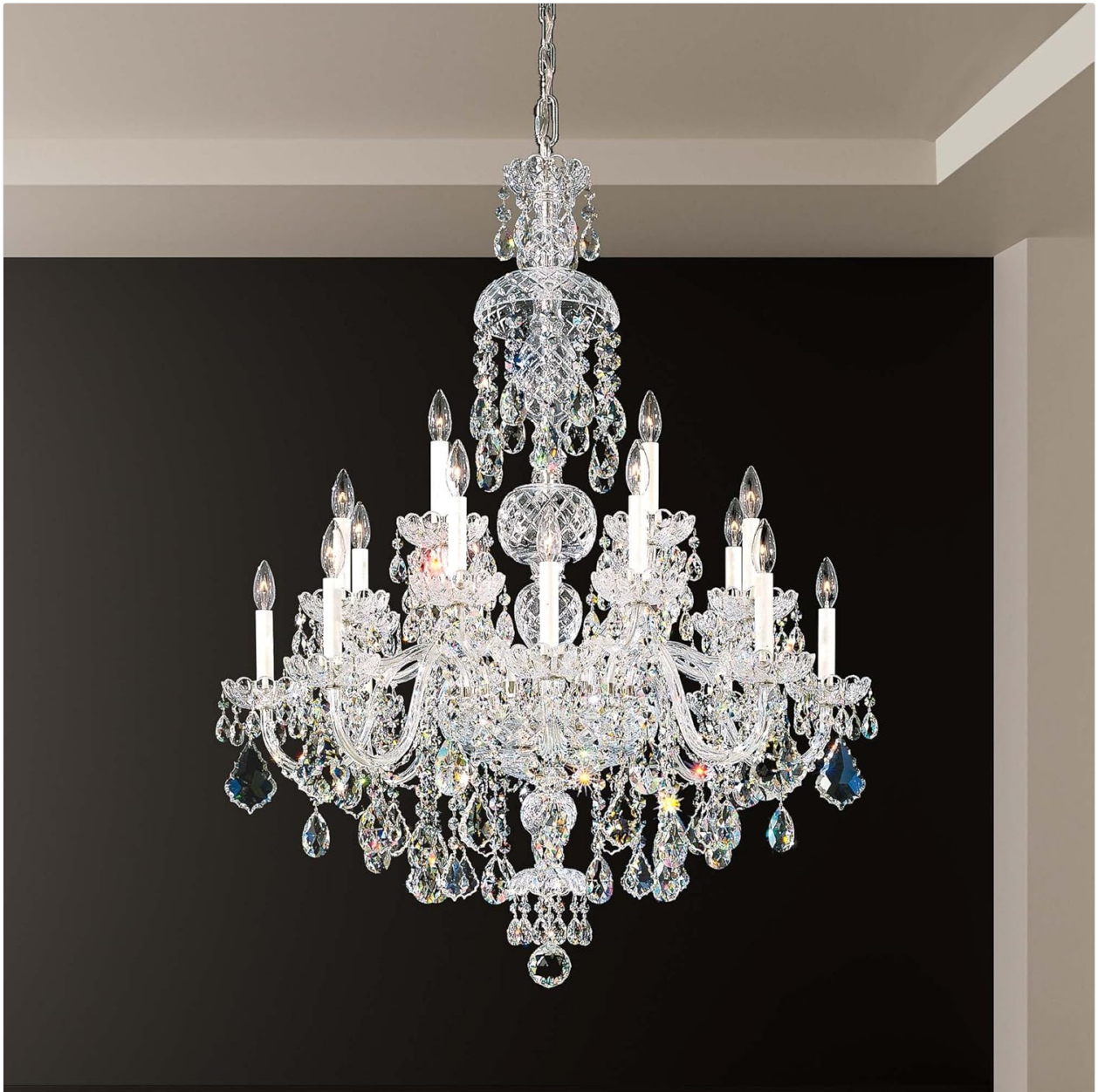
Figure 1: Schonbek Signature 6860-40H Olde World Chandelier.