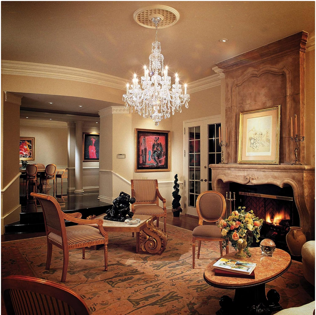
Figure 4: Crystal Selections (Heritage Handcut Crystal is featured in this model).