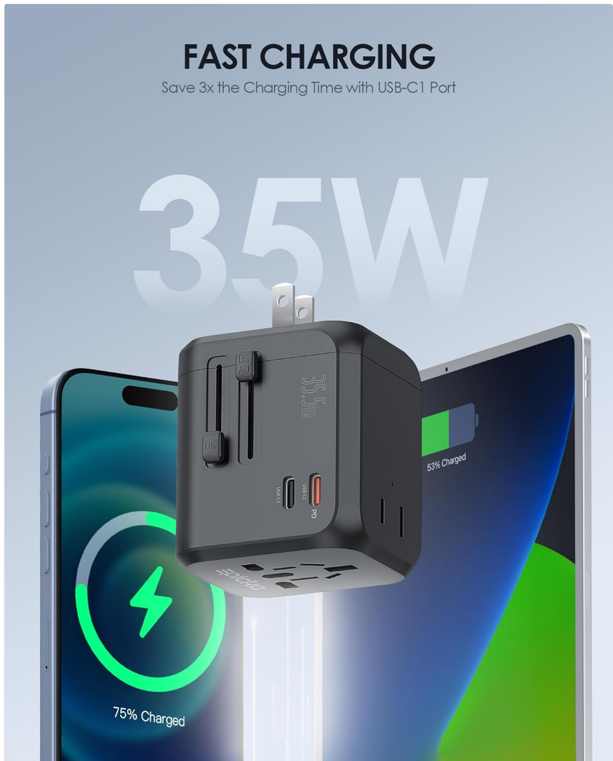
Image: The EPICKA adapter connected to a smartphone and tablet, illustrating its 35W fast charging capability for quick power delivery.