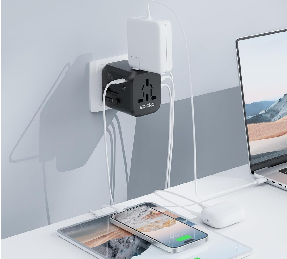
Image: The EPICKA Universal Travel Adapter connected to a wall outlet, simultaneously charging a laptop, tablet, and smartphone, demonstrating its 7-in-1 capability.