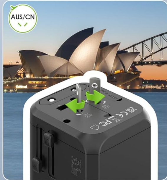
Image: Close-up views of the EPICKA Universal Travel Adapter demonstrating how to extend and retract the different regional plug pins (EU/KR, UK, US/JP, AUS/CN).