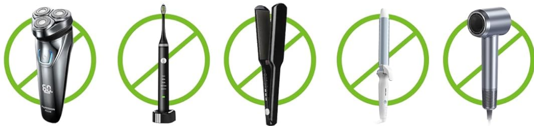
Image: Visual guide illustrating the compatibility of the EPICKA adapter with different AC outlet types (Type B, C/J/L/N, A, G, I, E/F) and a clear warning that it is not a voltage converter, showing incompatible high-power devices.