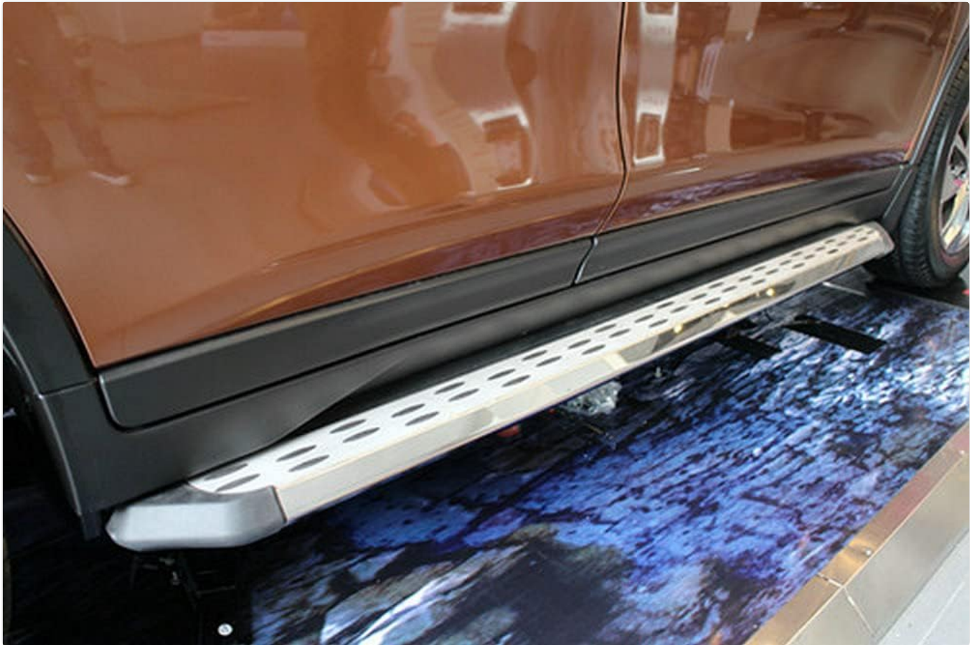
Figure 3: Close-up view of the running board's textured surface for enhanced grip.