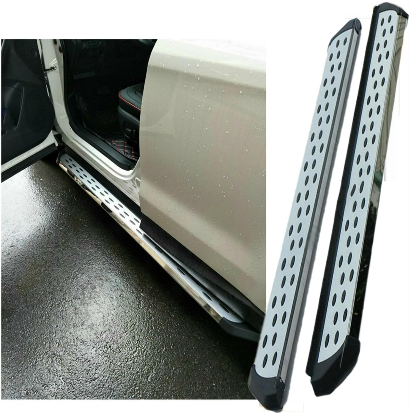
Figure 1: Fenqing-y Running Boards, a pair of aluminum side steps with white and black dotted surfaces.