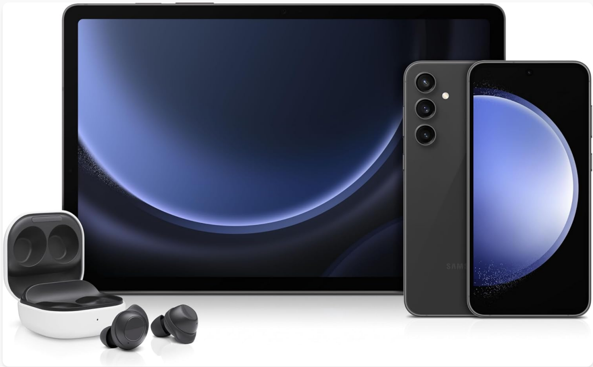
Figure 7: Auto Switch functionality.