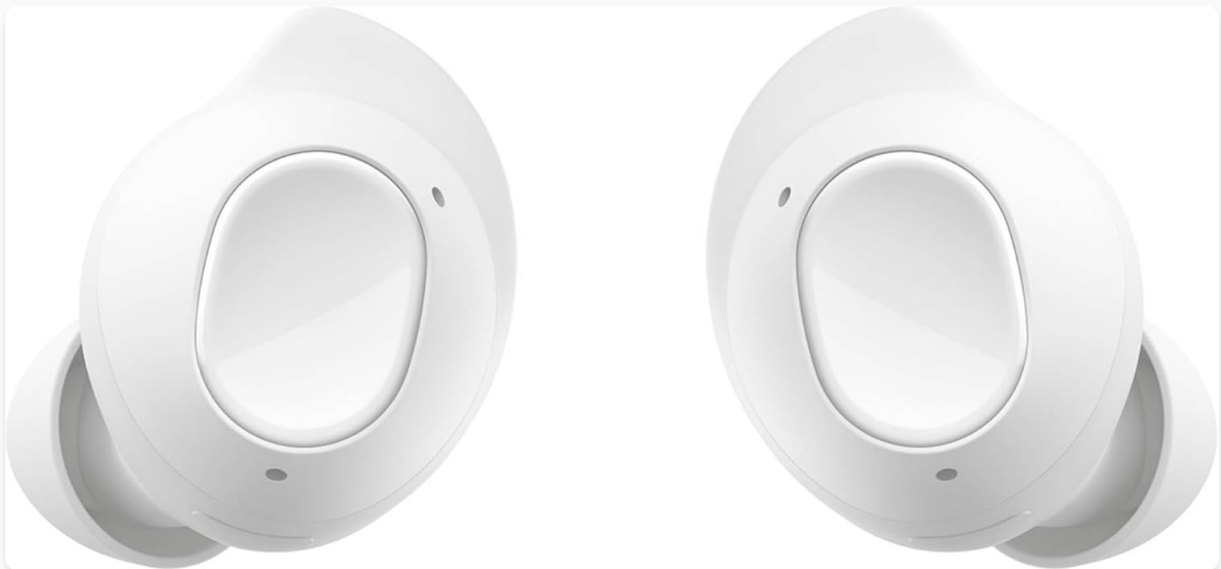
Figure 1: Samsung Galaxy Buds FE Earbuds.

The Galaxy Buds FE are engineered to provide a seamless audio experience, whether you're listening to music, taking calls, or utilizing advanced translation features. Their compact design and long-lasting battery life make them ideal for everyday use.