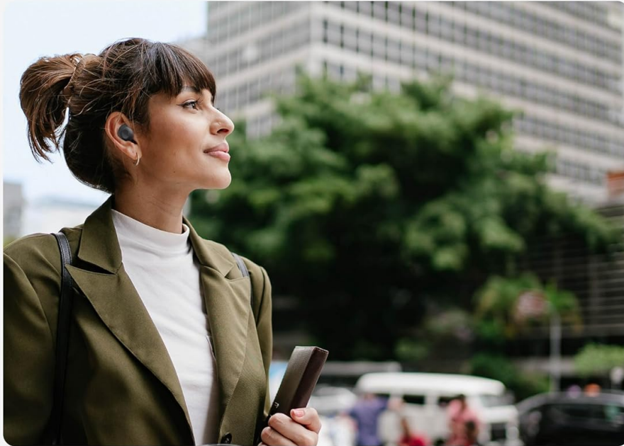
Figure 4: Proper earbud fit.

Hear what you want — not what you don't — with Active Noise Cancellation.