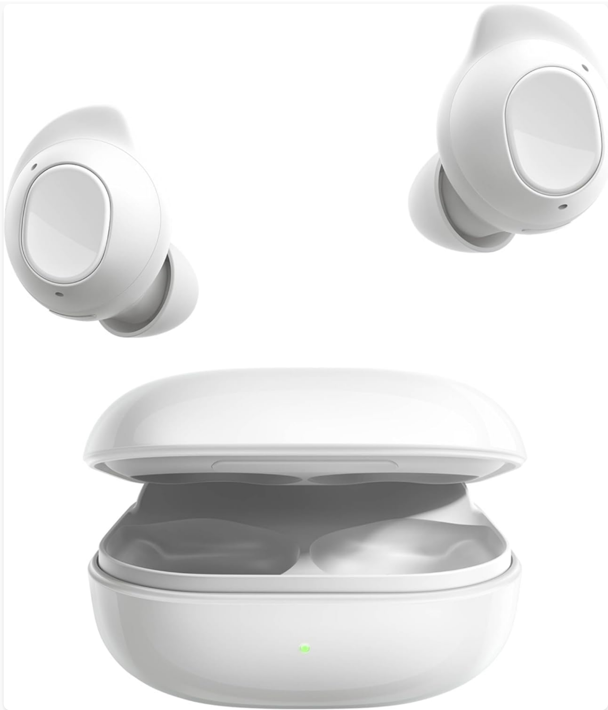
Figure 3: Earbuds in charging case.