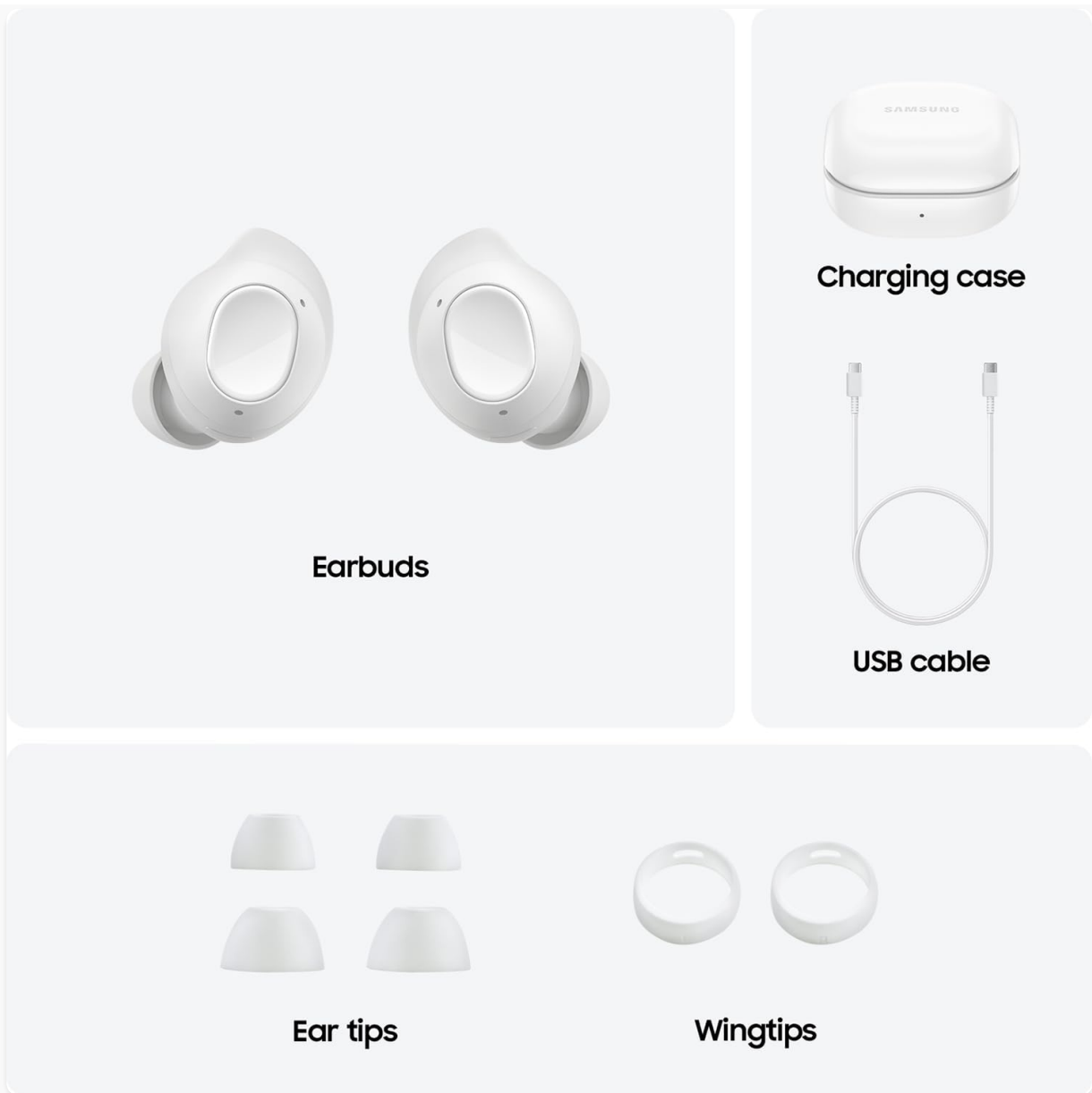
Figure 2: Included components with your Galaxy Buds FE.

Your Samsung Galaxy Buds FE package includes: