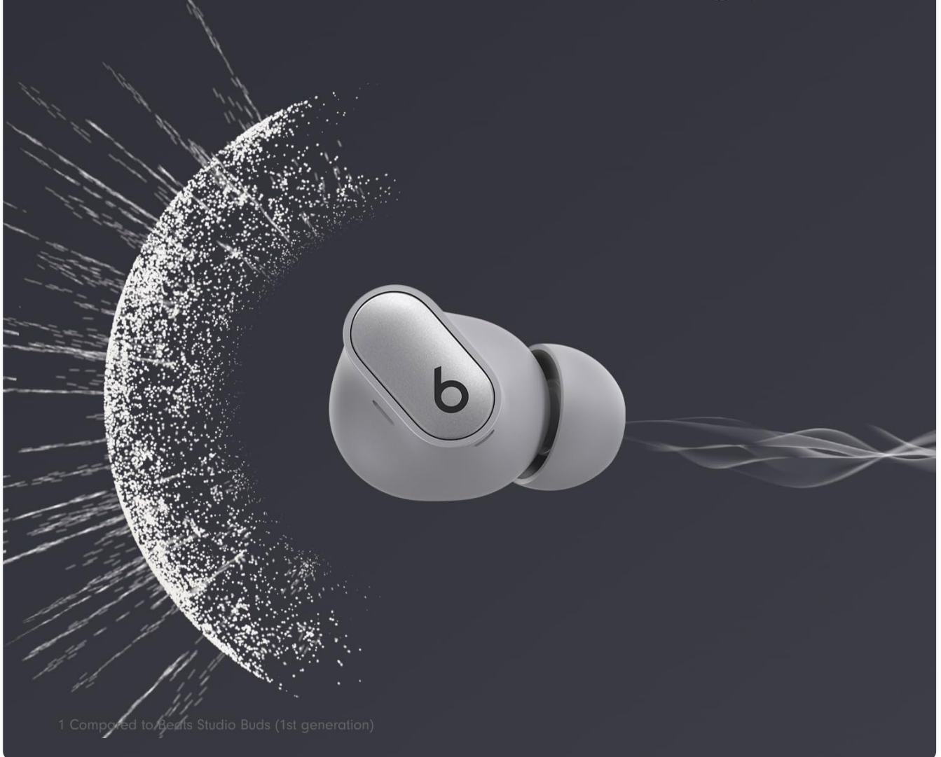
Image: A visual representation of Active Noise Cancelling, showing sound waves being suppressed around a Beats Studio Buds + earbud.

Up to 1.6x more Active Noise Cancelling power 1