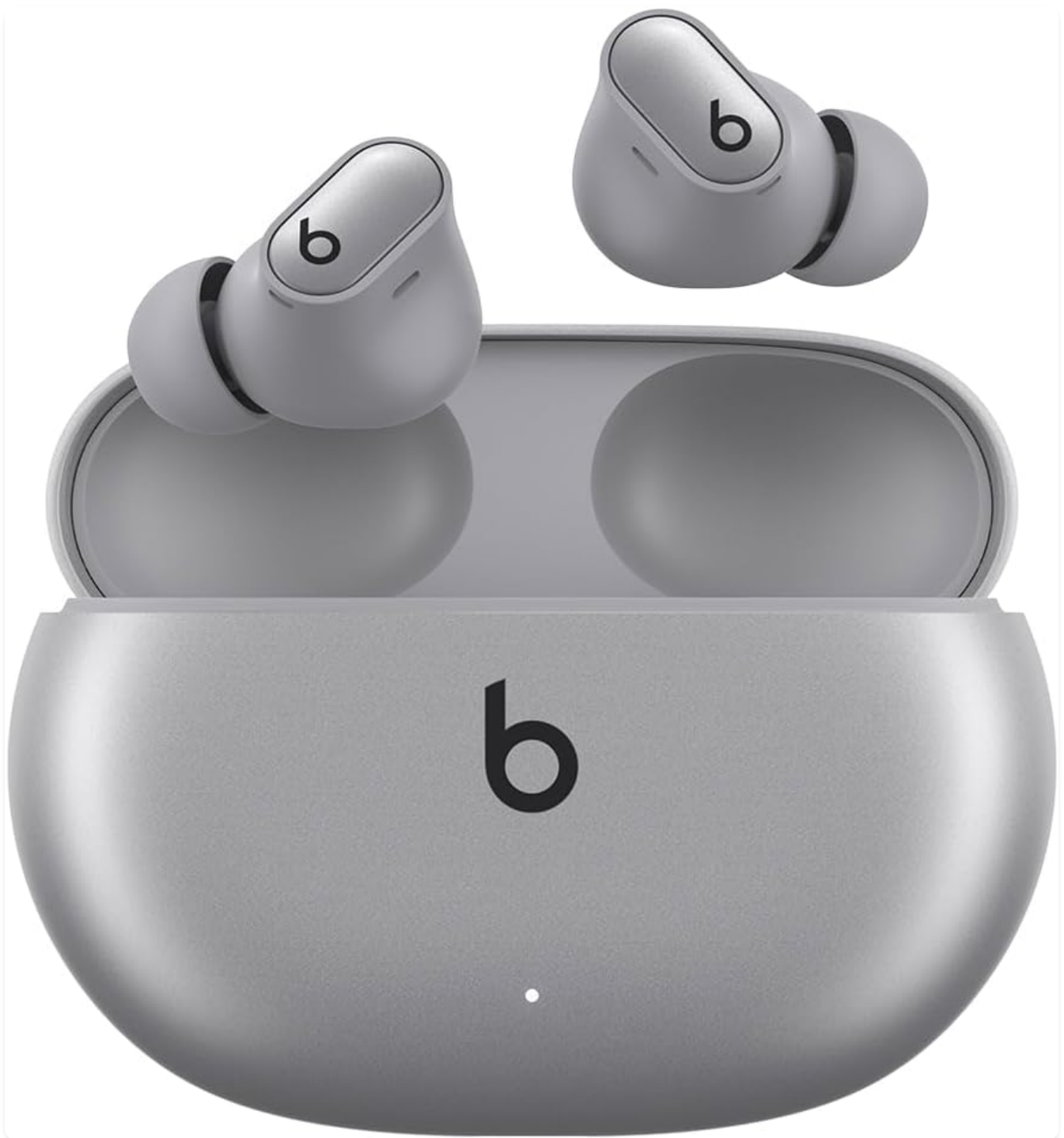
Image: Beats Studio Buds + earbuds inside their Cosmic Silver charging case, ready for charging or use.