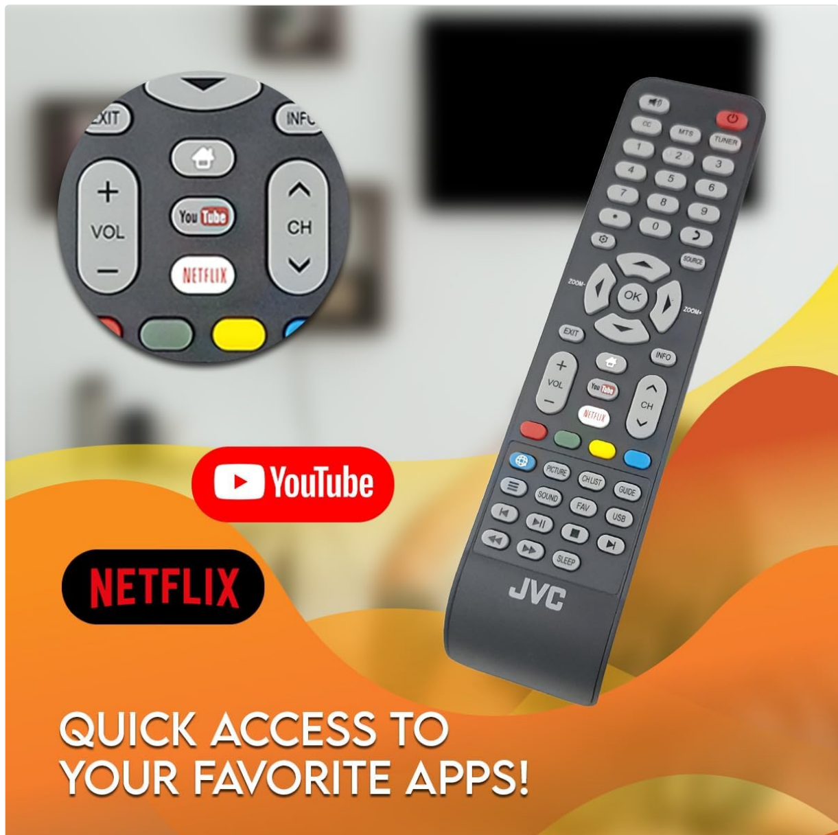
Image 4: A detailed view of the remote control, showing the dedicated Netflix and YouTube shortcut buttons for quick access.