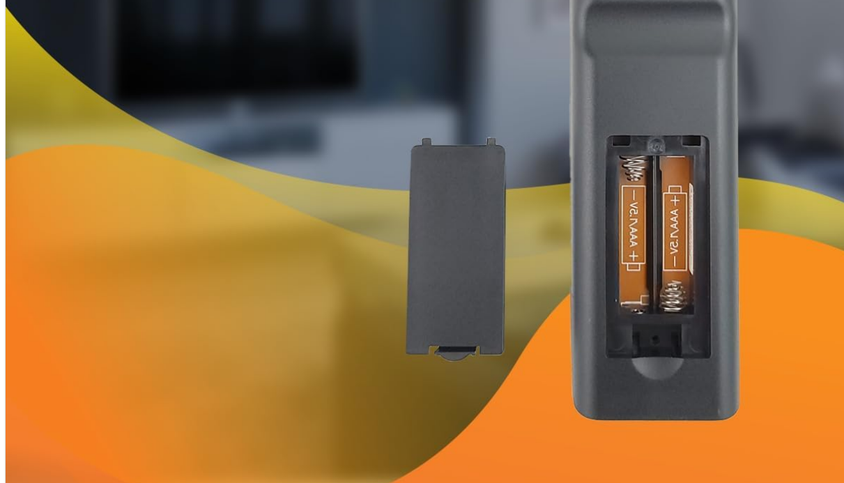
Image 3: The remote control, emphasizing that no programming is needed for operation.

2 AAA batteries required *(not included)