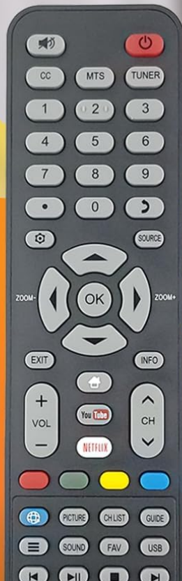
Image 5: The remote control displayed with examples of compatible JVC TV models, such as S139H and SI50US.