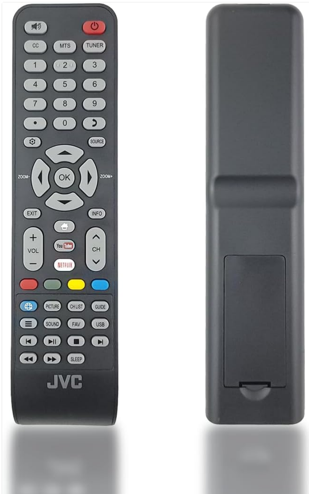
Image 1: Front and back view of the Ceybo 06-519W37-TY01X Remote Control, showcasing its ergonomic design and battery compartment.