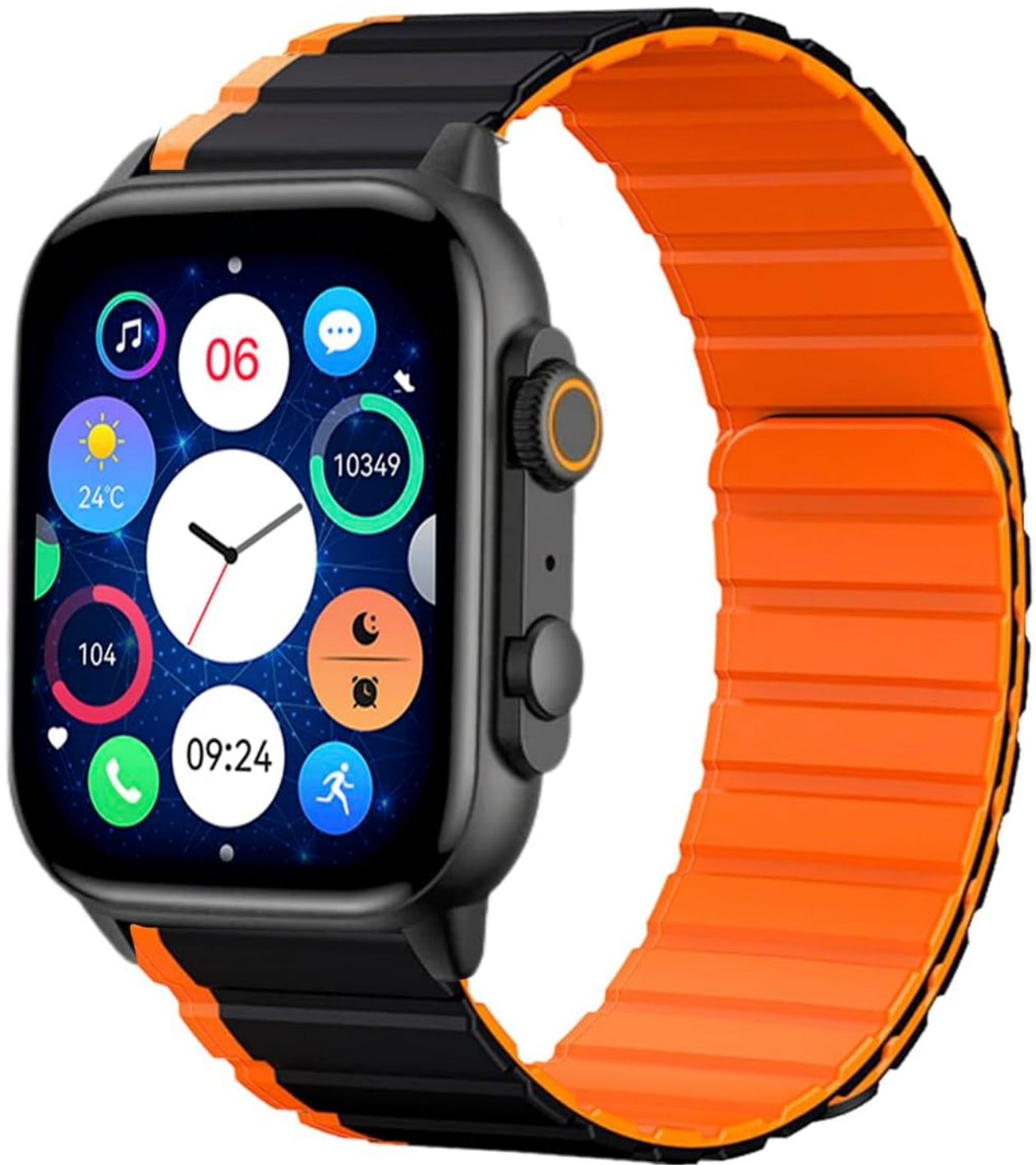
Image 1.1: Spovan AtlasX-3 Smart Watch. This image shows the watch from an angled perspective, highlighting its square display and the two-tone orange and black strap. The screen displays various icons for weather, steps, heart rate, and time.