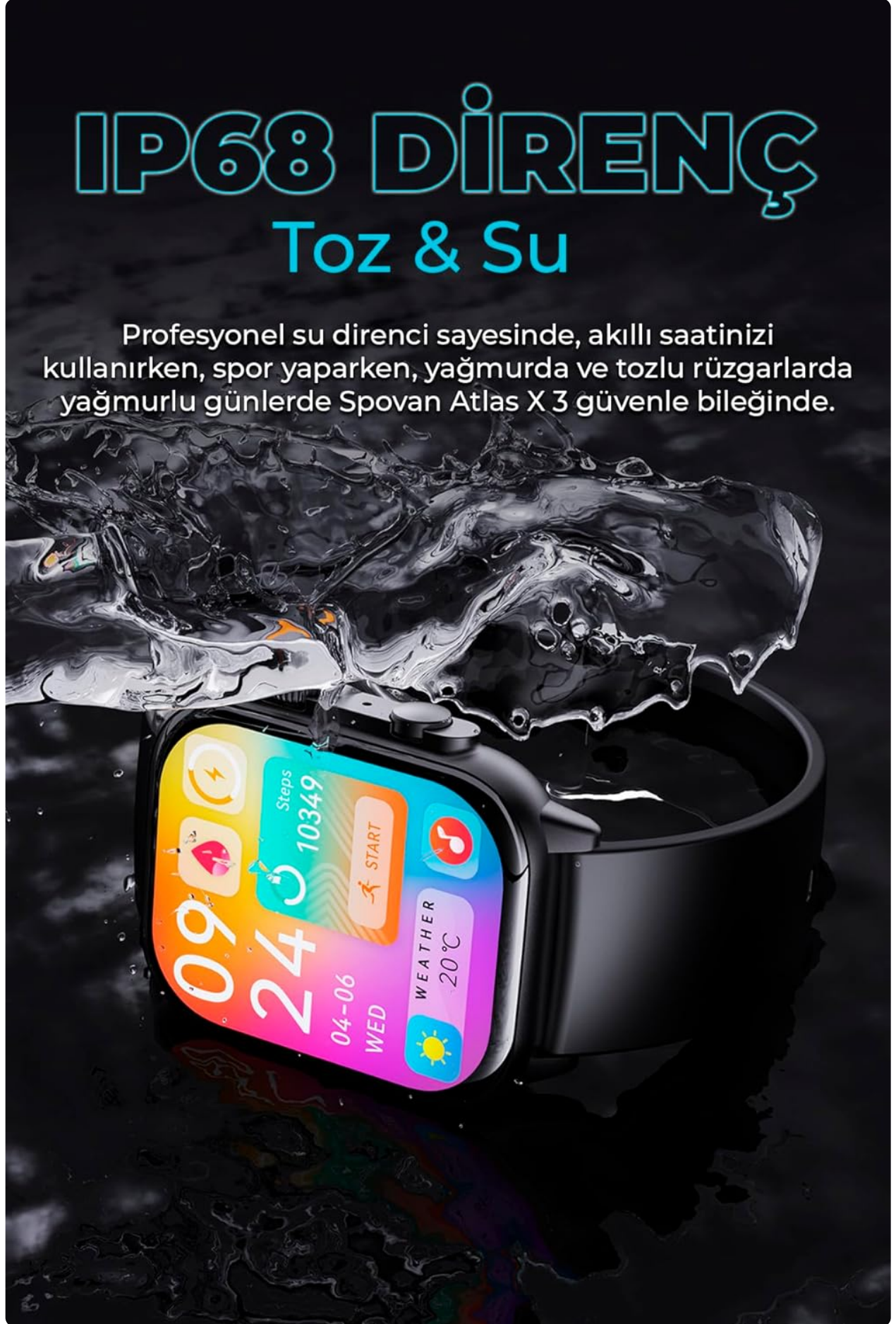
Image 4.2: IP68 Water Resistance. The image shows the watch being splashed with water, emphasizing its durability against

The device is rated IP68 for dust and water resistance, meaning it can withstand immersion in water up to 1.5 meters for 30 minutes. It is suitable for daily use, including hand washing and light rain, but not recommended for swimming or diving.