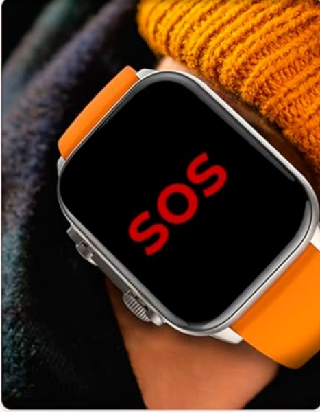
Sos Acil Arama Tuşu