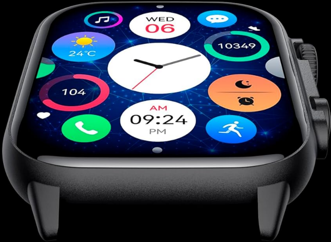
Image 4.1: AMOLED Display. This image focuses on the watch's screen, showcasing its high resolution and color accuracy, along with icons for various functions like music, weather, and activity tracking.