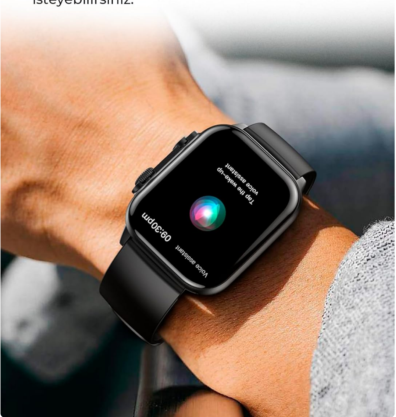
Image 3.2: Smart Voice Assistant. The image shows the watch on a wrist, with the screen displaying the voice assistant interface, prompting the user to tap to activate.

Sesli asistanınız ile arama yapabilir, alarm kurabilirsiniz. Ondan istediğiniz müziği çalmasını isteyebilirsiniz.