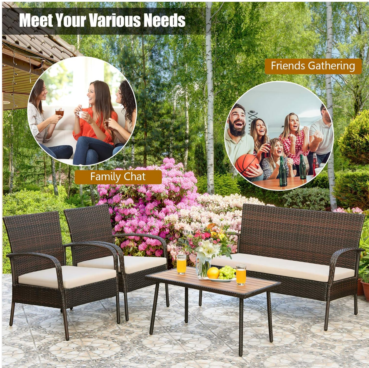
Image: The set accommodates various social needs, from family chats to friends gatherings.