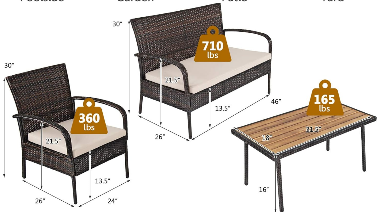
Image: The furniture set is suitable for various outdoor scenes, demonstrating its versatility.