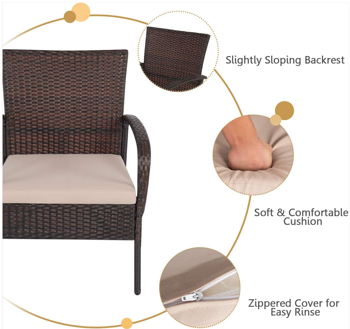
Image: Cushions feature zippered covers for easy removal and cleaning.