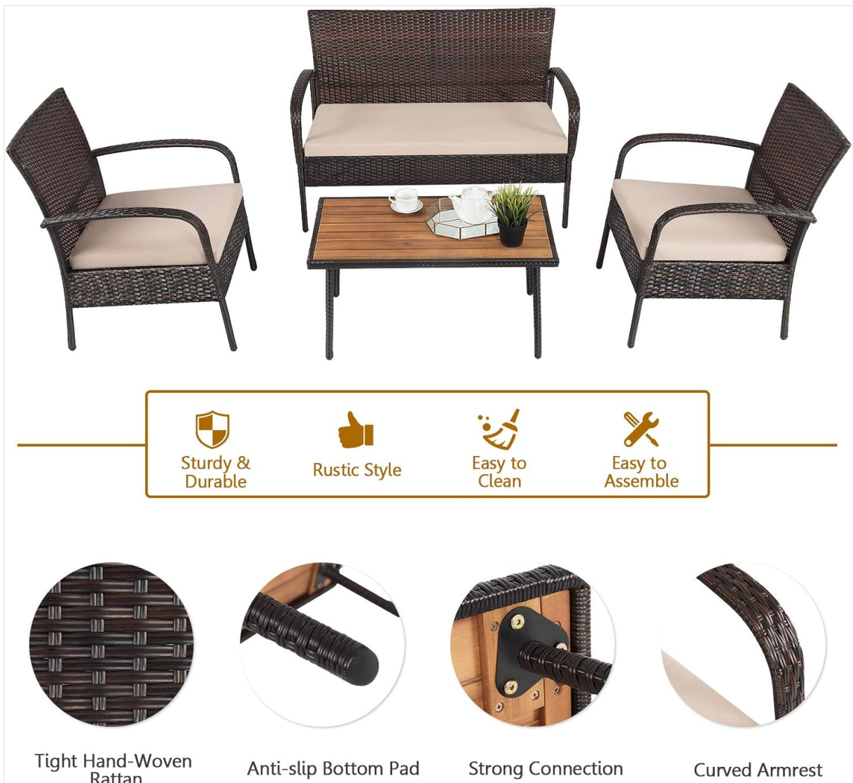
Image: Key features for assembly and durability, including strong connections and anti-slip footpads.

Tip: It is recommended to assemble the furniture with at least two people for ease and safety.