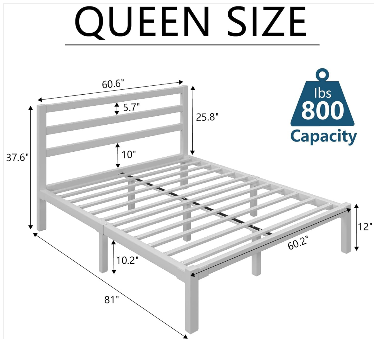
Figure 1: Queen Size Bed Frame Dimensions and 800 lbs Capacity.