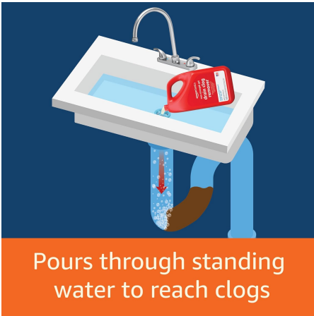
Dissolves Blockages: Effectively breaks down hair, grease, and gunk that cause drain blockages.