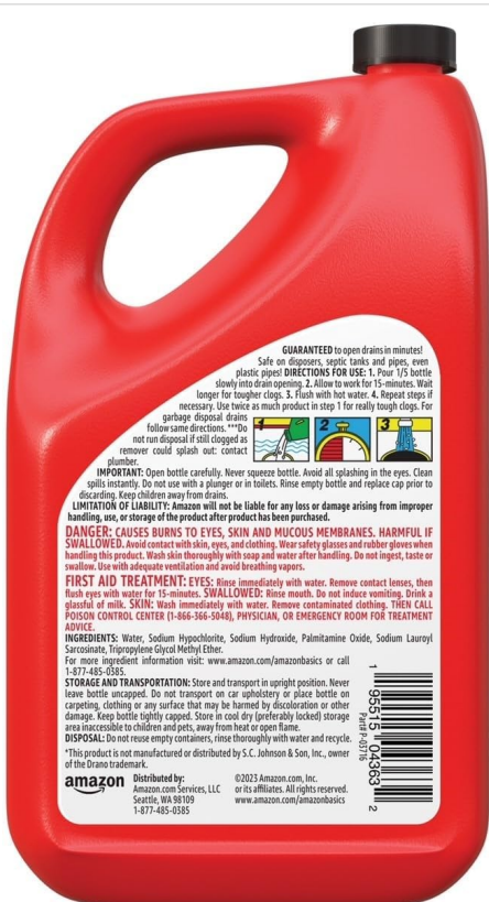
Product Label: Detailed instructions and safety warnings on the back of the Amazon Basics Max Strength Drain Cleaner bottle.