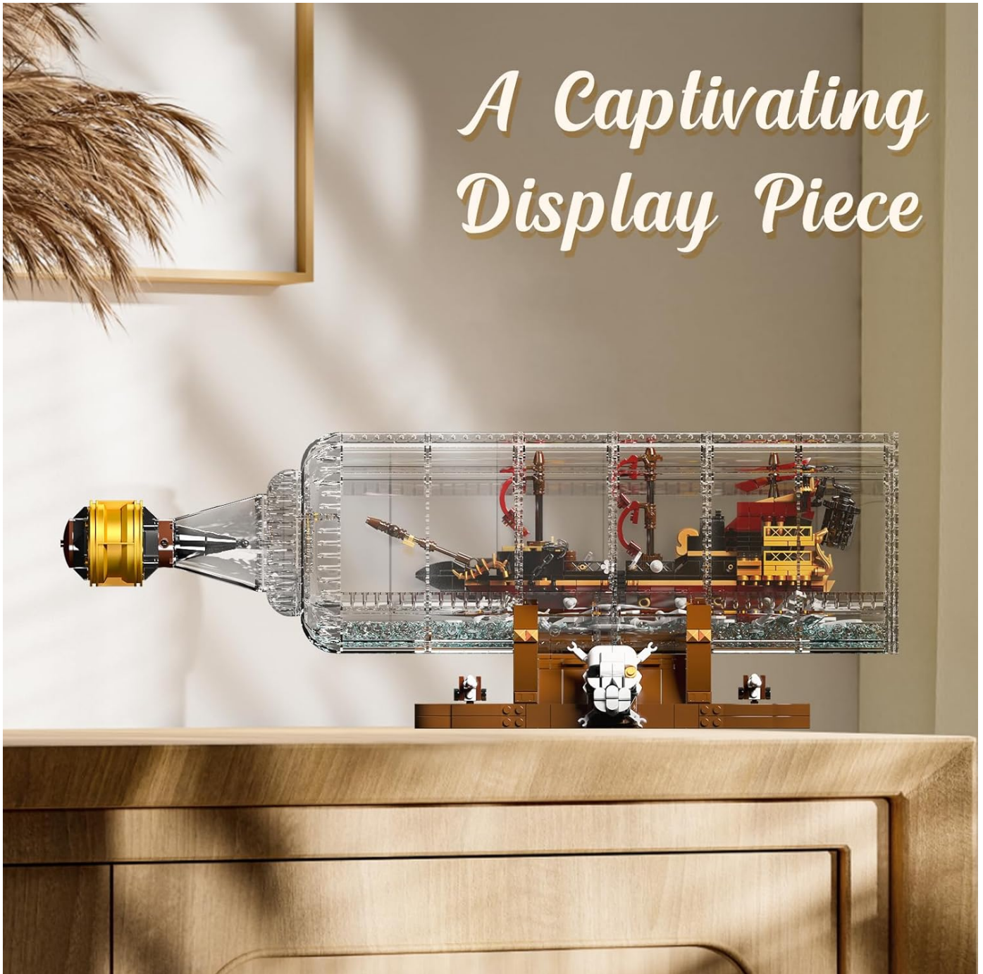
Image: The assembled Mould King 10066 model is shown on a wooden shelf, demonstrating its aesthetic as a display piece in a home or office setting.