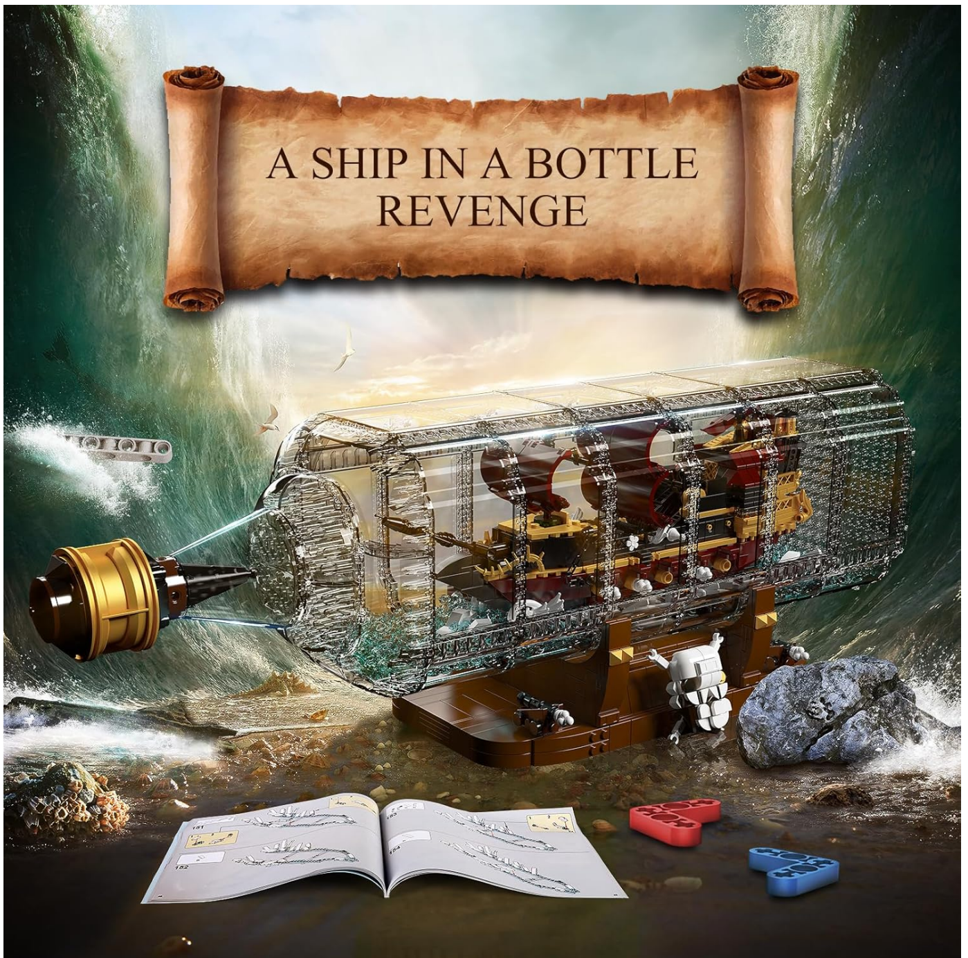
Image: The fully assembled Mould King 10066 Queen Anne's Revenge Ship in a Bottle model, showcasing the ship inside the transparent bottle and its display stand.