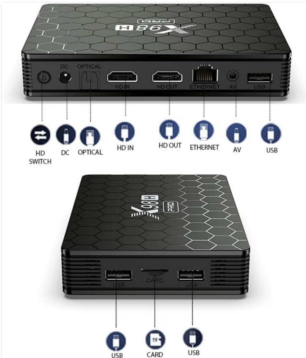
Image: Detailed views of the X98H PRO TV Box showing its various ports. The rear panel includes DC power input, Optical audio output, HDMI In, HDMI Out, Ethernet, AV, and USB. The side panel shows two additional USB ports and a TF/MicroSD card slot.