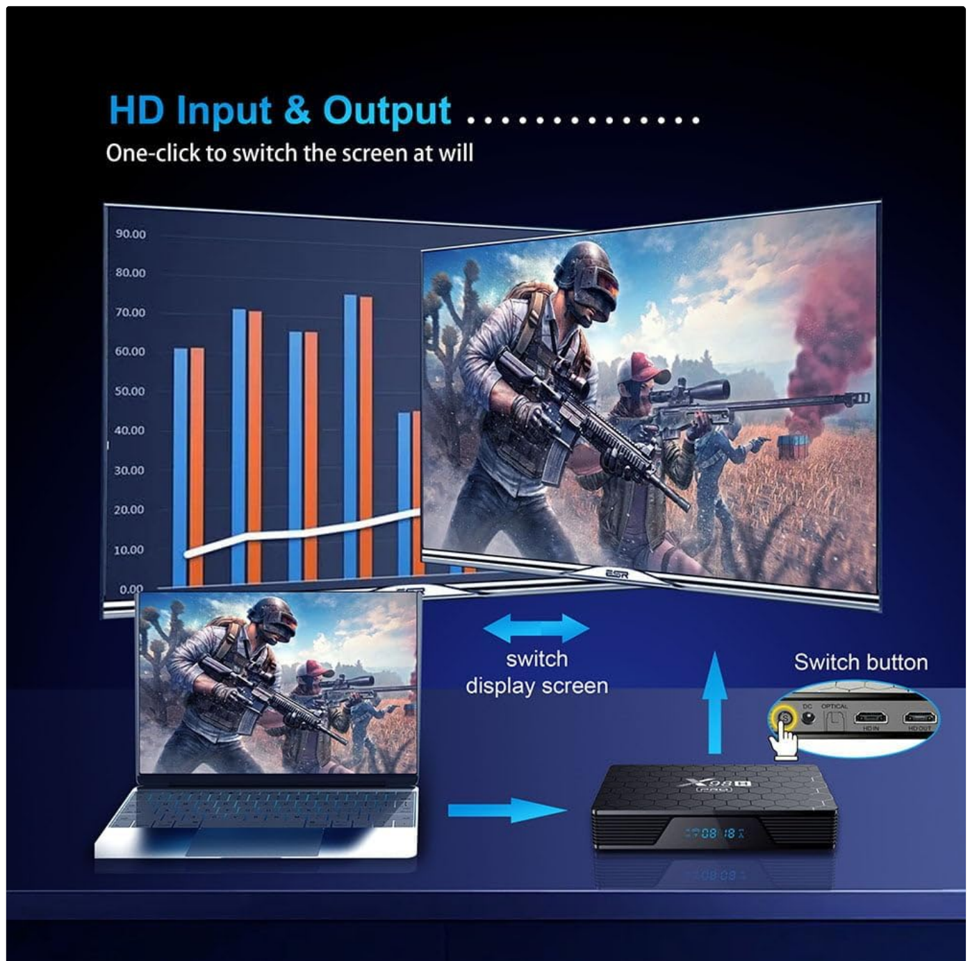
Image: A diagram illustrating the HDMI input and output functionality. The X98H PRO can display its own content or switch to an external HDMI source connected to its HDMI In port, controlled by a switch button on the device.

The X98H PRO features an HDMI input port, allowing you to connect another HDMI source (e.g., a game console or Blu-ray player) and switch between the TV box's output and the external HDMI input.