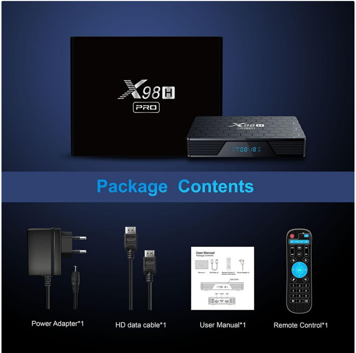
Image: A visual representation of the X98H PRO TV Box package contents, including the TV box, remote control, HDMI cable, power adapter, and user manual.