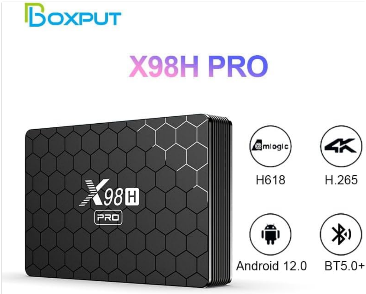
Image: The X98H PRO TV Box alongside icons highlighting its key features: Allwinner H618 chipset, H.265 decoding, Android 12.0 OS, and Bluetooth 5.0+ connectivity.

The X98H PRO is a high-performance smart TV box designed for home entertainment. It features the Android 12.0 operating system and is powered by the Allwinner H618 Quad-Core Cortex-A53 CPU and Mali G31 MP2 GPU, ensuring smooth operation and excellent multimedia capabilities.