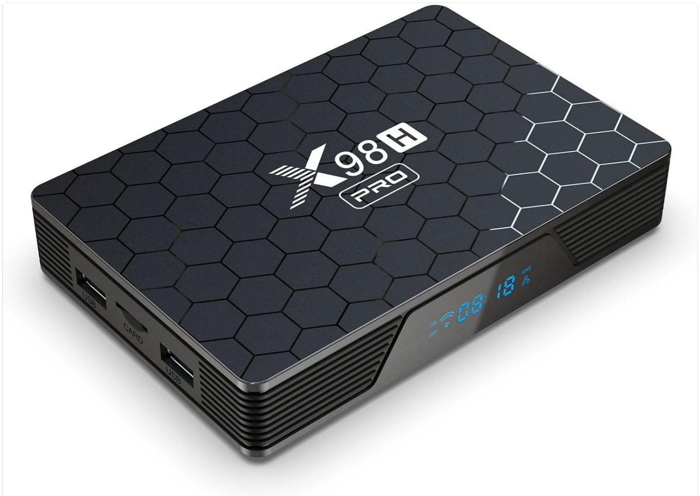
Image: The X98H PRO Android 12 Smart TV Box, a black rectangular device with a hexagonal pattern on top and a digital display on the

This manual provides comprehensive instructions for setting up, operating, and maintaining your BOXPUT X98H PRO Android 12 Smart TV Box. Please read this manual thoroughly before using the device to ensure proper functionality and to maximize your user experience.