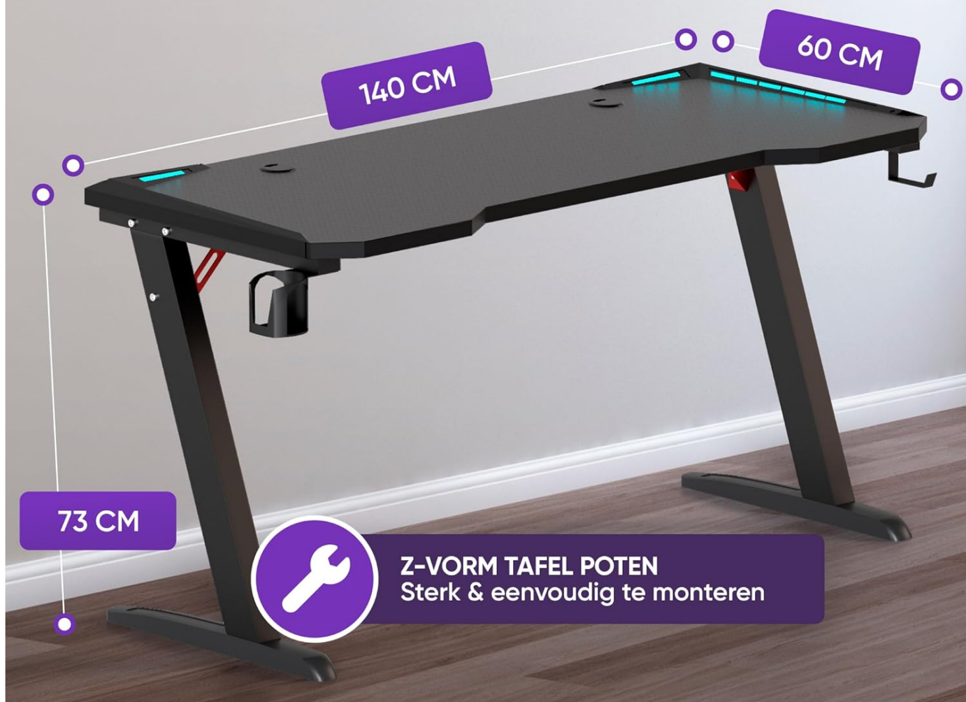
Image 6.1: Carbon fiber coating features: temperature, scratch, and water resistance.