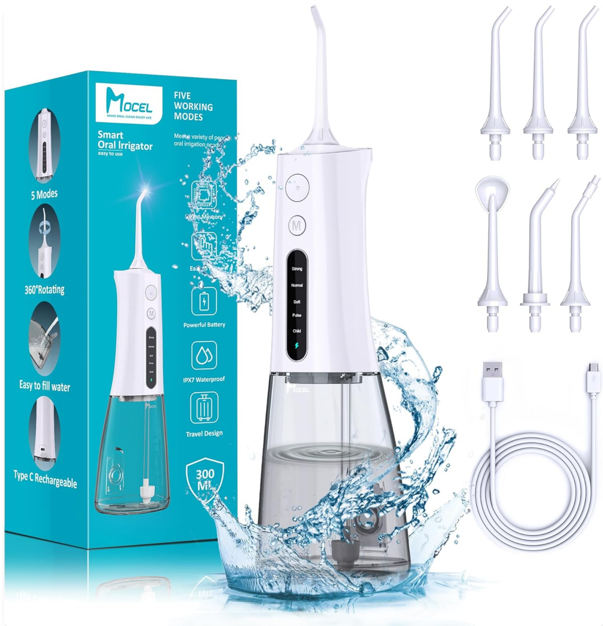
Image: MOCEL Water Dental Flosser, showing the main unit, various nozzle tips, and USB-C charging cable.