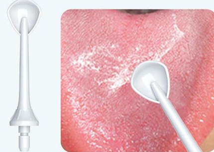
Image: Visual representation of the different nozzle tips included with the flosser, detailing their quantity and specific uses.

Suitable for daily cleaning of tongue bacteria