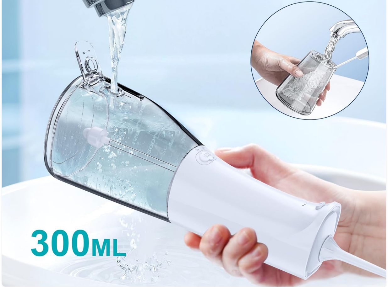
Image: Illustration of the 300ML water tank being filled and its wide opening for easy cleaning.