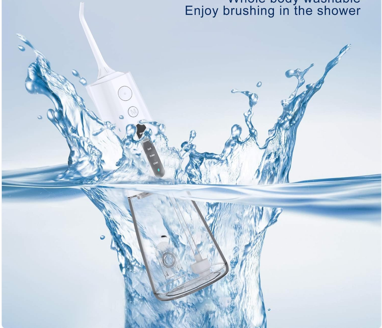
Image: Depiction of the MOCEL Water Dental Flosser submerged in water, highlighting its IPX7 waterproof rating.

Whole body washable Enjoy brushing in the shower