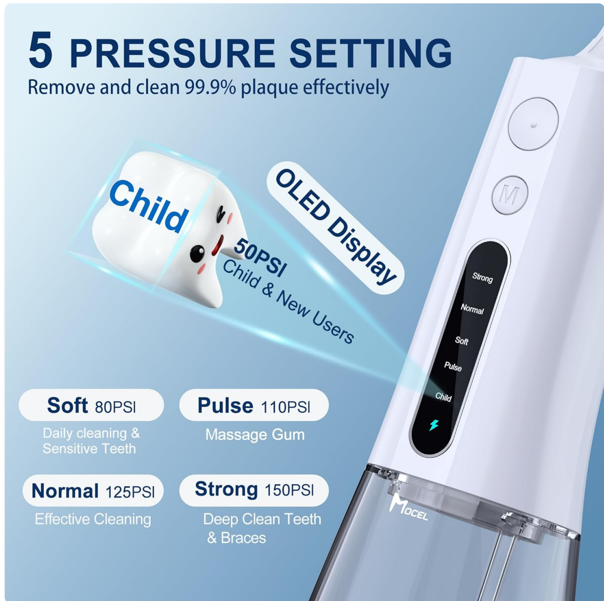
Image: Diagram illustrating the five pressure settings and their corresponding PSI levels and recommended uses.

Remove and clean 99.9% plaque effectively