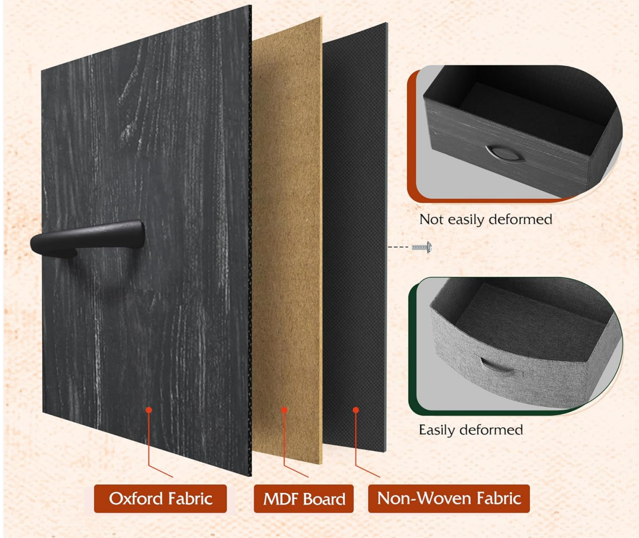
Image: A diagram illustrating the layered construction of the drawers, showing Oxford fabric, MDF board, and non-woven fabric, emphasizing durability and resistance to deformation.