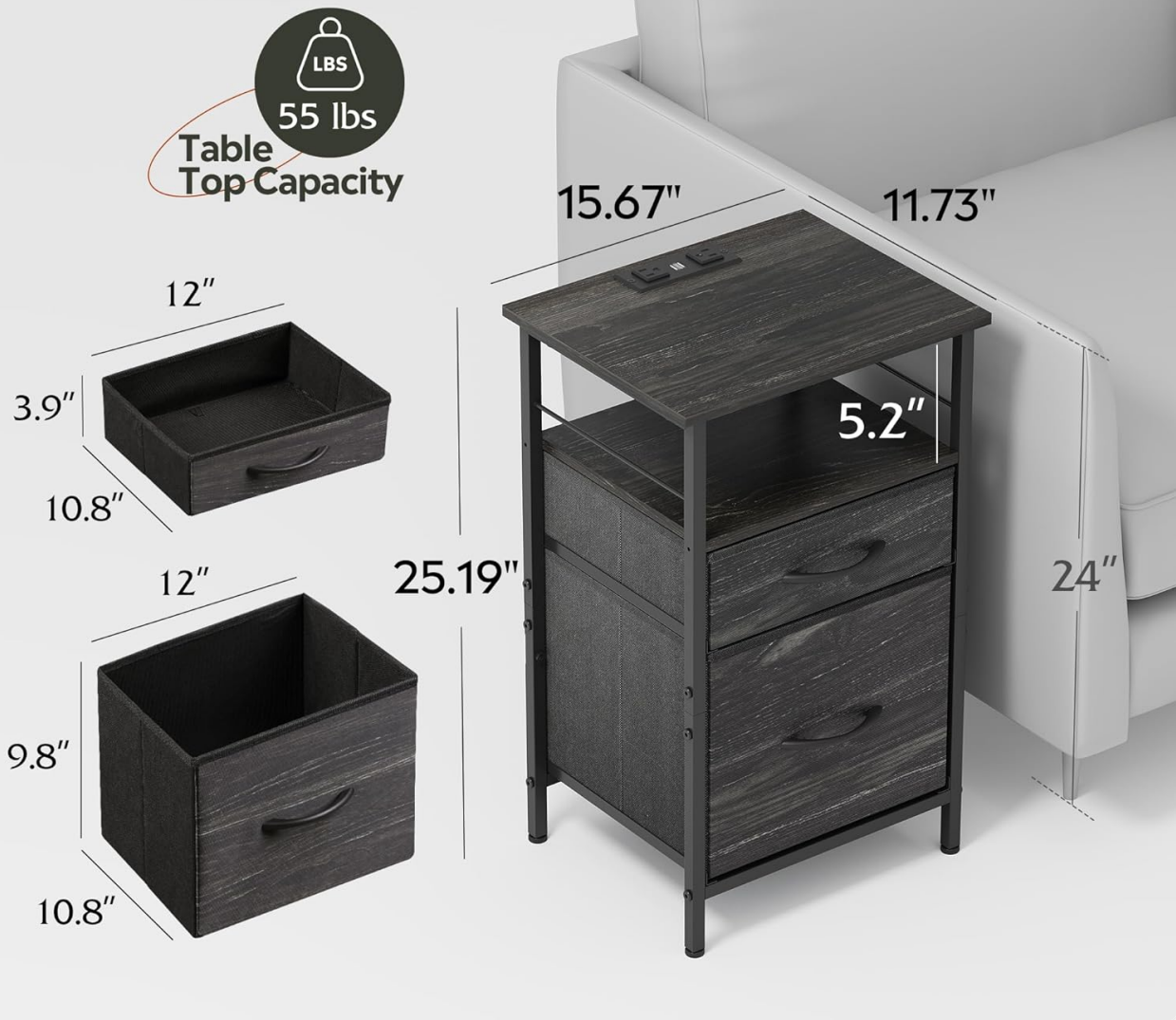
Image: A diagram illustrating the precise dimensions of the nightstand, including the overall height, width, depth, and the internal dimensions of the drawers.