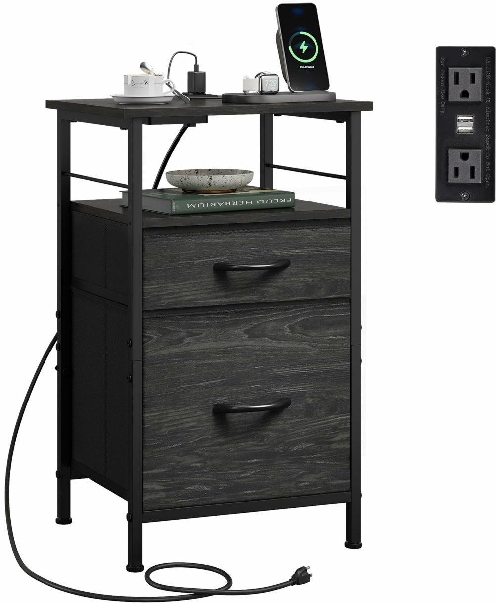
Image: The WLIVE Nightstand with Charging Station, featuring a charcoal black finish and integrated power outlets.