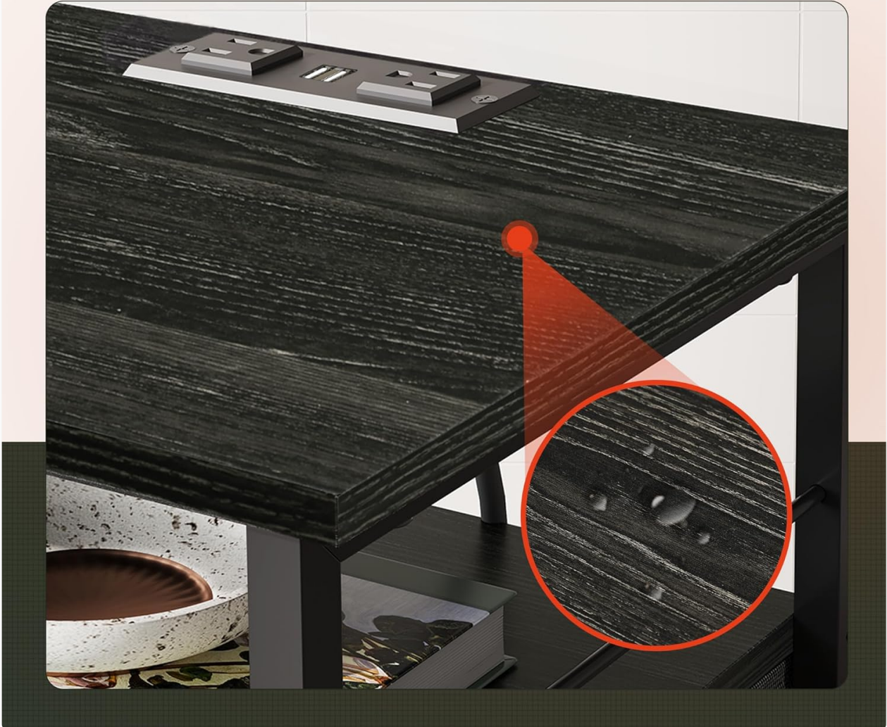
Image: A close-up view illustrating the water-resistant properties of the nightstand's surface, showing water droplets beading on the material.