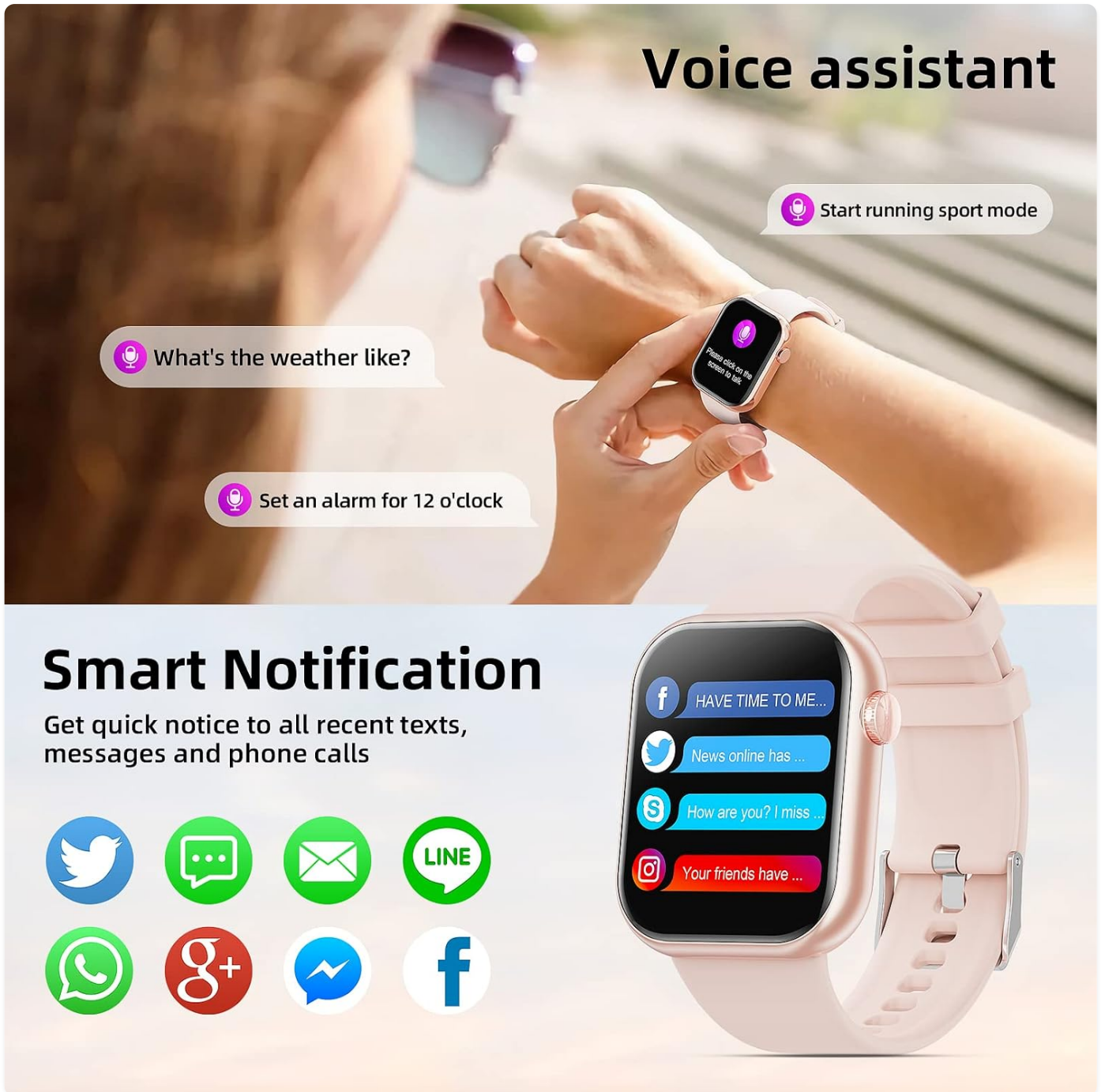
Figure 5.3: Voice Assistant and Smart Notification. This image shows the watch's voice assistant capabilities (e.g., "What's the weather like?", "Set an alarm") and its ability to receive notifications from various apps like Twitter, WeChat, Messages, LINE, WhatsApp, Google+, Messenger, and Facebook.