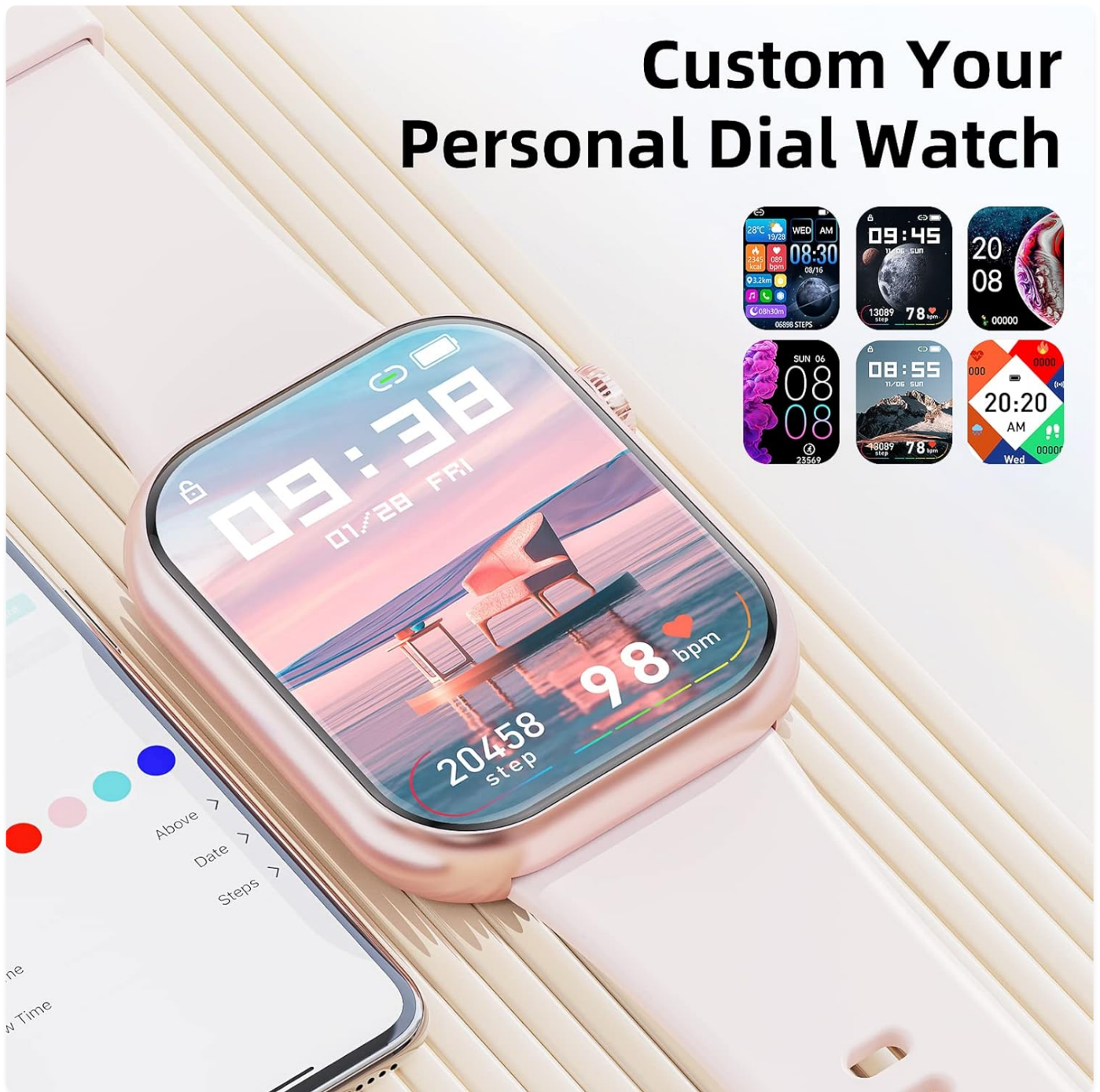
Figure 5.6: Custom Your Personal Dial Watch. This image displays the watch's ability to customize its dial, showing several pre-designed watch faces and an option to create a user-defined watch face from a photo.

Personalize your smartwatch with over 100 watch faces or create your own custom dial.