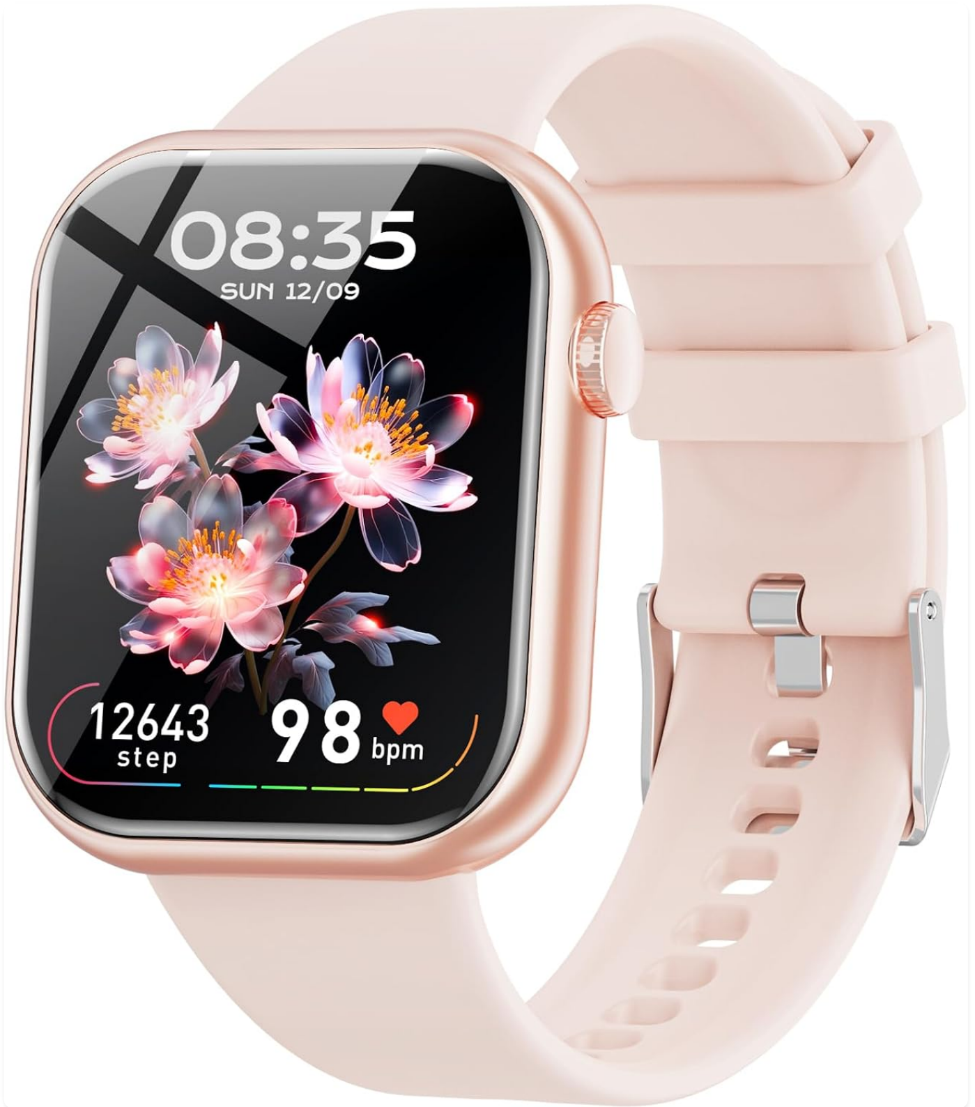
Figure 1.1: Hwagol Smartwatch main display. The watch face shows the time (08:35), date (SUN 12/09), step count (12643), and heart rate (98 bpm). The background features a vibrant floral design.