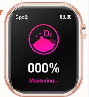
Figure 5.5: Your Healthy Partner. This image highlights the watch's health monitoring capabilities, including automatic sleep time recording (from 8 PM to 10 AM), real-time dynamic heart rate monitoring with a graph, and blood oxygen (SpO2) monitoring with historical data.