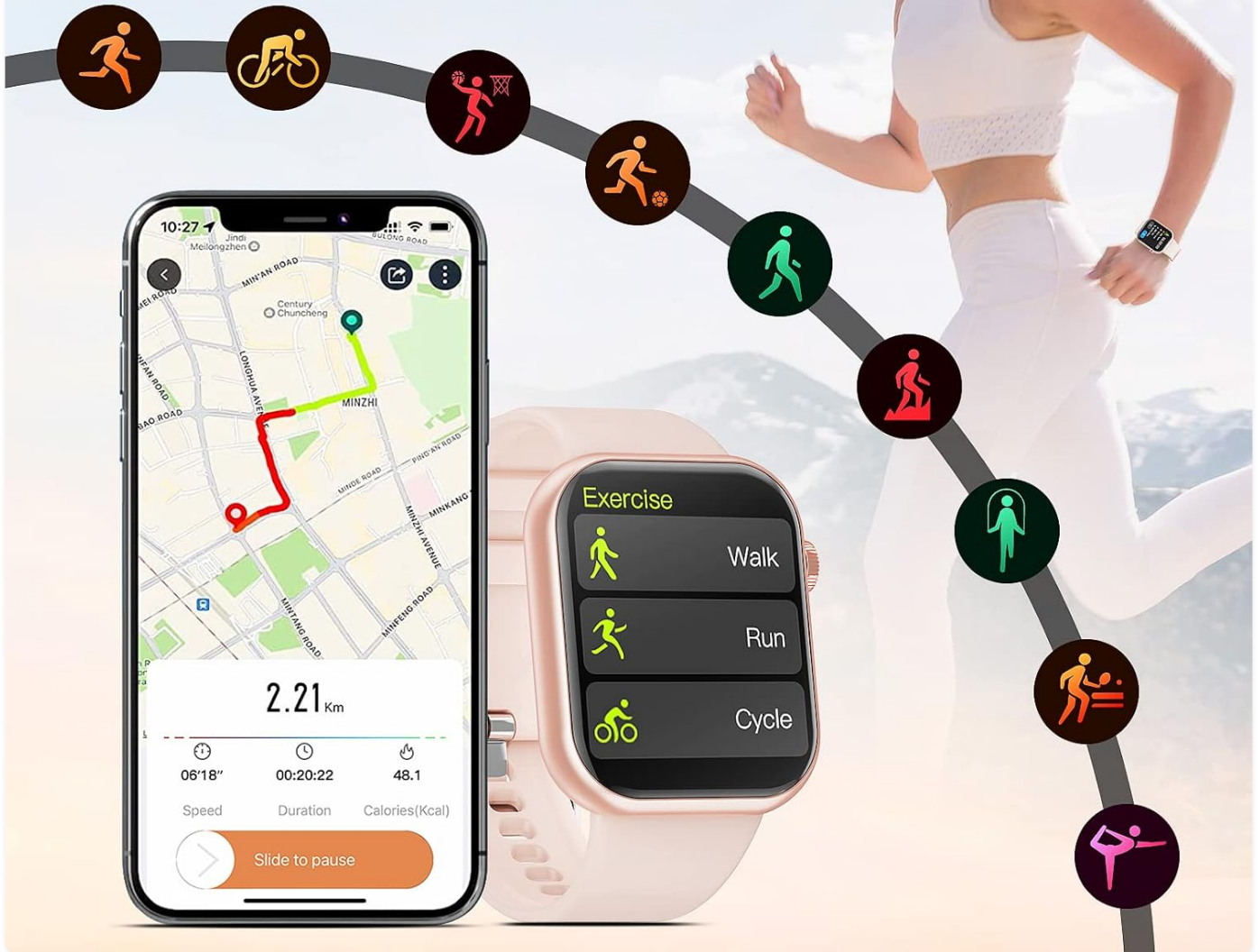
Figure 5.4: Multi-Sport Modes. This image illustrates the watch's capability to track various sports, including running, cycling, rope skipping, football, and more. It shows the watch displaying exercise data such as distance, duration, speed, and calories burned, along with a map of the activity route.

Covering Both Internal & External Places of Exercise Record Your Exercise Data Enjoy a Healthy Life