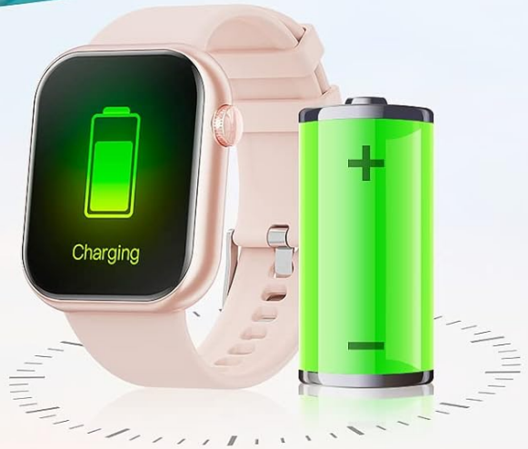
Figure 4.1: Charging the Hwagol Smartwatch. The image illustrates the magnetic USB charging method and highlights the battery life: 10 days standby time, 5 days battery life, and 2 hours charging time. A full charge typically takes about 2 hours. The watch will display a charging indicator.