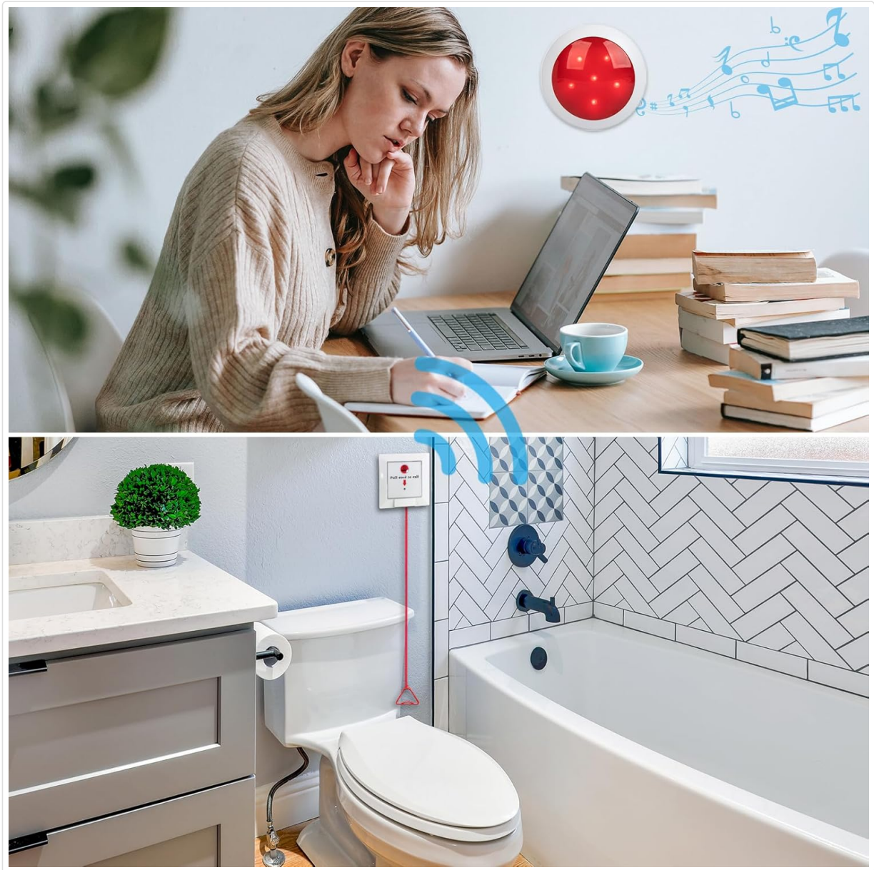
Image: Overview of the CYSSJF Bathroom Pull Cord Alarm Kit components, including the receiver, call button with pull cord, and other accessories.