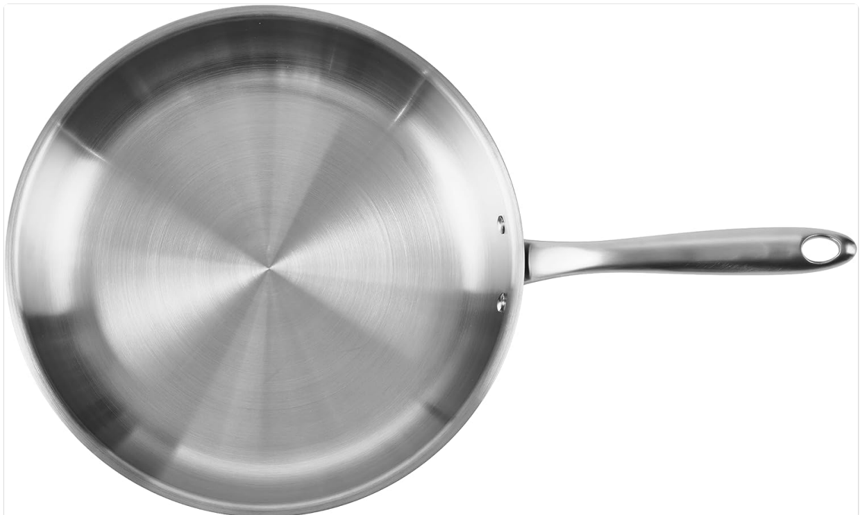
Image: Top-down view of the CHEF TOPF 12-inch 5-Ply Stainless Steel Frying Pan, showcasing its brushed stainless steel finish.

Thank you for choosing the CHEF TOPF 12-inch 5-Ply Stainless Steel Frying Pan. This premium cookware is engineered for superior performance and durability, designed to enhance your culinary experience. Please read this manual carefully to ensure proper use, care, and maintenance of your new frying pan.