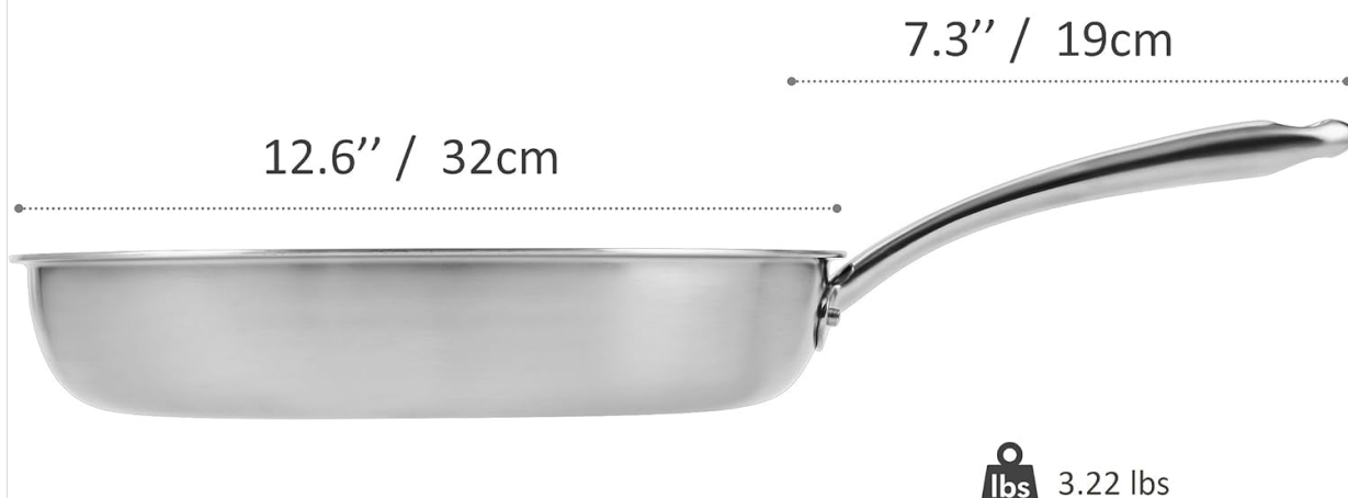
Image: Side profile of the 12-inch frying pan, highlighting its dimensions and weight.