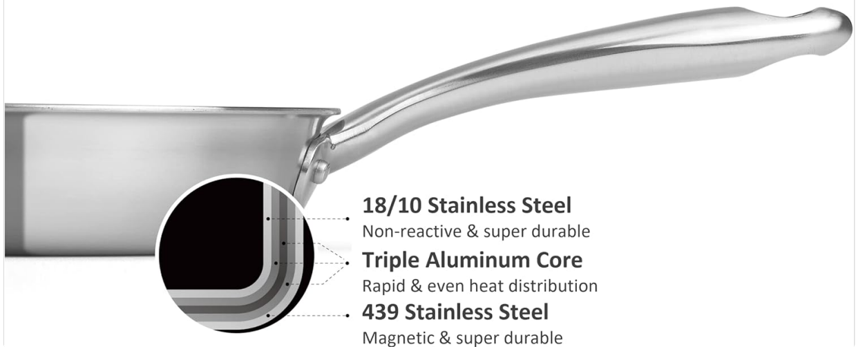
Image: Detailed diagram illustrating the 5-ply construction with layers of stainless steel and aluminum core.