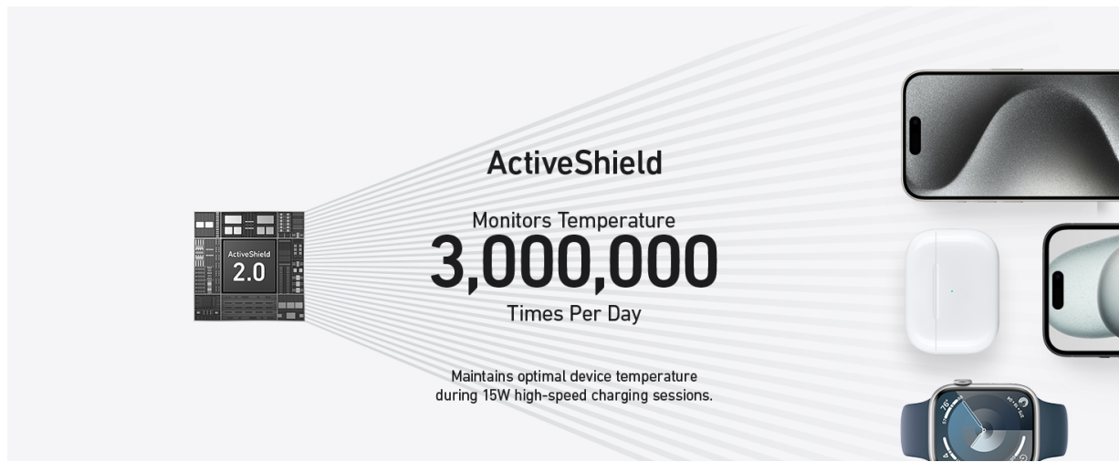
Image: Proper alignment of the Apple Watch on the charging module is crucial for efficient charging.