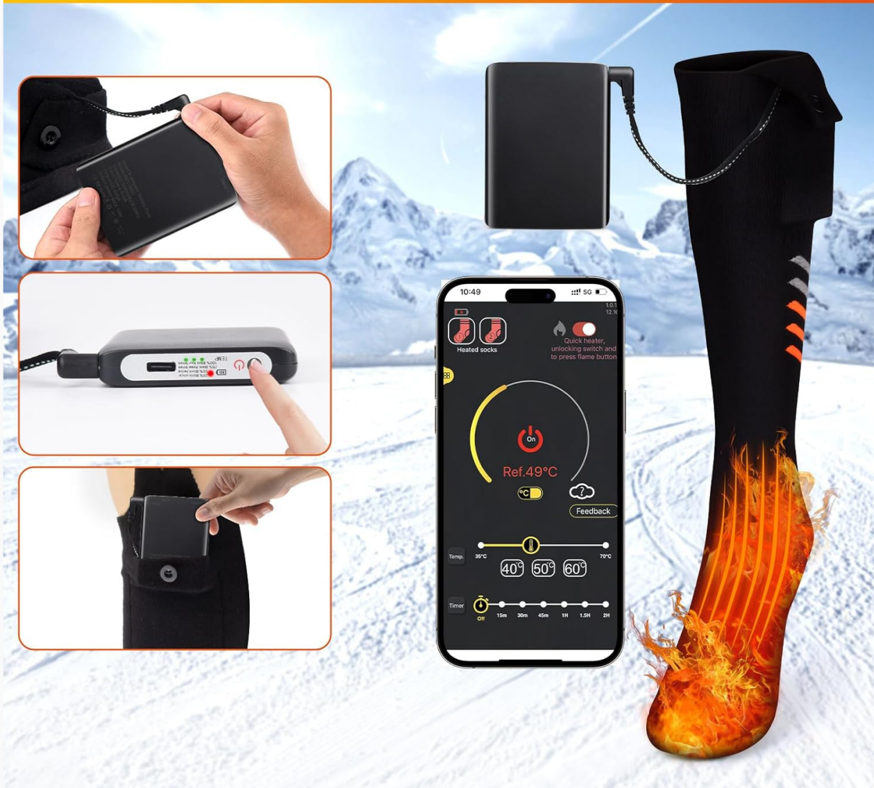
Image: A smartphone screen showing the Fwiull heated socks control application, alongside an illustration of the battery connecting to the sock. This highlights the smart app control functionality.