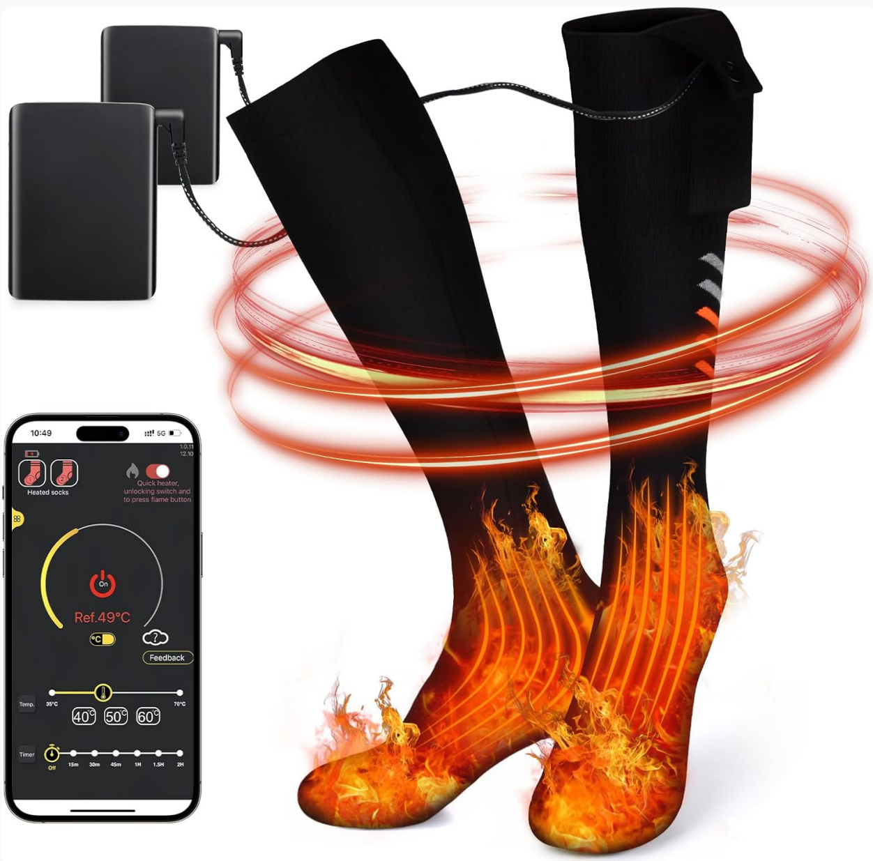
Image: Fwiull Heated Socks with connected batteries and a smartphone displaying the control app. This illustrates the product's main components and smart control feature.