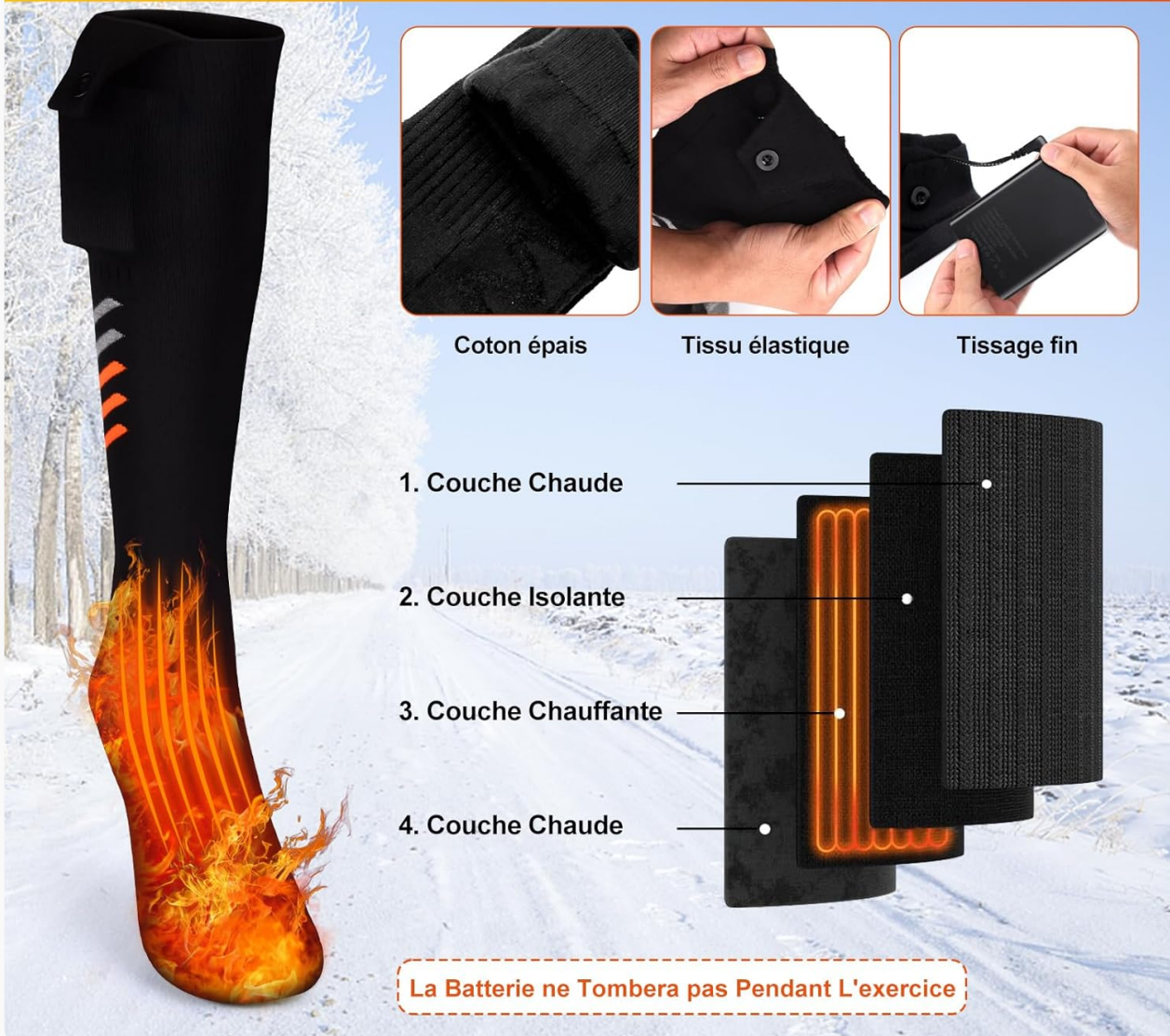
Image: An exploded view diagram illustrating the layered construction of the heated socks, including the warm layer, insulating layer, and heating layer, highlighting the quality craftsmanship.