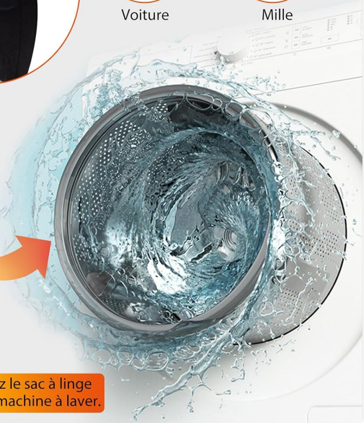
Image: A step-by-step visual guide on how to clean the electric socks, emphasizing battery removal and the option for machine or hand washing.

3. Mettez le sac à linge dans la machine à laver.