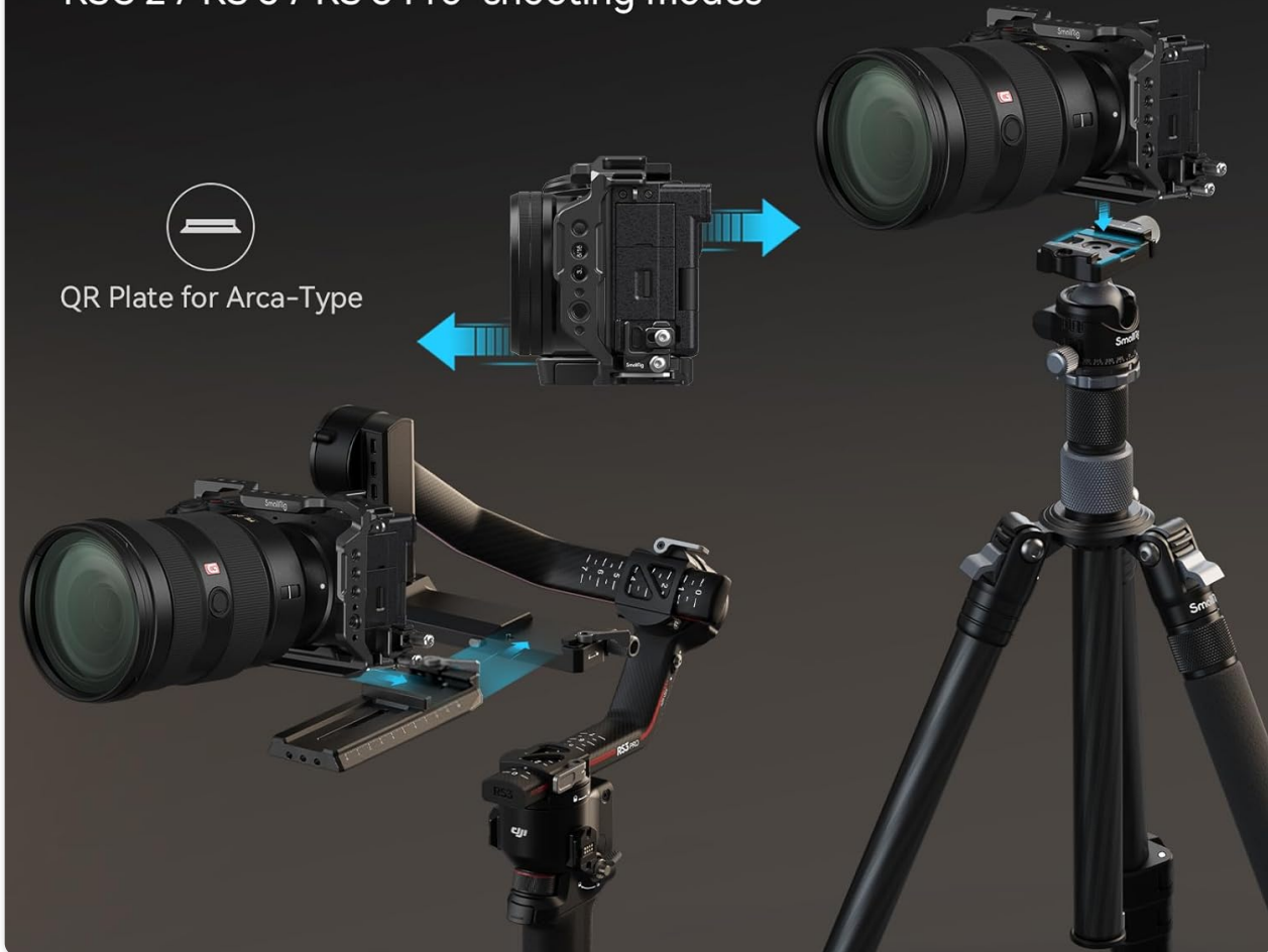
Figure 4.3: Seamless switching between various shooting modes.

Integrated Swiss quick release plate for Arca facilitates fast switching between handheld, tripods or gimbals for DJI RS 2 / RSC 2 / RS 3 / RS 3 Pro shooting modes