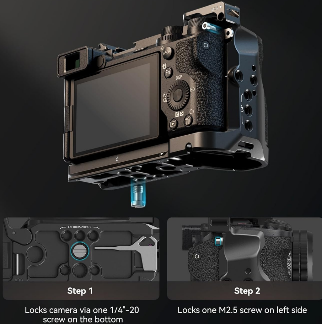
Figure 3.1: Two-Point Locking mechanism for secure camera attachment.