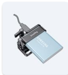
Figure 4.4: The cage supports diverse shooting configurations.

The versatile design of the SmallRig Cage Kit supports various shooting scenarios, including handheld, tripod, and stabilizer setups, providing flexibility for professional and amateur content creators.