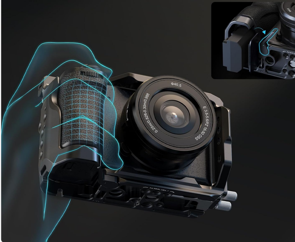
Figure 4.1: Enhanced handgrip and battery access with the cage.

The patented hinge arm design delivers a comfortable grip feeling and does not block the battery access