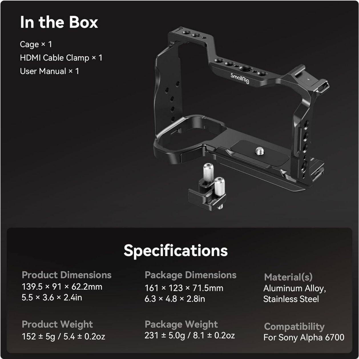
Figure 2.1: Included components in the SmallRig Cage Kit.