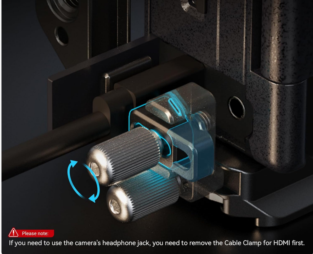
Figure 3.2: HDMI Cable Clamp installation for port protection.

The cable clamp protects ports for stable transmission, and allows quick assembly & disassembly via a thumb screw.