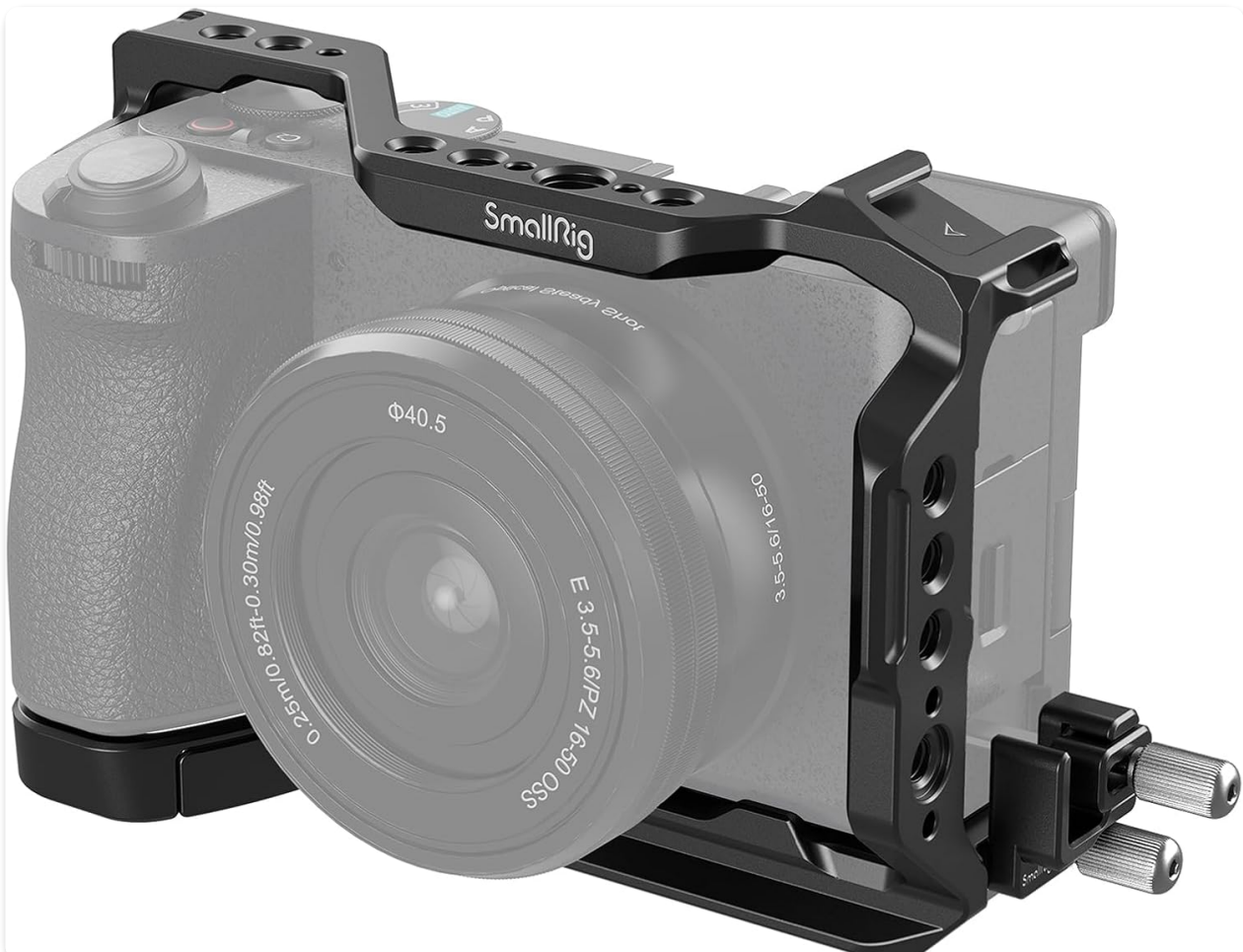
Figure 1.1: SmallRig Cage Kit 4336 mounted on a Sony A6700 camera.

The SmallRig Cage Kit 4336 is specifically designed for the Sony A6700 camera. This all-in-one cage provides robust protection for your camera while offering numerous mounting points for accessories, enhancing your video recording and photography experience. It features an ergonomic design for improved grip and maintains full access to all camera ports, controls, and the battery door.