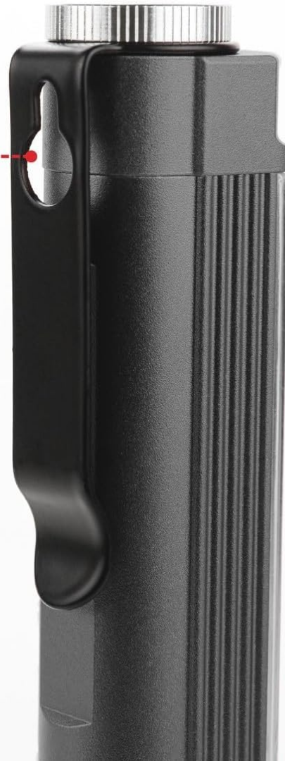
Figure 4: Close-up of the strong magnetic base, enabling hands-free use on metal surfaces.