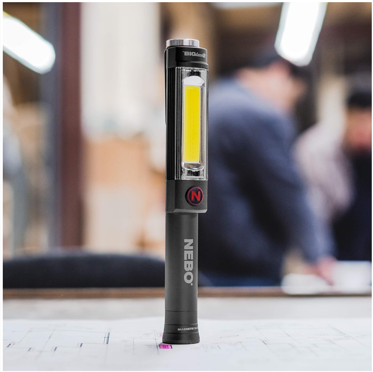
Figure 5: The versatile pocket clip and hanging hole for secure attachment and portability.