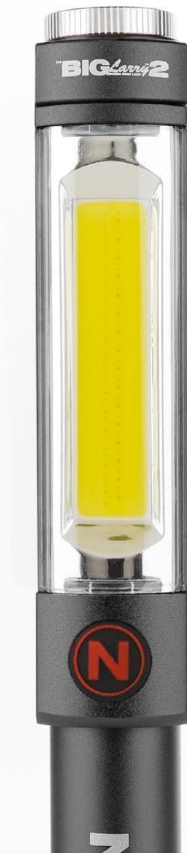
Figure 2: Internal components and features of the Big Larry 2, highlighting the COB worklight, flashlight, and pocket clip.