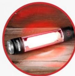
RED HAZARD FLASHER