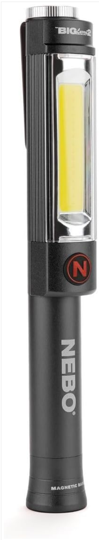
Figure 1: NEBO Big Larry 2 Work Light, showcasing its sleek design and integrated COB light panel.