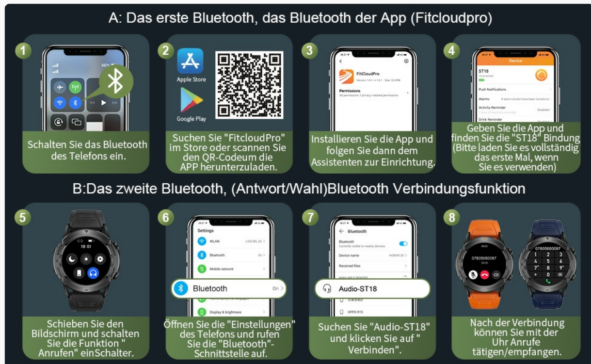
Image: A visual representation of various practical functions available on the LIGE ST18 Smartwatch, including alarm, stopwatch, music control, and weather.