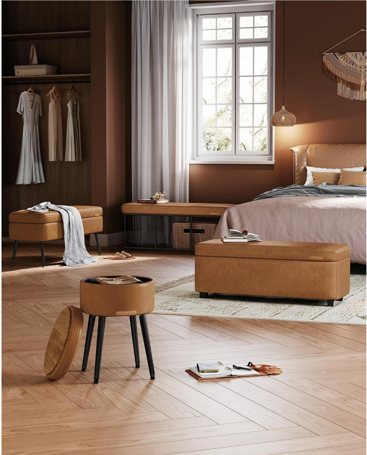
Image: The storage ottoman with its lid open, revealing the spacious interior compartment, suitable for storing various items.

The storage compartment is ideal for blankets, pillows, books, or other household items. Do not exceed the maximum static load capacity of 132 lb (60 kg) for the storage compartment.