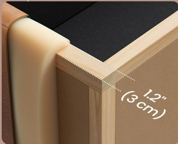
Robust Solid Wood Frame