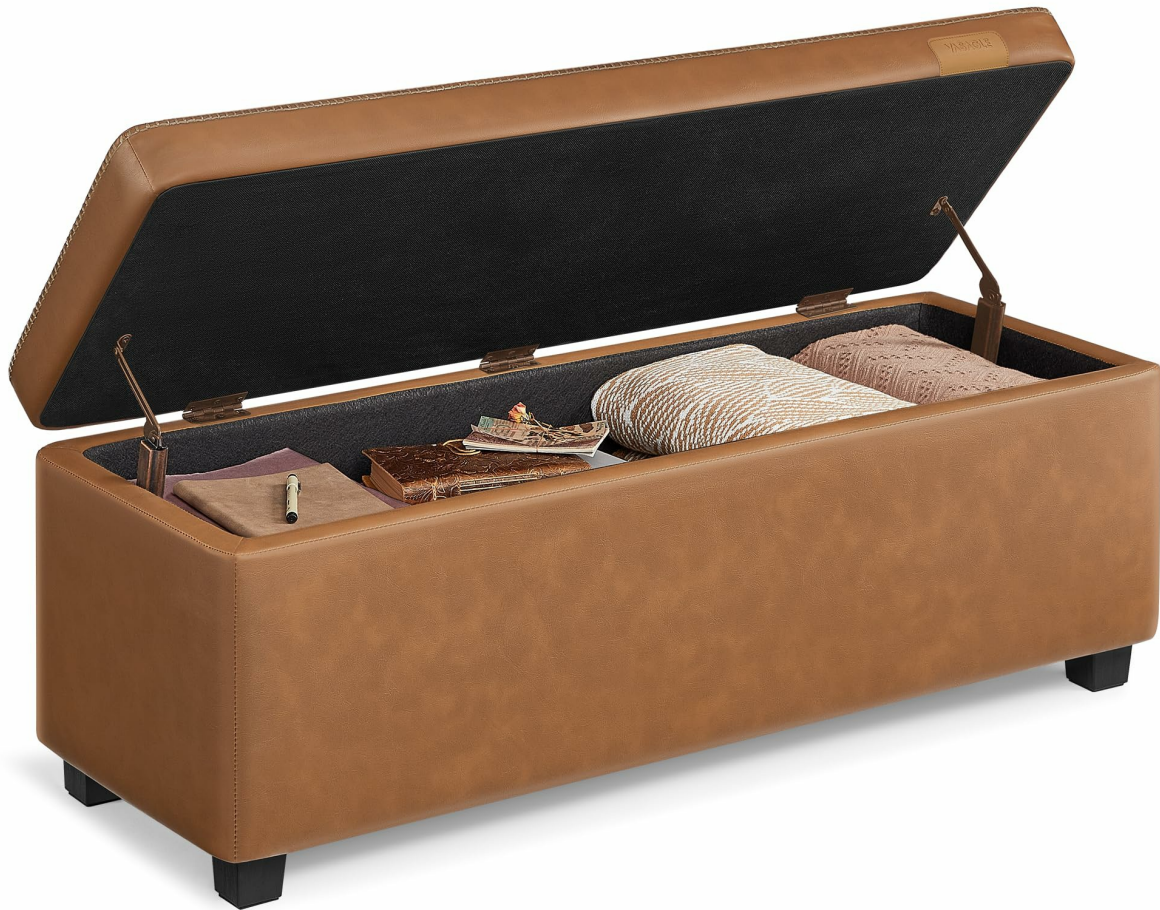
Image: The VASAGLE EKHO Collection 25-Gallon Storage Ottoman Bench in Caramel Brown, showcasing its design and color.