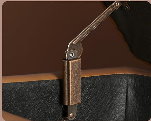
Quality Hinges for Lasting Use

Image: A detailed view highlighting the robust solid wood frame construction and the quality safety hinges that ensure smooth and secure lid operation.