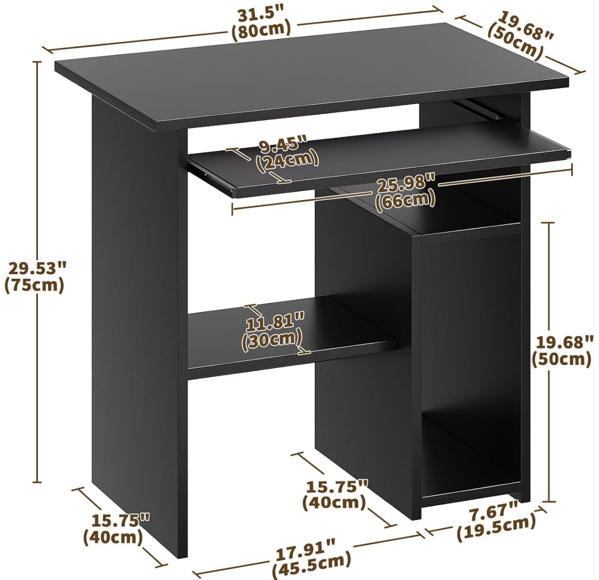
Image 1: The ALISENED Home Office Computer Desk in a typical setup, showcasing its compact design and integrated features.