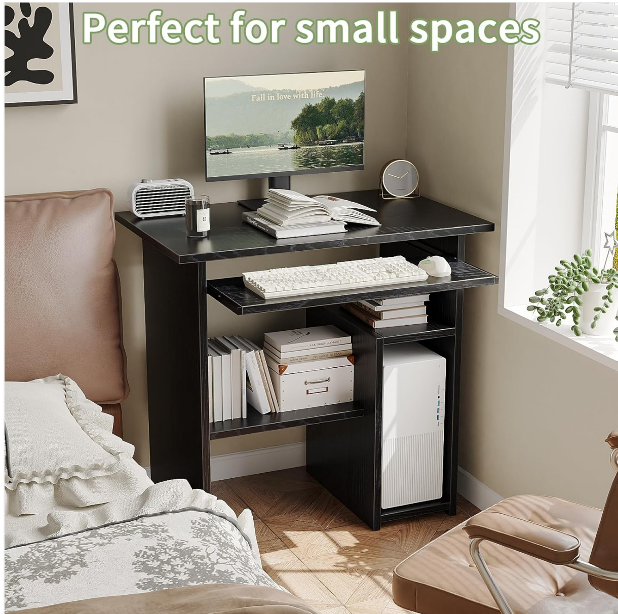
Image 4: A detailed view of the ample storage space provided by the desk's shelves and the integrated CPU holder, showing organized items.

Utilize the multiple shelves for organizing books, documents, and office supplies. The dedicated CPU holder provides a secure and accessible space for your computer tower, keeping it off the floor and integrated into the desk's design.