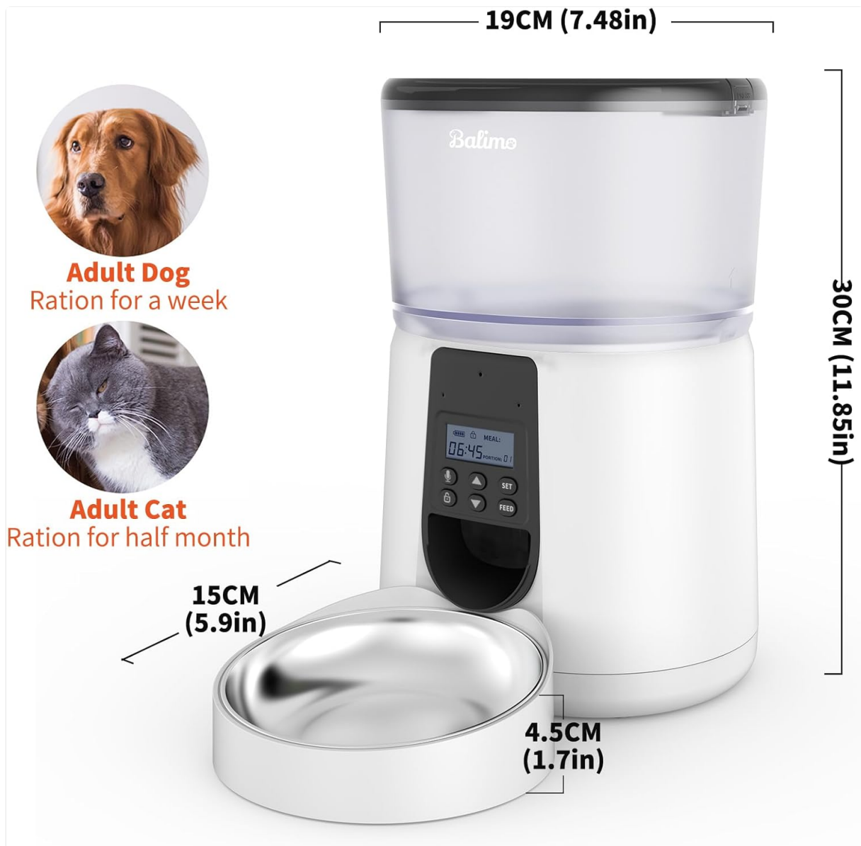
Image 9.1: Product dimensions and feeding capacity for different pets.