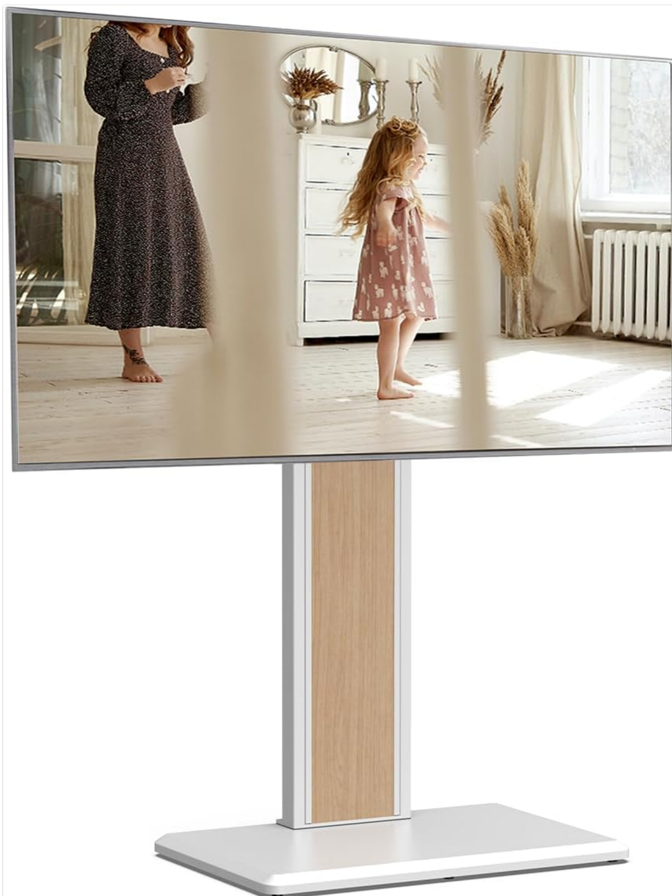
Image: The FITUEYES F02W1443N Low-Type TV Stand with a television mounted, illustrating the assembled product in a living space.