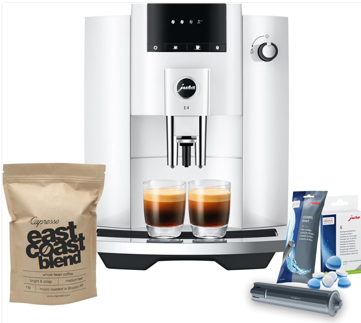
Image: The Jura E4 Automatic Coffee Machine in Piano White, accompanied by a bag of East Coast Blend whole bean coffee, a CLEARLYL Smart+ water filter, and a package of Jura cleaning tablets.