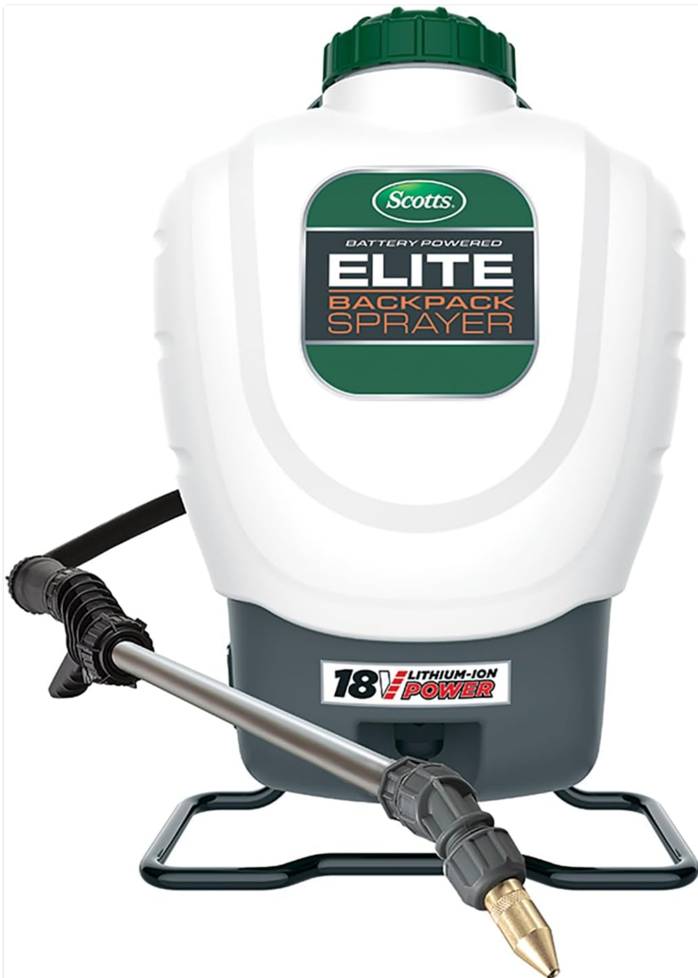
Image: The Scotts Elite 18V Lithium-Ion Powered Backpack 4 Gallon Sprayer, showing the main unit with the wand and nozzle attached.