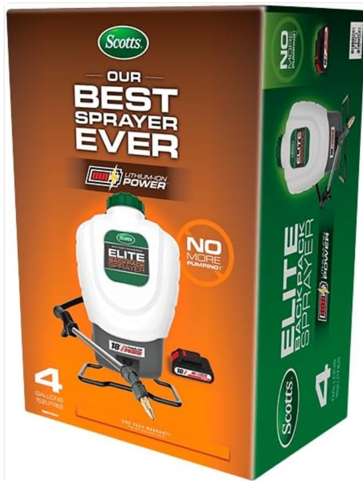
Image: The retail packaging for the Scotts Elite Backpack Sprayer, illustrating the product and its key features on the box.