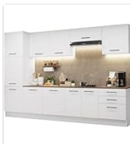
Figure 2.1: Example of furniture assembly. Ensure all parts are accounted for before starting.

Before assembly, verify that all components and hardware are present. Refer to the included user-friendly illustrated instructions for a detailed list of parts and hardware.