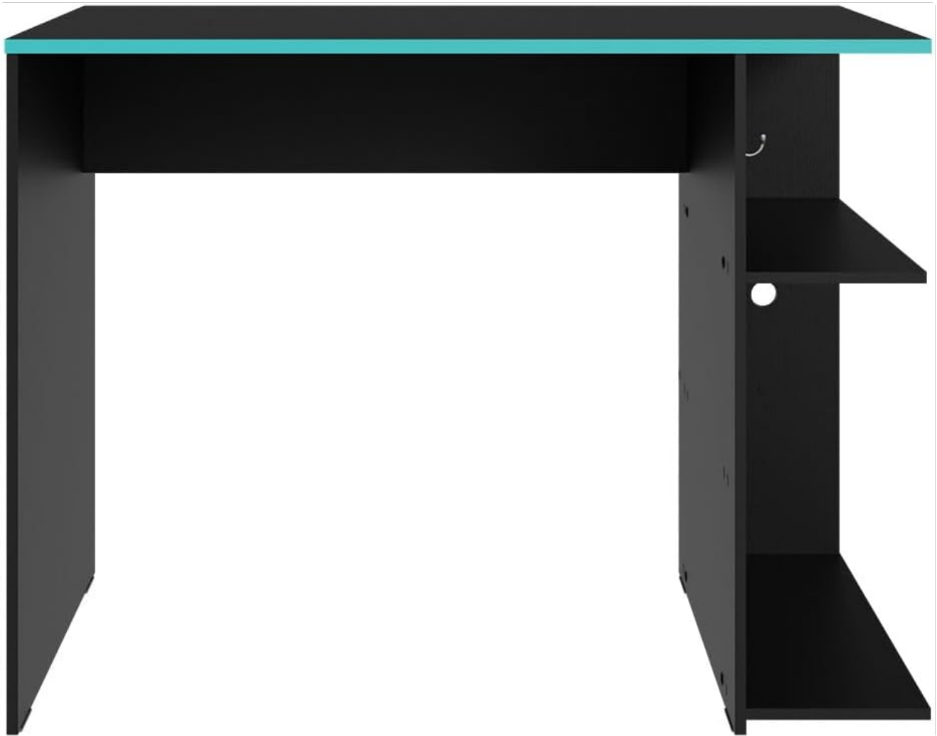
Figure 7.1: Detailed dimensions of the Madesa 9425CF Gaming Computer Desk.