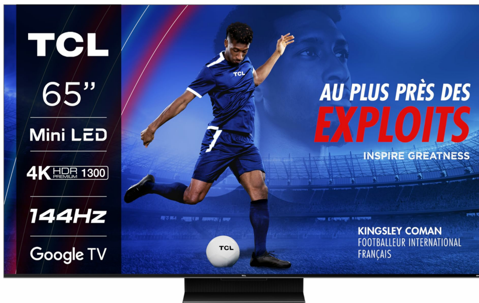
Image: Front view of the TCL 65QM8B TV on its stand.

Carefully remove the TV from its packaging. It is recommended that two people handle the TV due to its size and weight. Place the TV on a flat, stable surface or prepare for wall mounting.