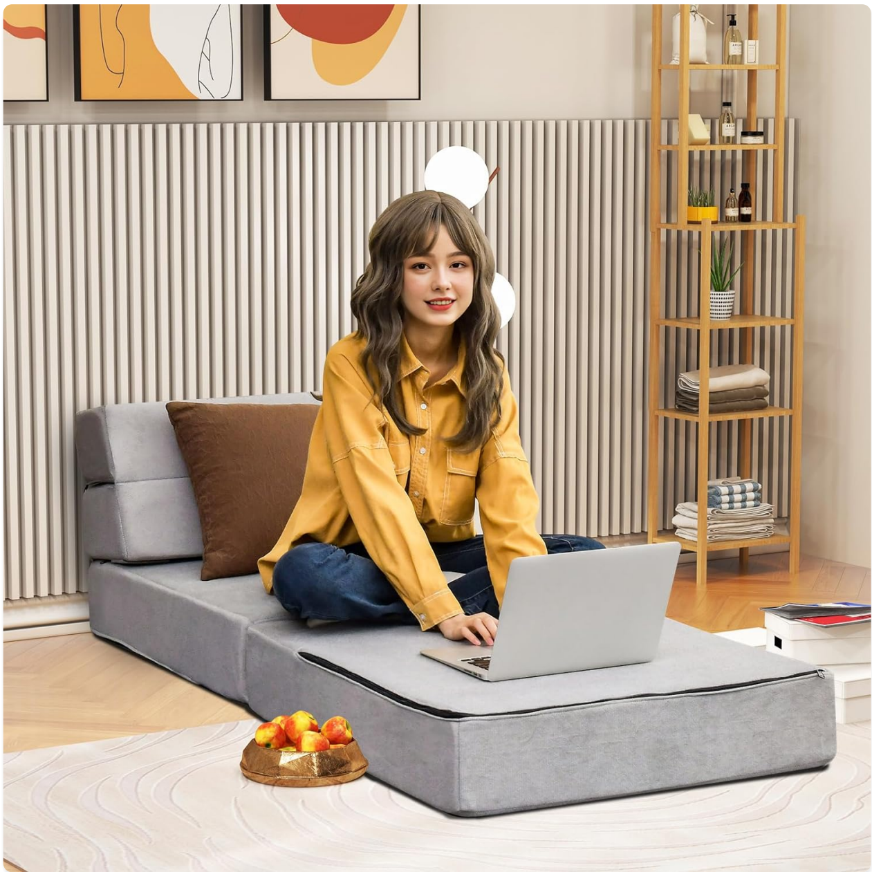
Figure 1: Initial setup of the RELAX4LIFE Folding Sofa Bed Chair in sofa mode.

Your browser does not support the video tag.