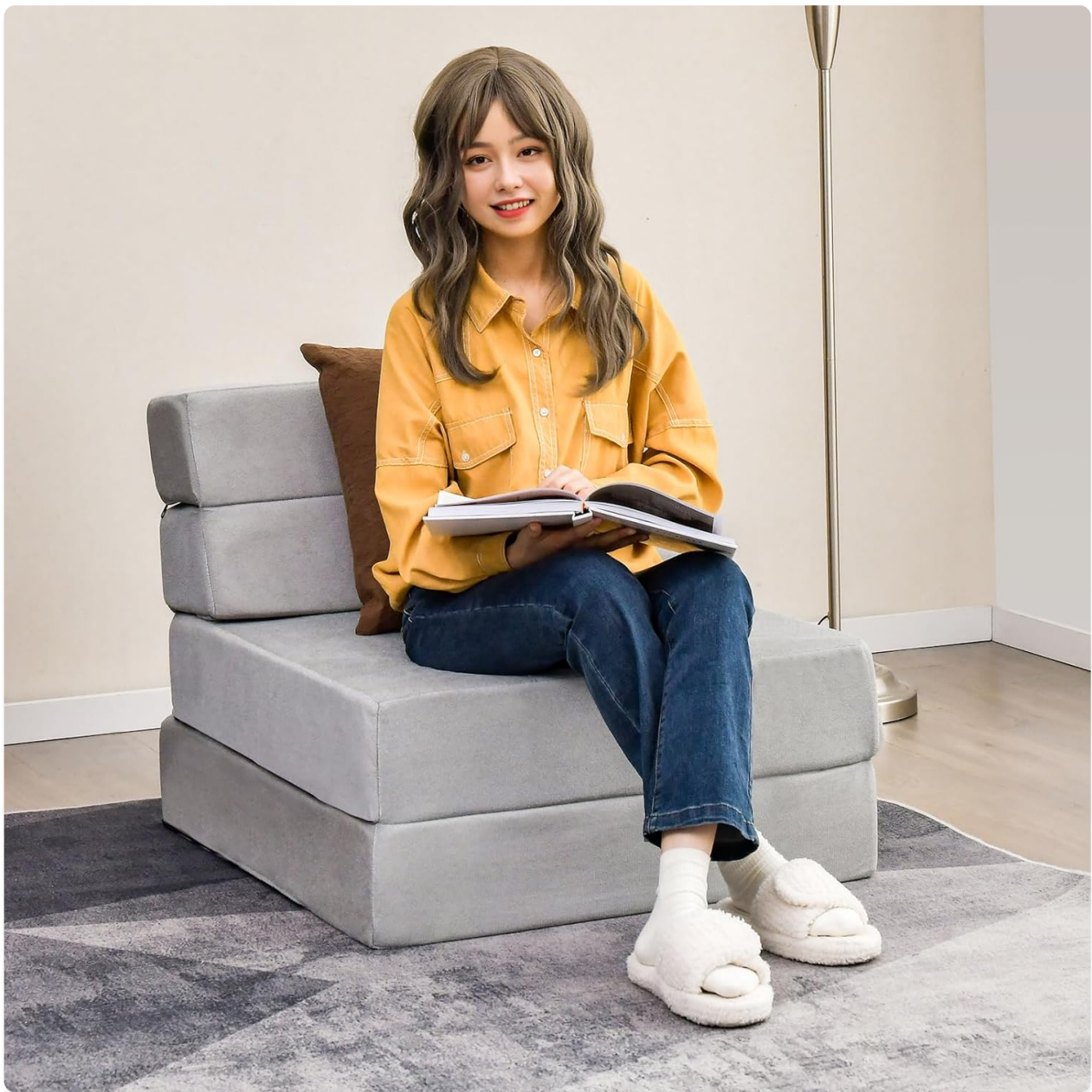
Figure 7: Illustration of the comfortable and medium-firm sponge material.