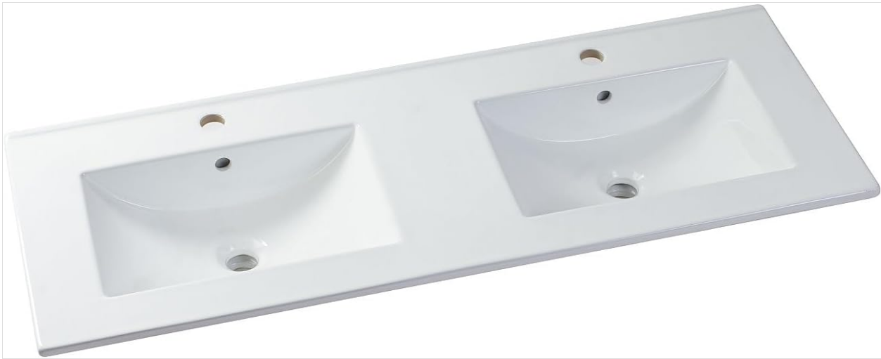
Image 6.1: Top view of the white MOTIAC ceramic sink, highlighting its smooth, glossy finish.