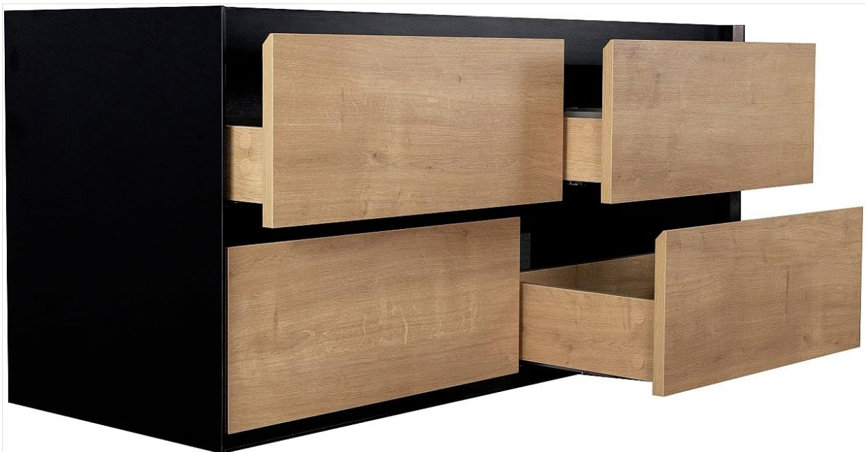
Image 4.2: The LANNICK vanity with its four soft-close drawers partially extended, showcasing the storage capacity.