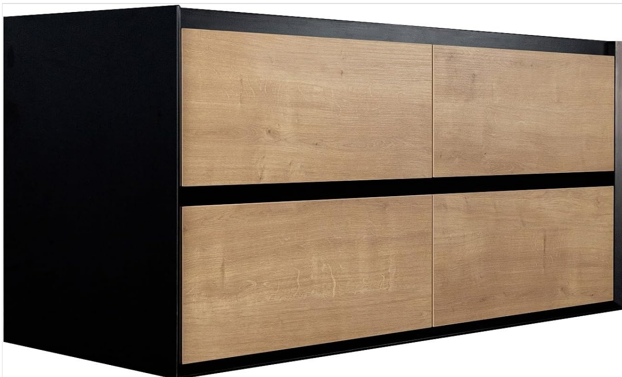
Image 1.1: Front view of the LANNICK bathroom vanity with integrated MOTIAC sink.

The Vente-unique LANNICK bathroom vanity is a modern, wall-mounted furniture piece designed to enhance your bathroom with both style and functionality. It features a light natural and black finish, constructed from MDF, and includes four soft-close drawers for ample storage. The unit is complemented by an integrated MOTIAC ceramic sink, designed for durability and ease of cleaning.