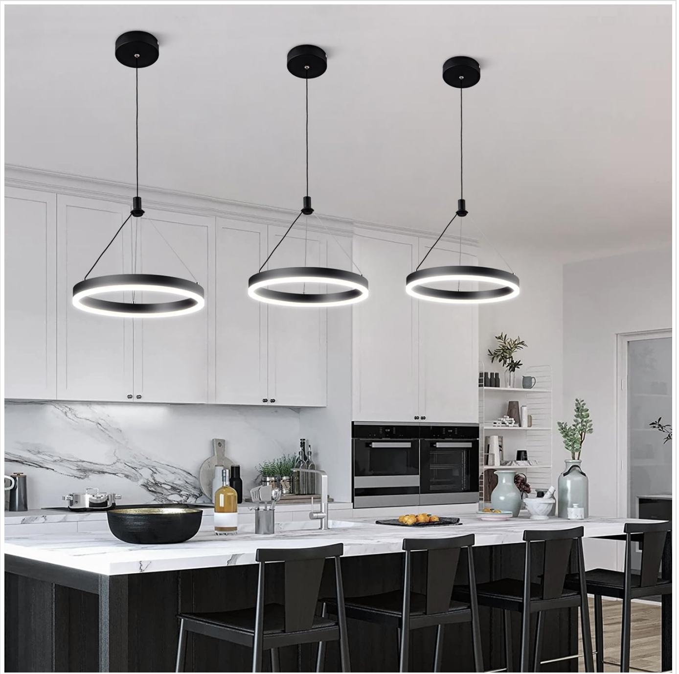
Image: The chandelier providing neutral 4000K light in a dining room setting, demonstrating its illumination capabilities and aesthetic integration.