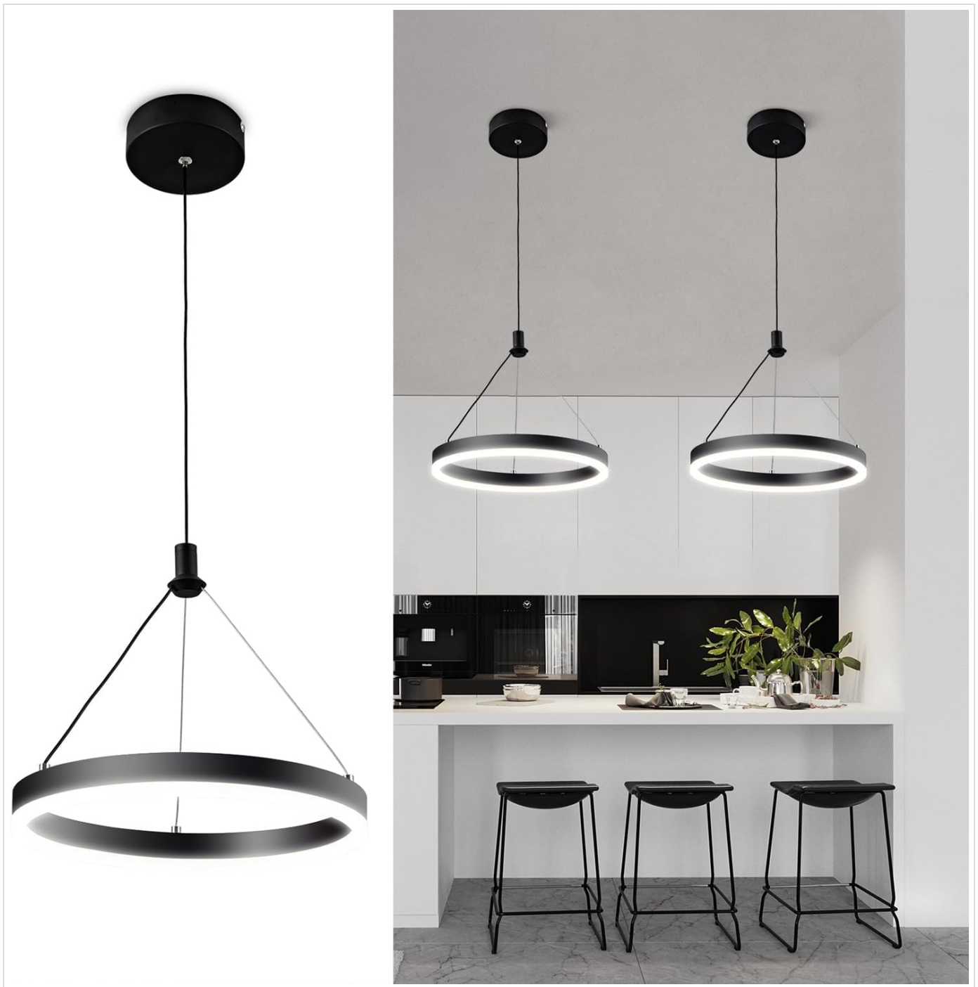
Image: The Viruhaka Modern LED Chandelier, Model Vi8621, showcasing its sleek design and adjustable suspension. This image illustrates the overall appearance of the installed fixture.