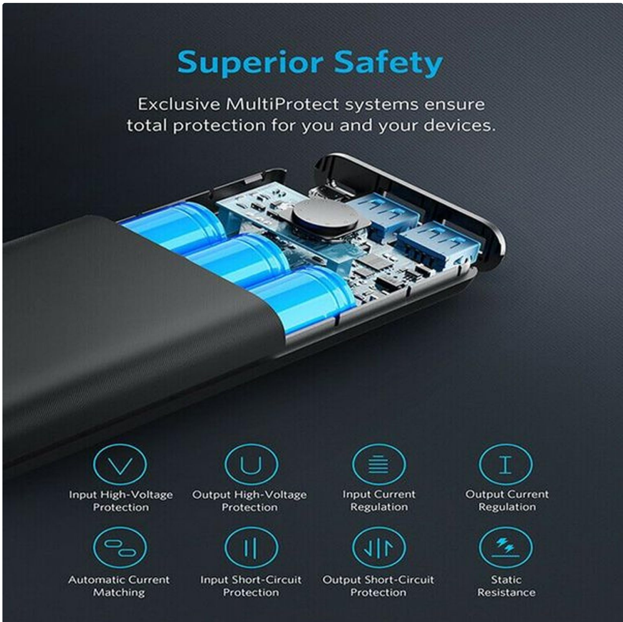
Image: Diagram illustrating Anker's MultiProtect safety features, including input/output voltage protection, current regulation, and short-circuit protection.