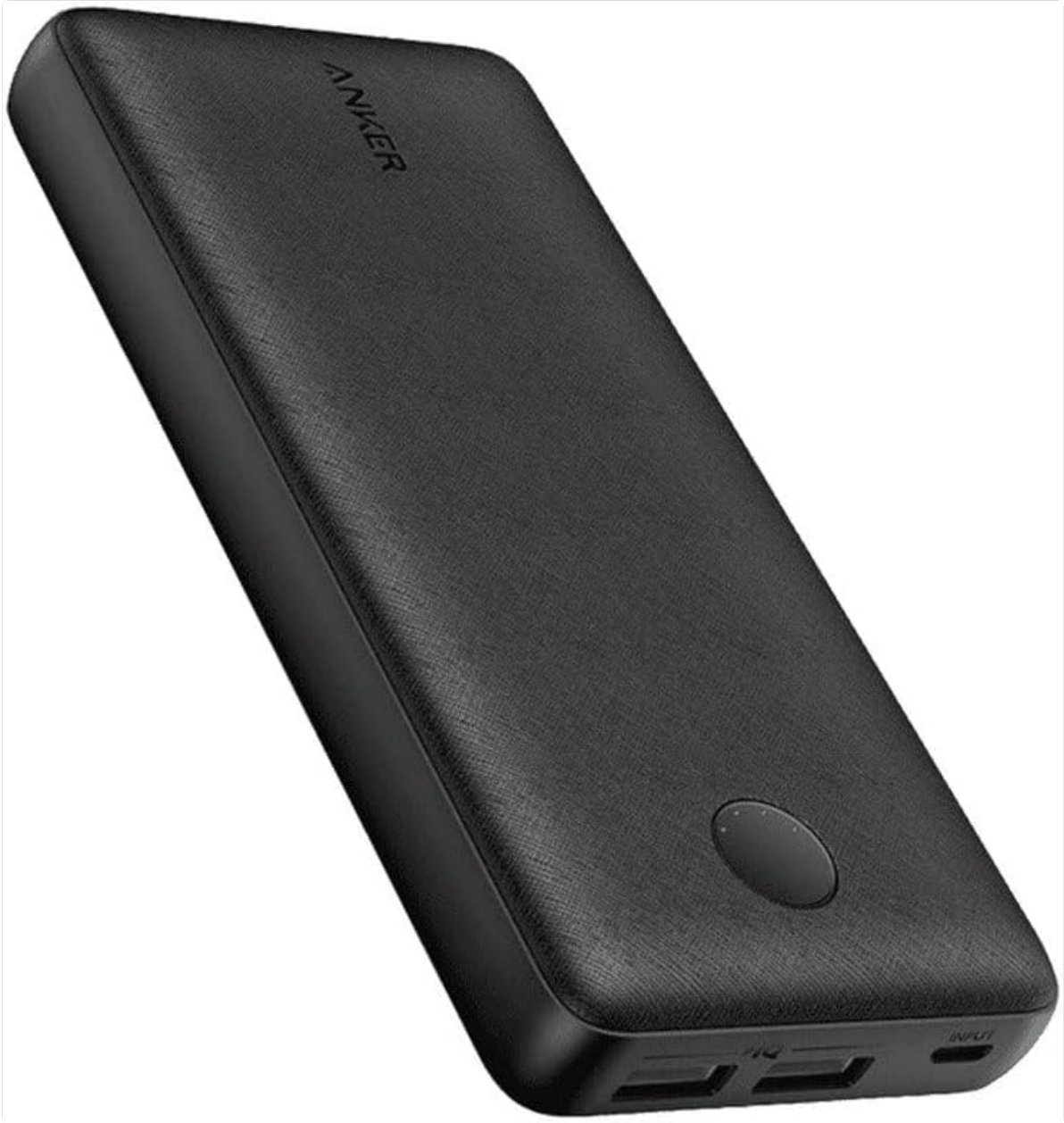
Image: The Anker PowerCore Select 20000 Power Bank, showcasing its sleek, compact design.