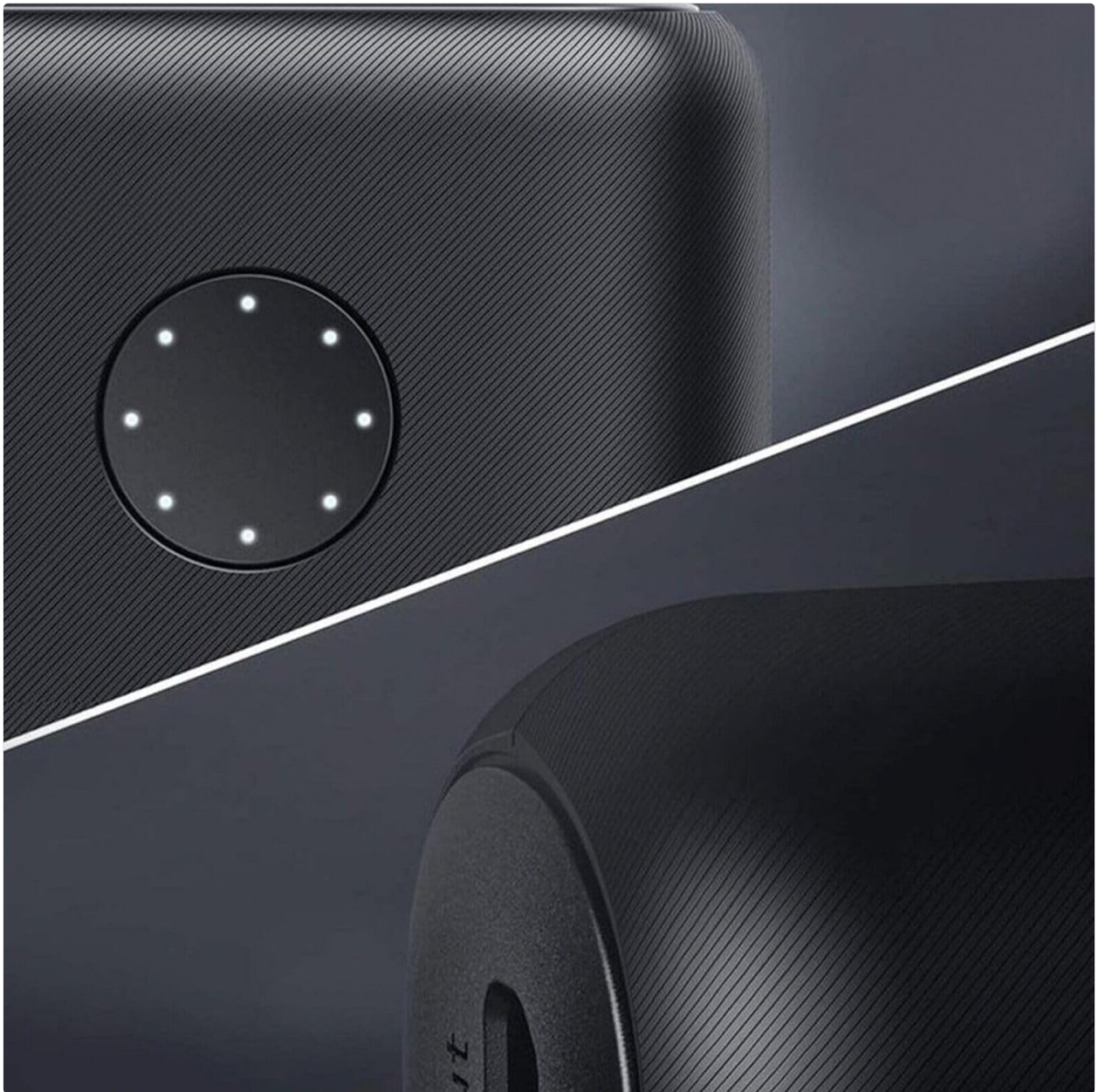
Image: Close-up of the circular LED indicator on the PowerCore, showing multiple illuminated dots indicating battery level.