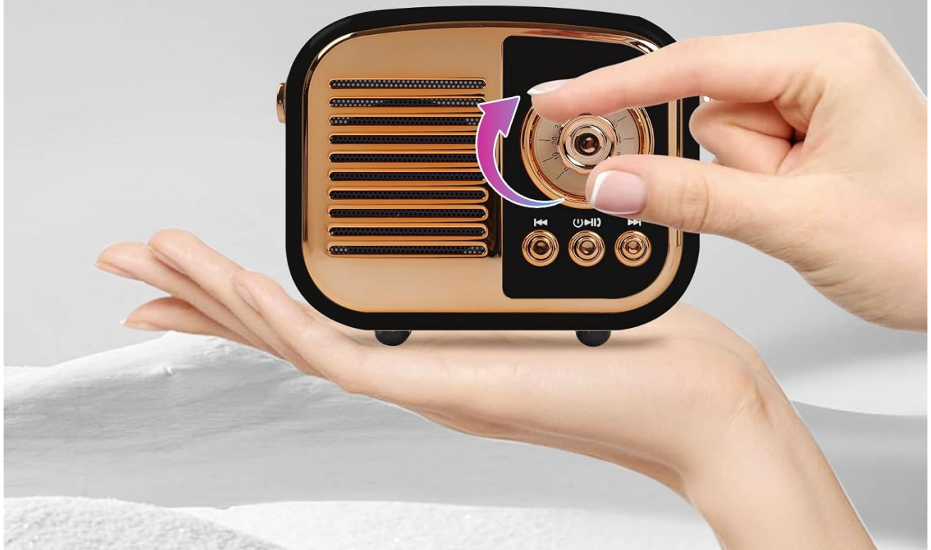
Image 1: Front view of the Aresrora Retro Bluetooth Speaker. It features a classic radio dial design with a speaker grille on the left and control buttons on the right.