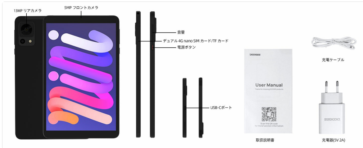
Diagram illustrating the tablet's components and included accessories.

Verify that all items are present in the package: