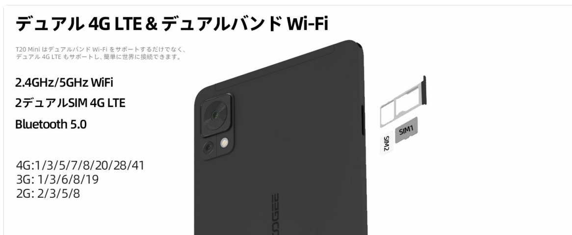
Illustration of the SIM/TF card slot and its functionality.

The tablet supports dual SIM cards and a MicroSD card for expanded storage.