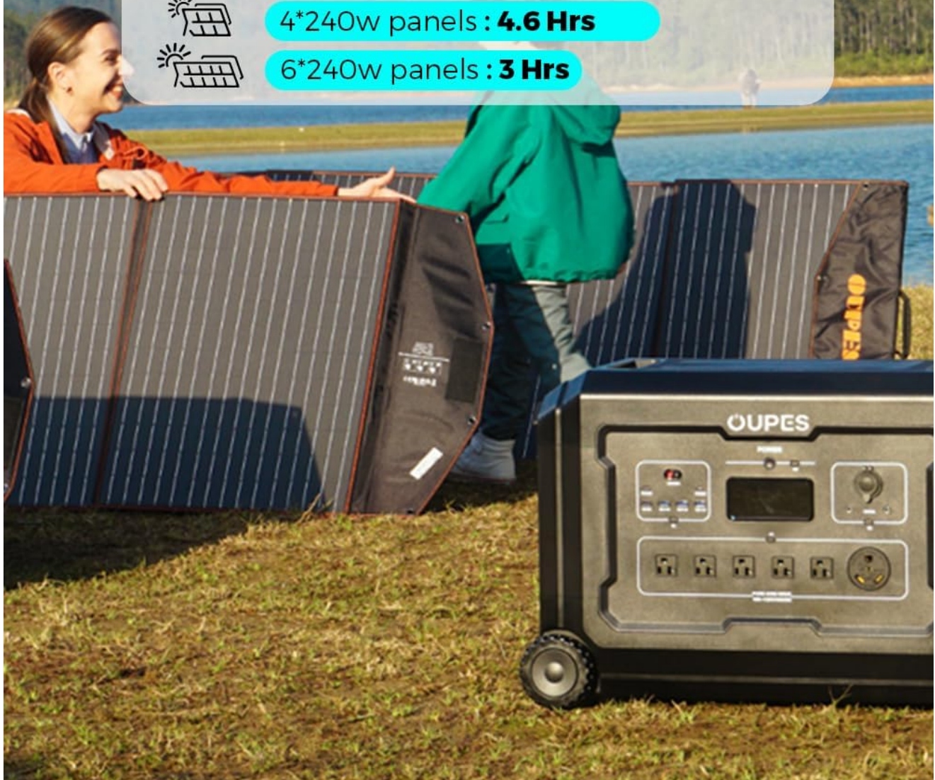
Figure 6: The OUPES Mega 3 provides a reliable emergency power supply with fast switch-overs.