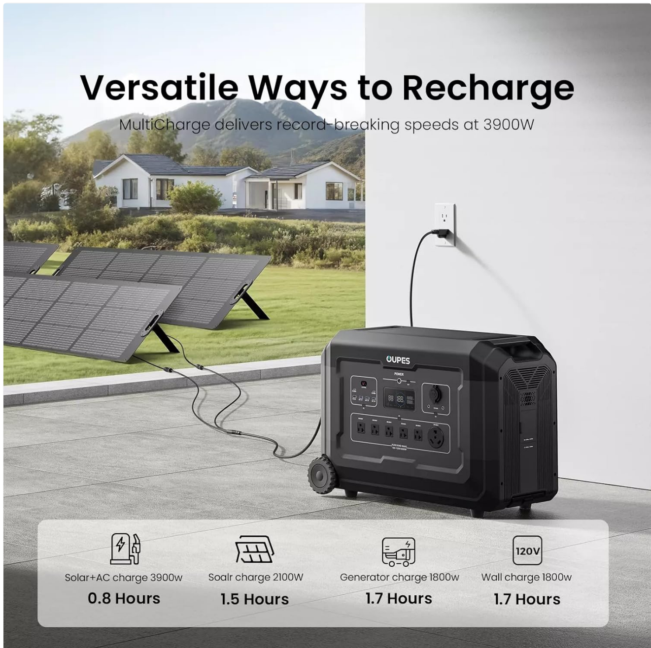
Figure 3: OUPES Mega 3 connected to solar panels for outdoor charging.

Video 3: How to connect multiple solar panels in series. This video provides instructions for connecting multiple solar panels in a series configuration.