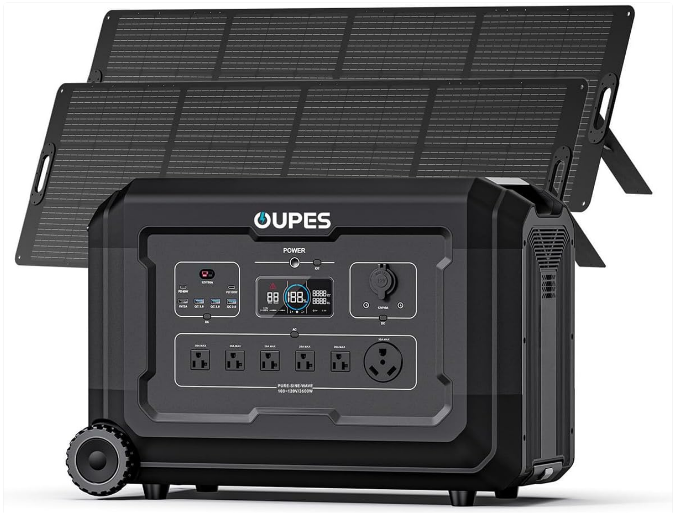
Figure 1: OUPES Mega 3 Portable Power Station with included 240W solar panels.