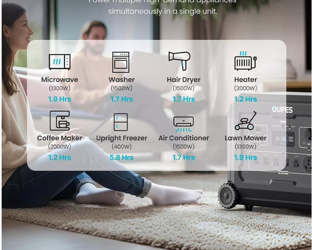
Figure 5: The OUPES Mega 3 can power almost everything, from microwaves to air conditioners.

Power multiple high-demand appliances simultaneously in a single unit.