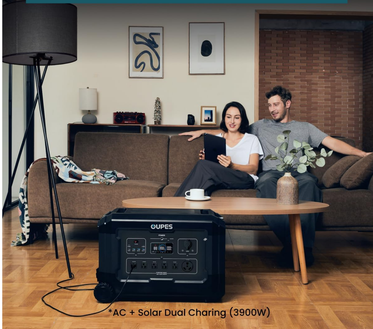
Figure 2: The OUPES Mega 3 can be fully charged in 0.8 hours (AC + Solar Dual Charging at 3900W).