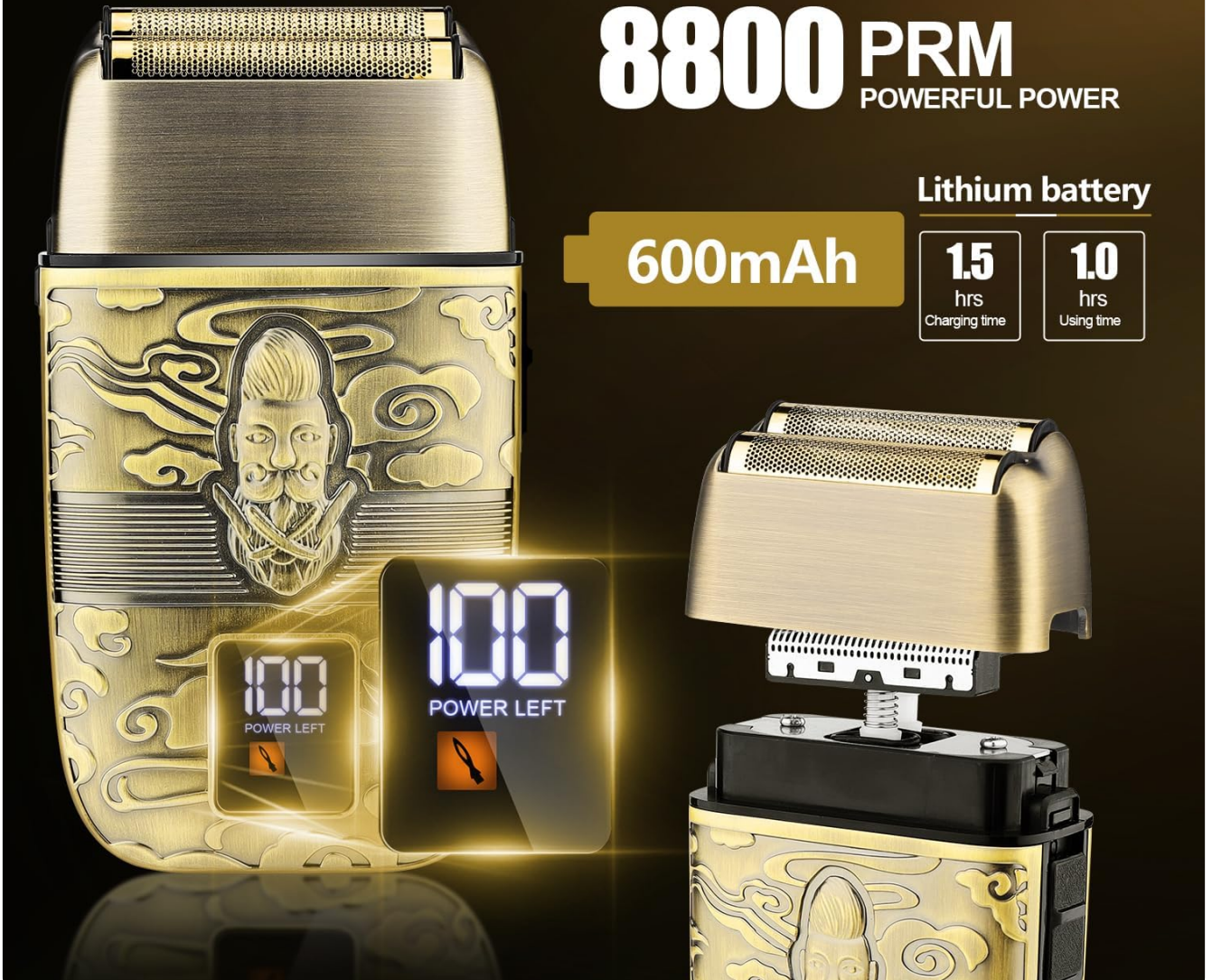
Image: The electric shaver displaying '100' on its LCD screen, indicating a full charge, with details on battery capacity and charging time.