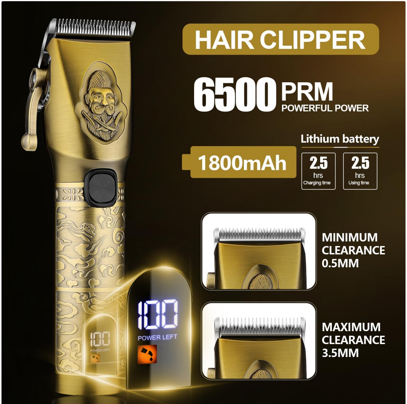
Image: The hair clipper displaying '100' on its LCD screen, indicating a full charge, with details on battery capacity and charging time.

Before first use, fully charge each device. The ultra-clear LED display will show the remaining charge. A full charge takes approximately 2.5 hours for the clipper, 2.0 hours for the trimmer, and 1.5 hours for the shaver.