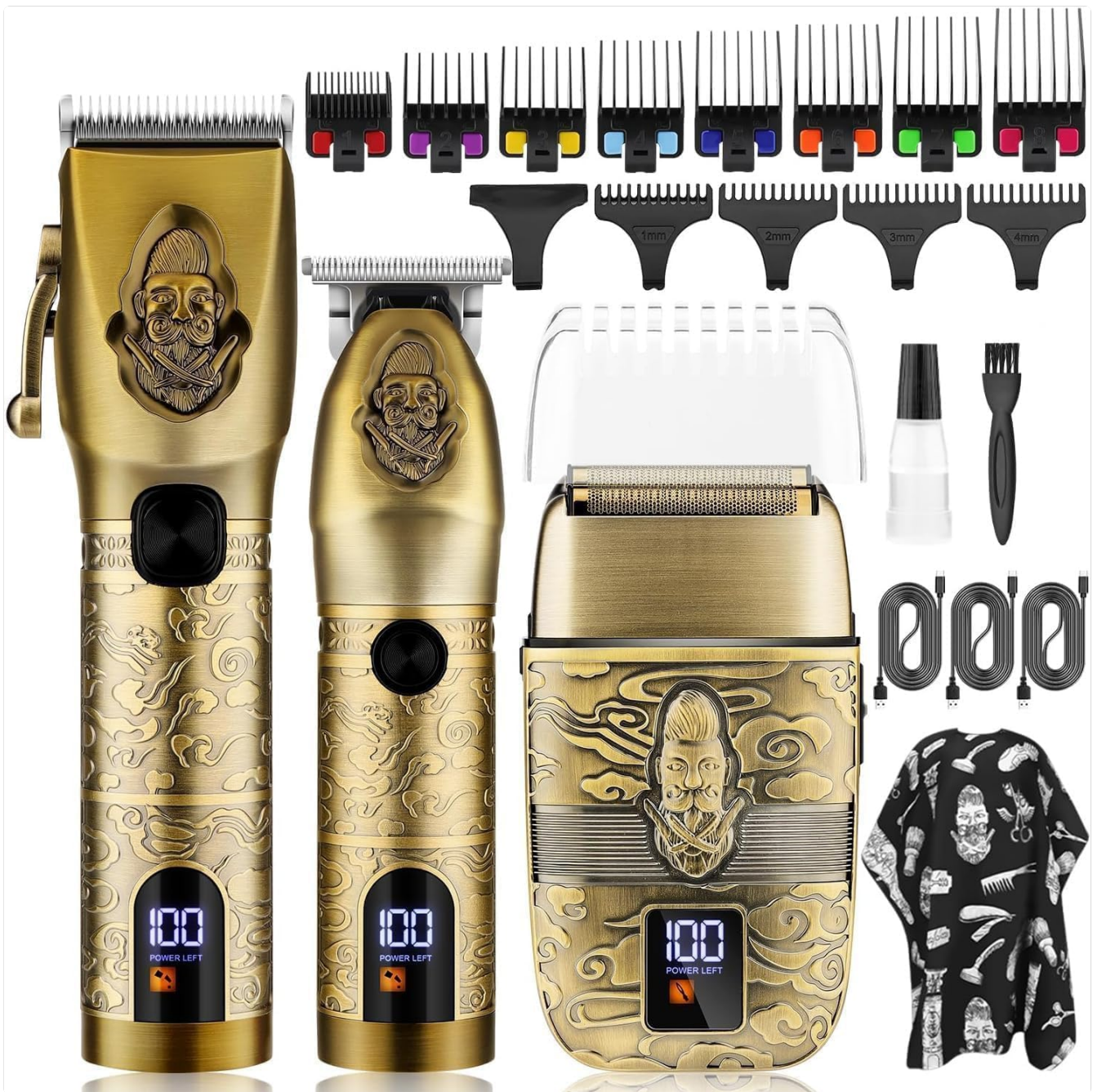
Image: The complete RESUXI Professional 3-in-1 Hair Grooming Set, featuring the hair clipper, T-blade trimmer, and electric shaver, along with various accessories.