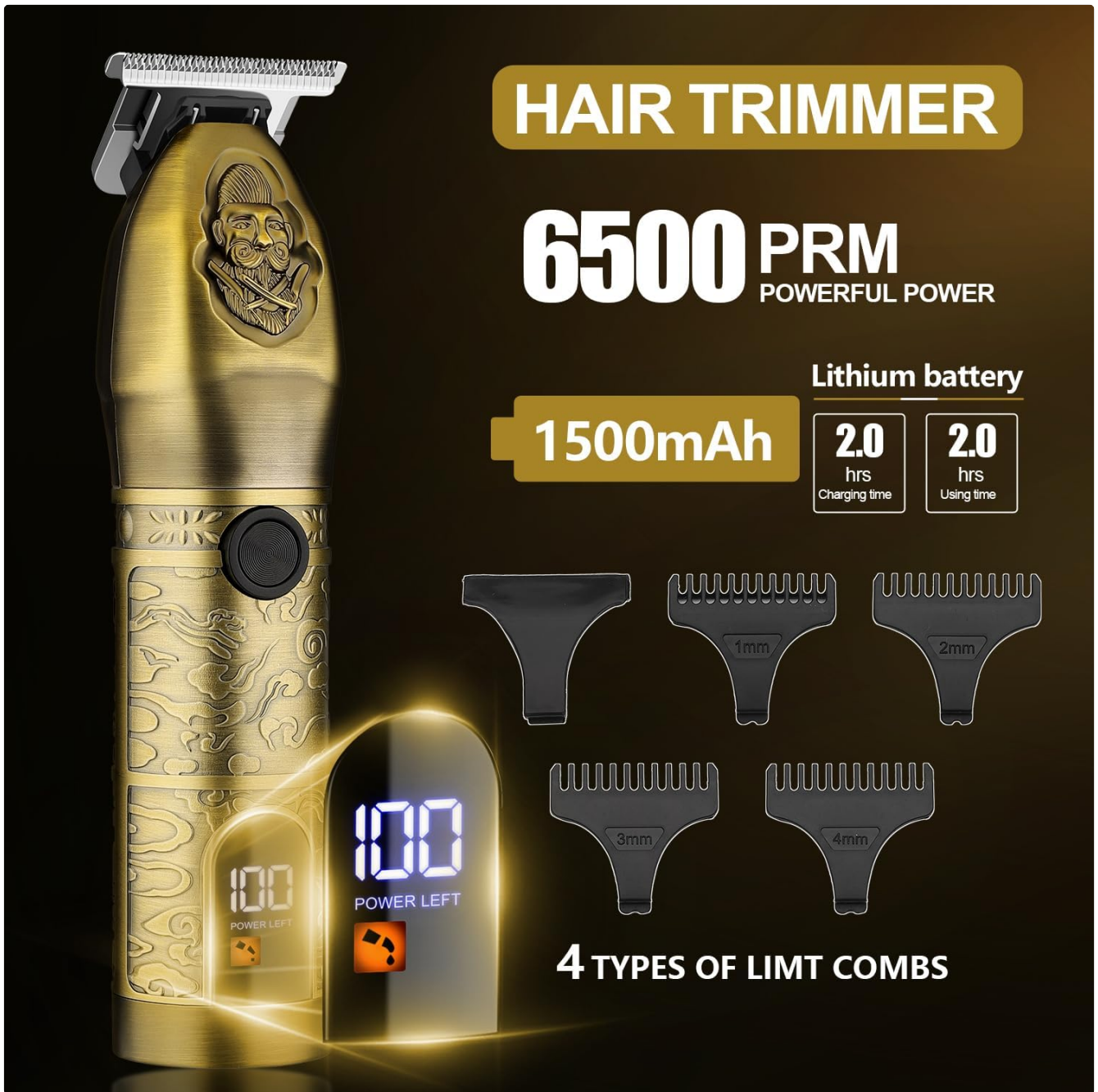
Image: The T-blade hair trimmer displaying '100' on its LCD screen, indicating a full charge, with details on battery capacity and charging time.