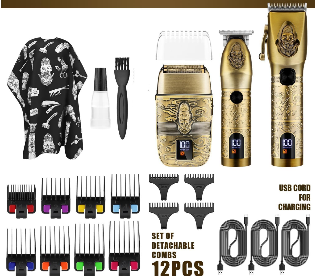
Image: A detailed view of all items included in the RESUXI grooming kit, neatly arranged, showing the three main devices, charging cables, cleaning tools, and various guide combs.