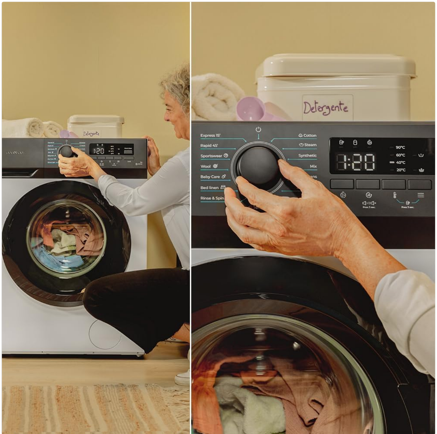
Figure 3.2: Detailed view of the control panel, showing the program dial, LED display, and touch controls for various functions.