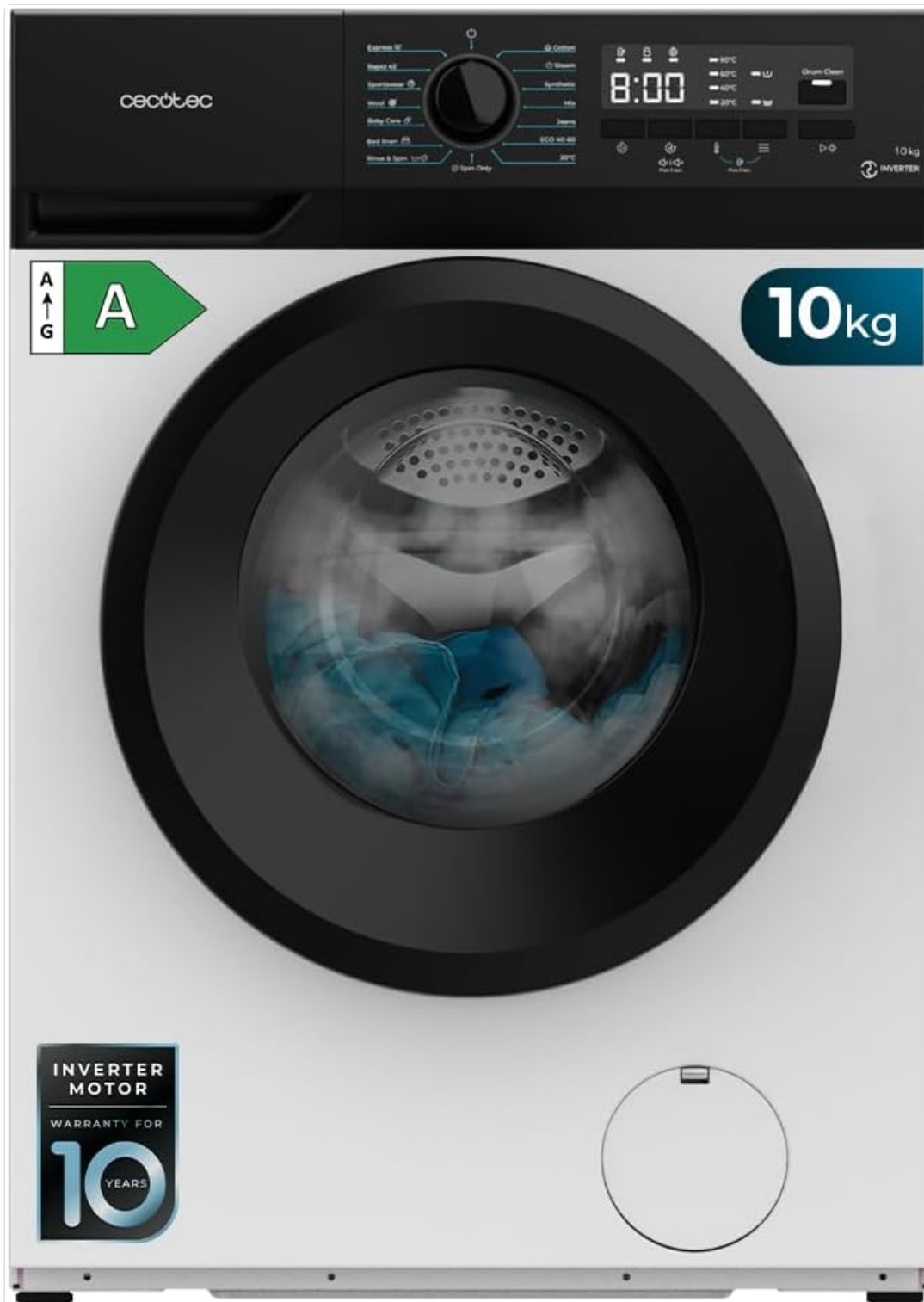
Figure 3.1: Front view of the Cecotec Bolero DressCode 10300 washing machine, showing the control panel, drum door, and 10kg capacity label.